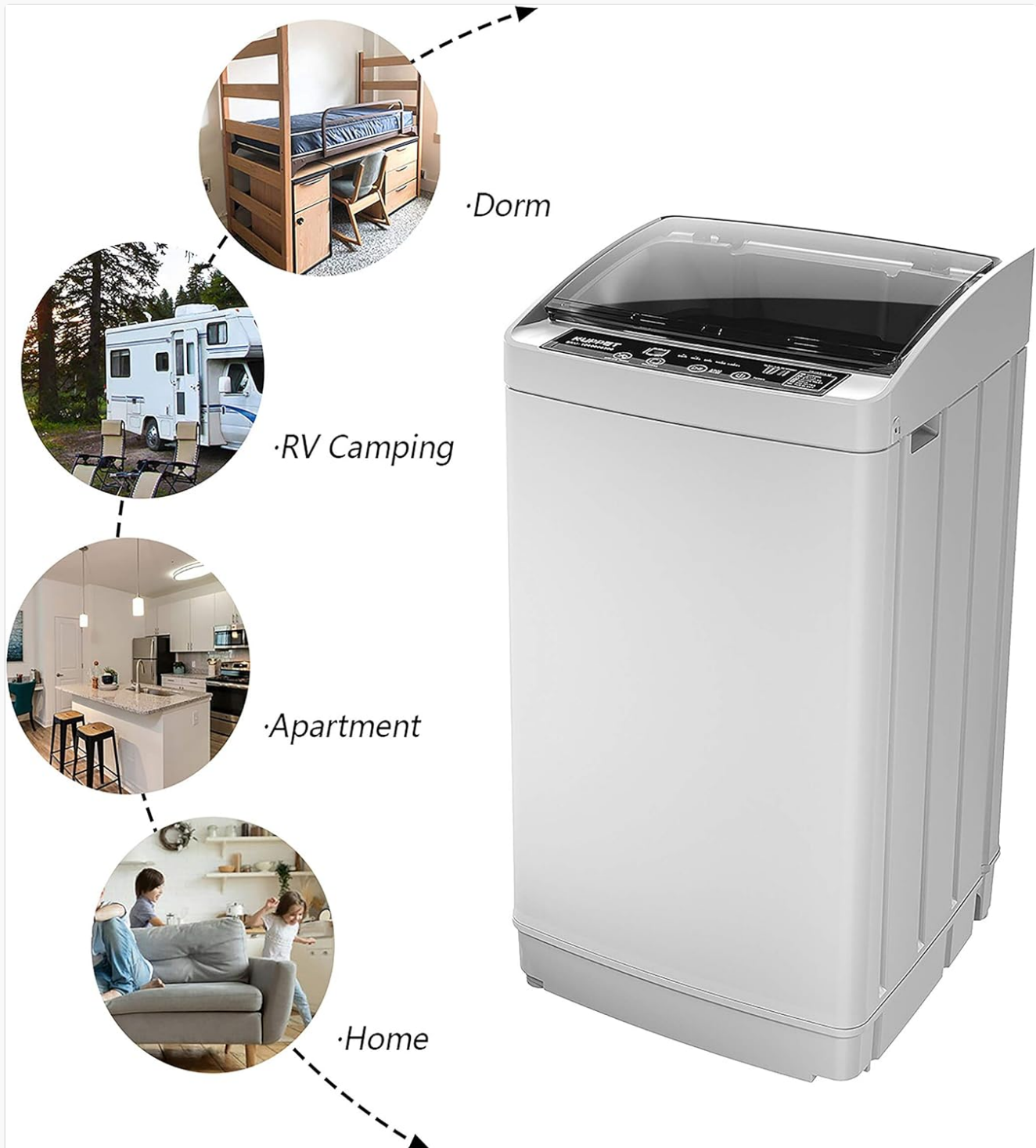
Image 3.1: Examples of suitable placement locations for the portable washing machine.