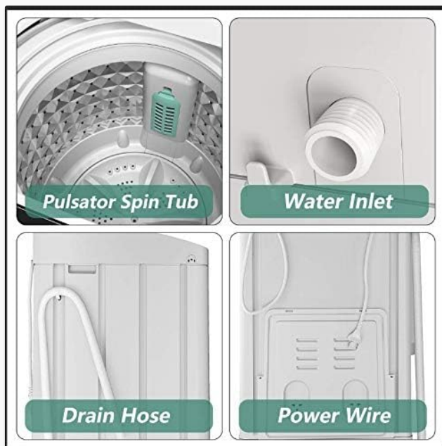
Image 2.1: Internal components including the pulsator spin tub, water inlet, drain hose, and power wire.