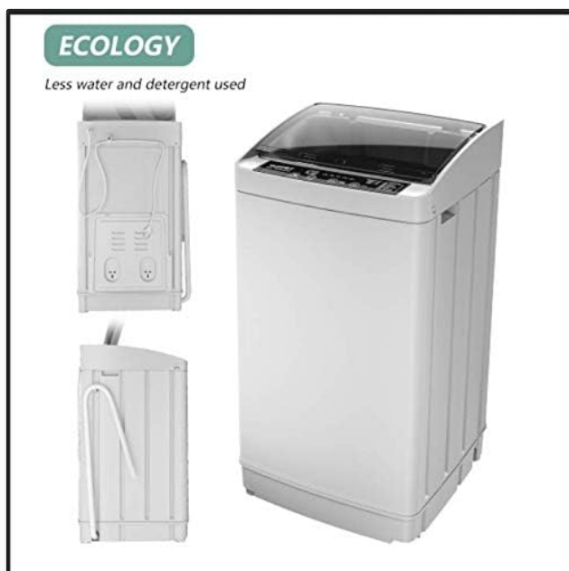
Image 2.3: Compact design promoting efficient water and detergent usage.