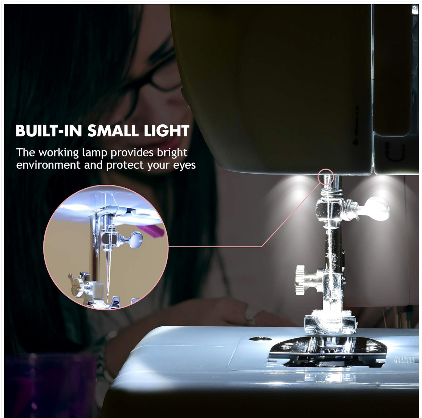
Figure 4.2: A close-up view of the built-in light illuminating the needle area, designed to provide bright working conditions and reduce eye strain.

The built-in light illuminates the sewing area. It can be turned on or off independently of the machine's operation, providing better visibility for intricate work.