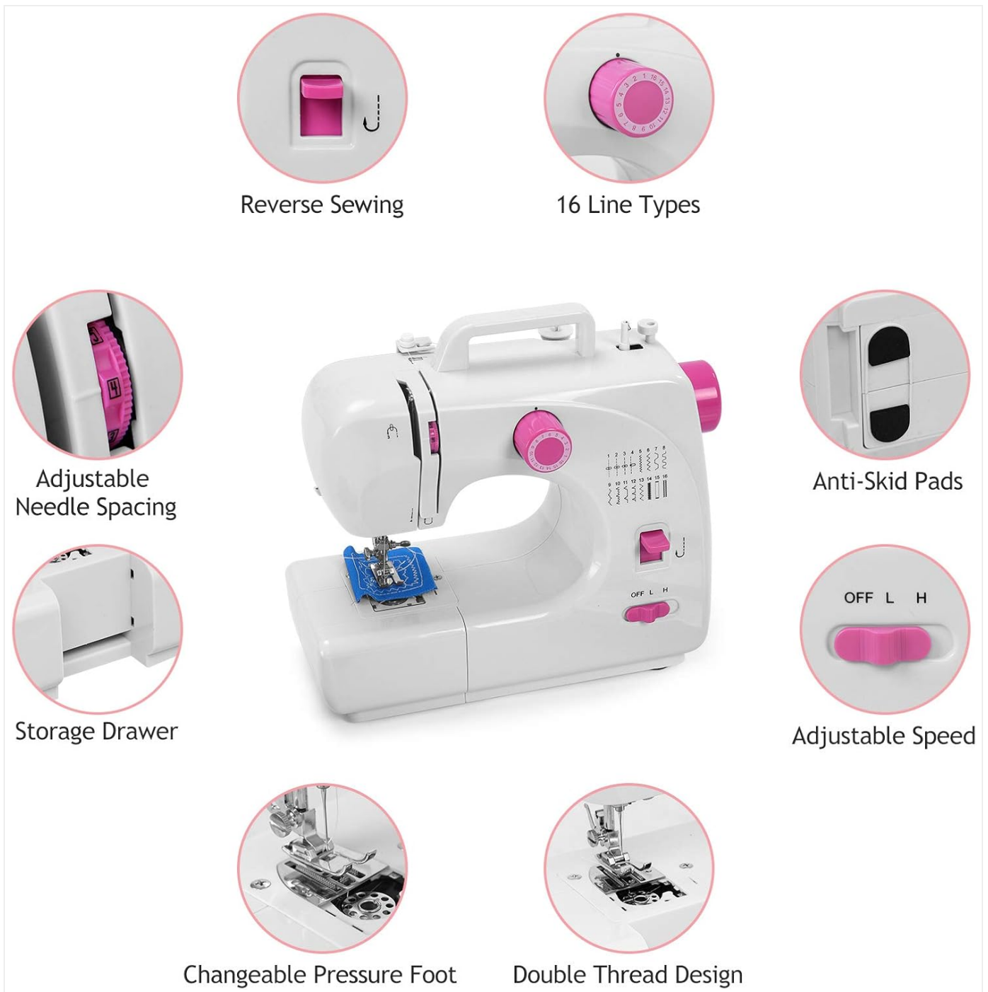
Figure 2.2: Diagram illustrating key features such as reverse sewing, 16 line types, adjustable needle spacing, anti-skid pads, storage drawer, adjustable speed, changeable pressure foot, and double thread design.