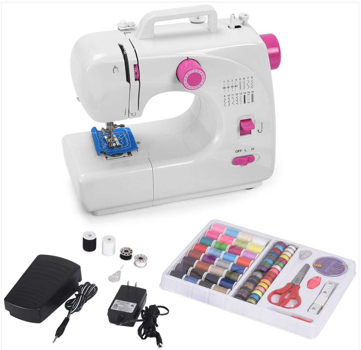
Figure 2.3: The sewing machine displayed alongside its comprehensive set of accessories, including various thread spools, bobbins, foot pedal, and power adapter.