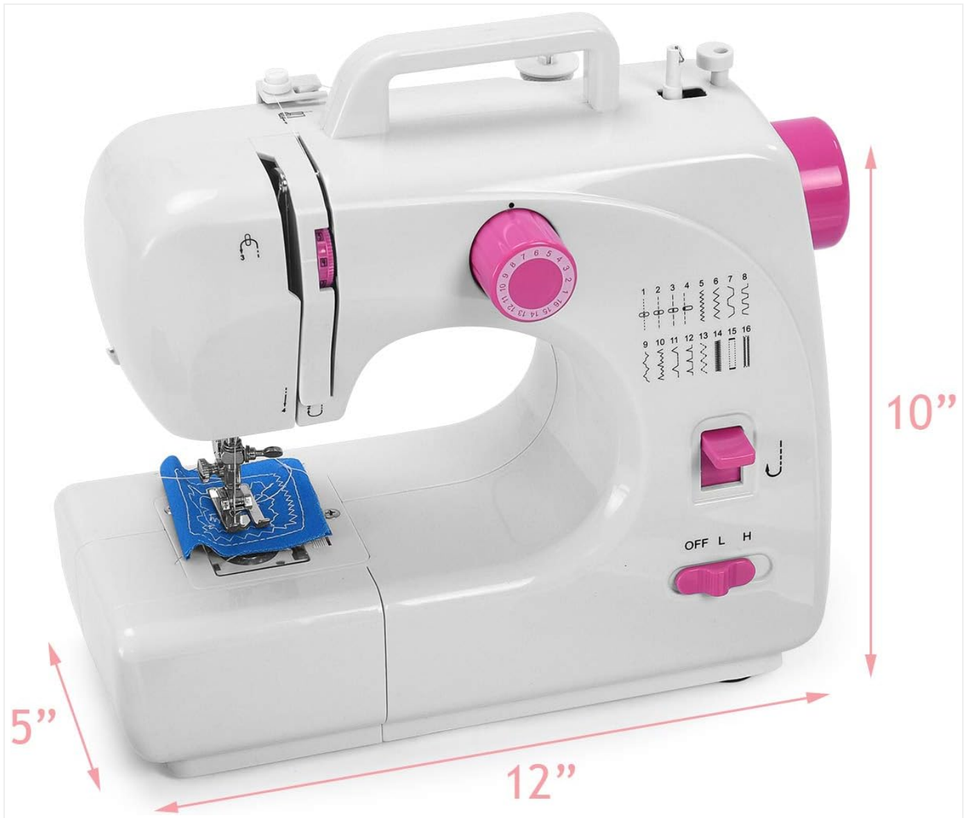
Figure 7.1: Diagram illustrating the dimensions of the sewing machine: 12 inches wide, 10 inches high, and 5 inches deep.