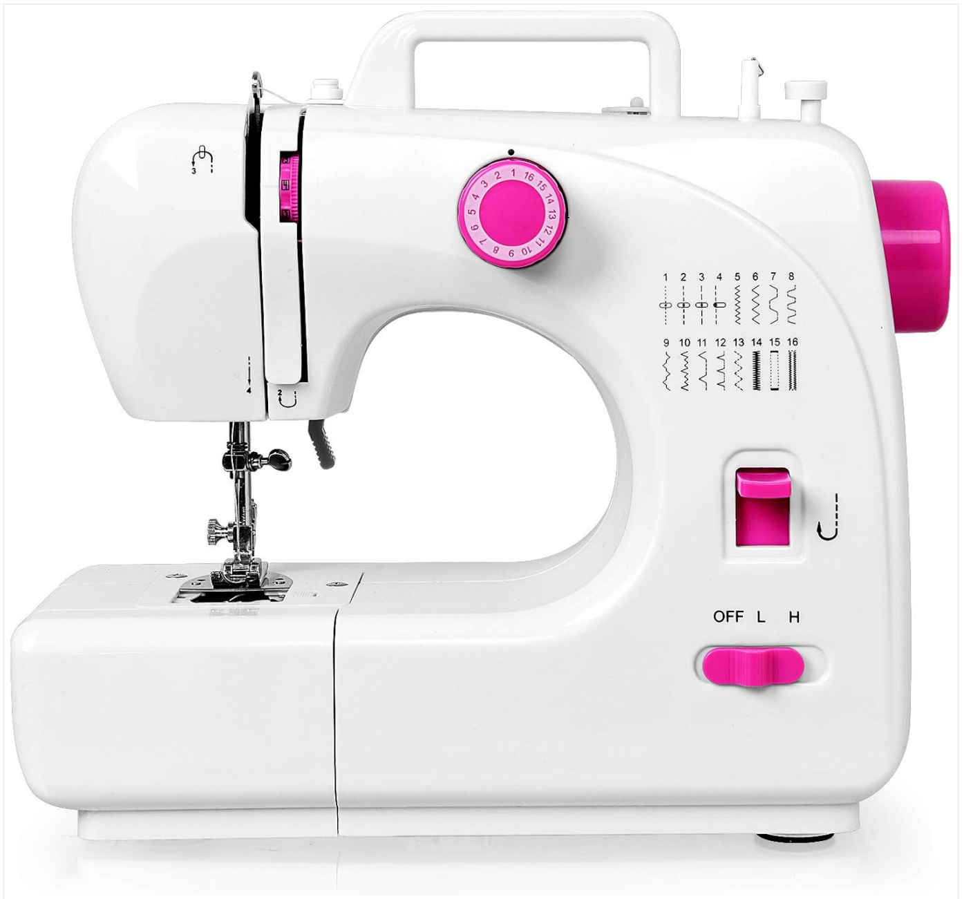
Figure 2.1: Front view of the Costway Portable Multifunctional Sewing Machine. This image displays the machine's compact size, the stitch selection dial, and the main controls.