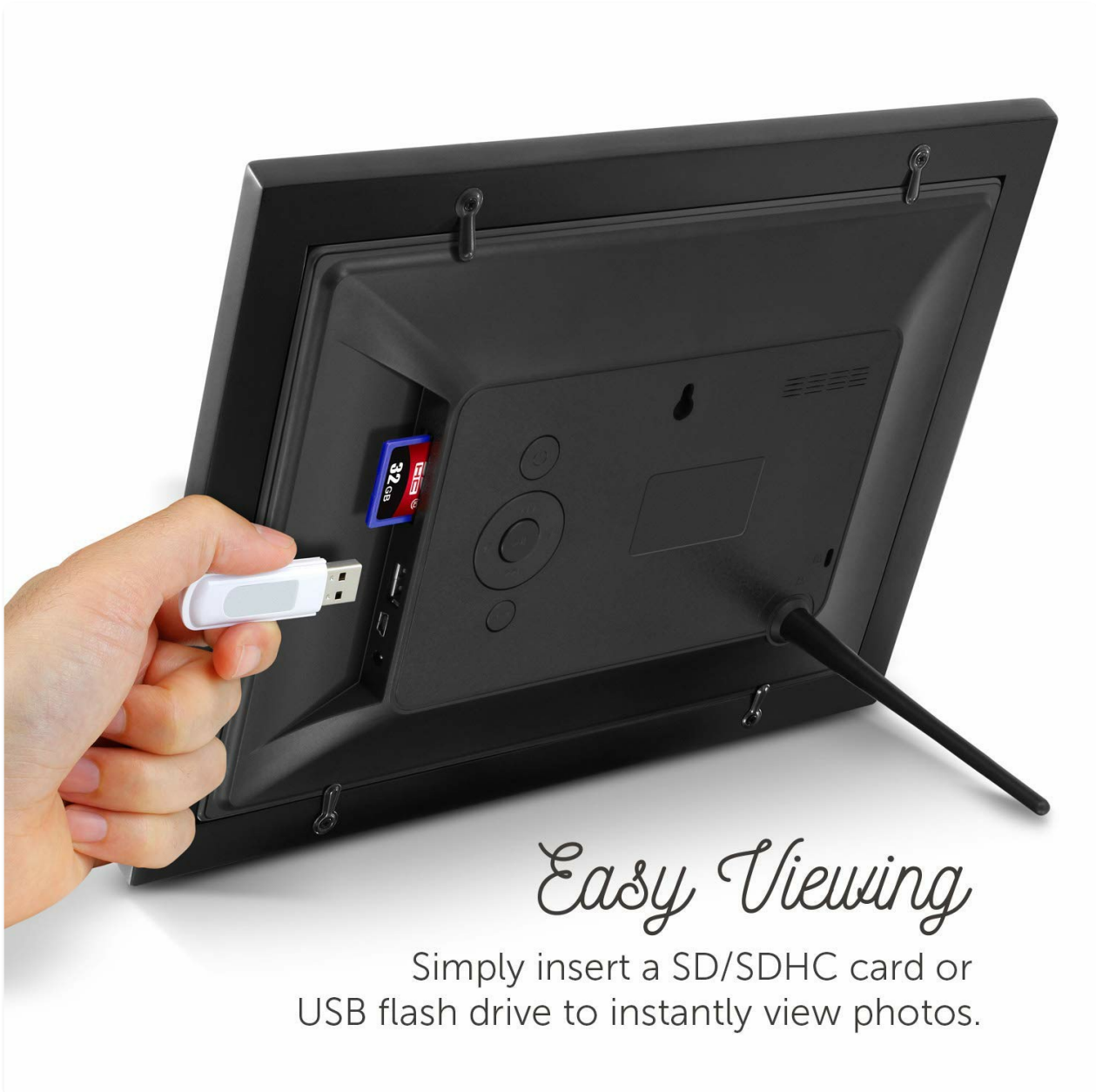
Image: Illustration of inserting a USB drive and SD card into the frame.

The frame supports SD/MMC/SDHC cards up to 32GB and USB flash drives. Simply insert your chosen memory device into the corresponding slot. The frame will automatically detect the device and display its contents.