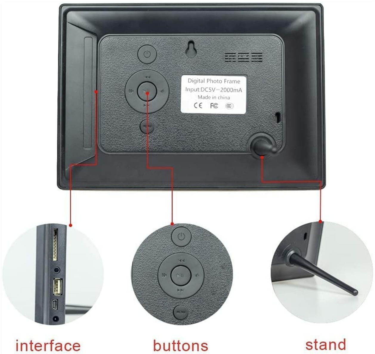
Image: Detailed rear view showing the interface, buttons, and stand.