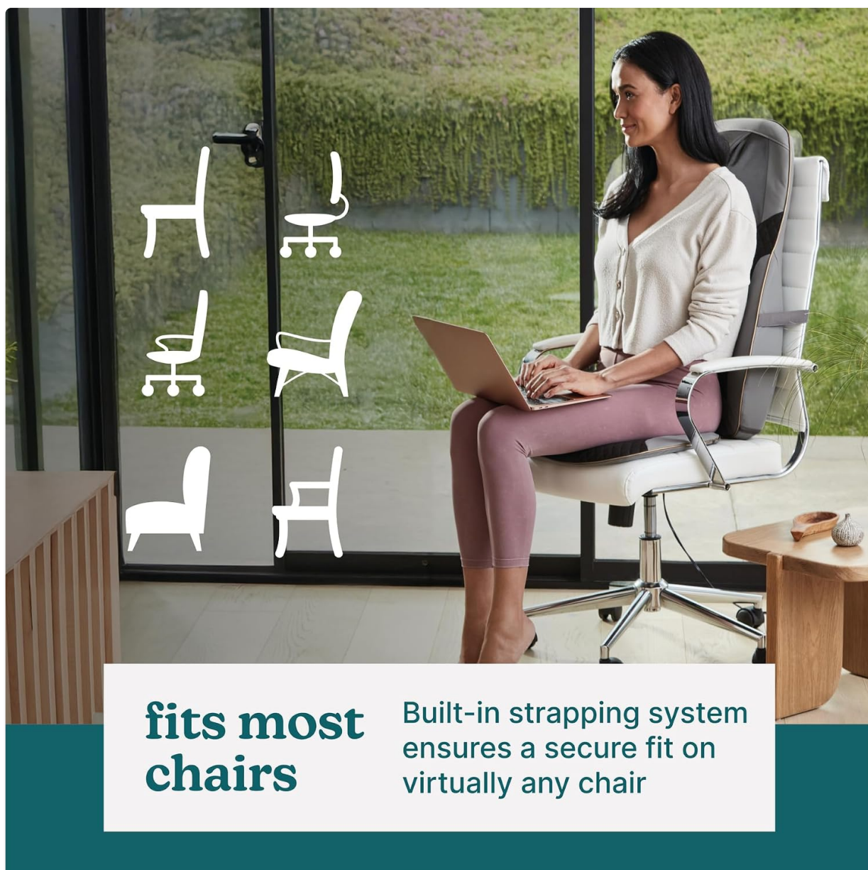
Image: The massage cushion can be used on various chair types, including office chairs, recliners, and standard chairs.