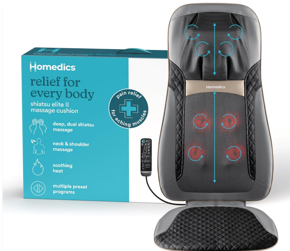
Image: The Homedics Shiatsu Elite II Massage Cushion shown with its retail packaging.

The Homedics Shiatsu Elite II Massage Cushion is designed to provide a personalized massage experience for your neck, shoulders, and back. It features multiple massage styles, adjustable zones, and soothing heat to help relieve muscle tension.