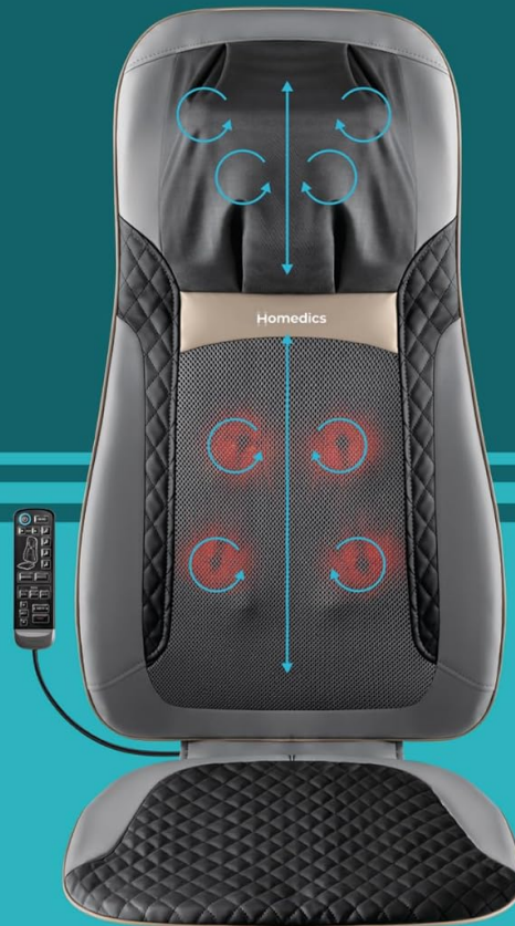
Image: Visual representation of the shiatsu (circular) and rolling (vertical) massage movements.

Rejuvenating warmth & gentle kneading work in harmony to release tension & bring tranquility to your body