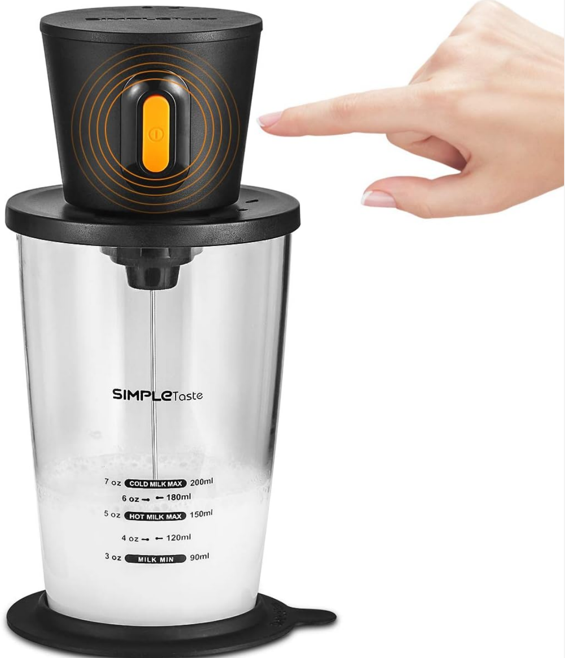
Figure 4: Activating the frother with a single press.