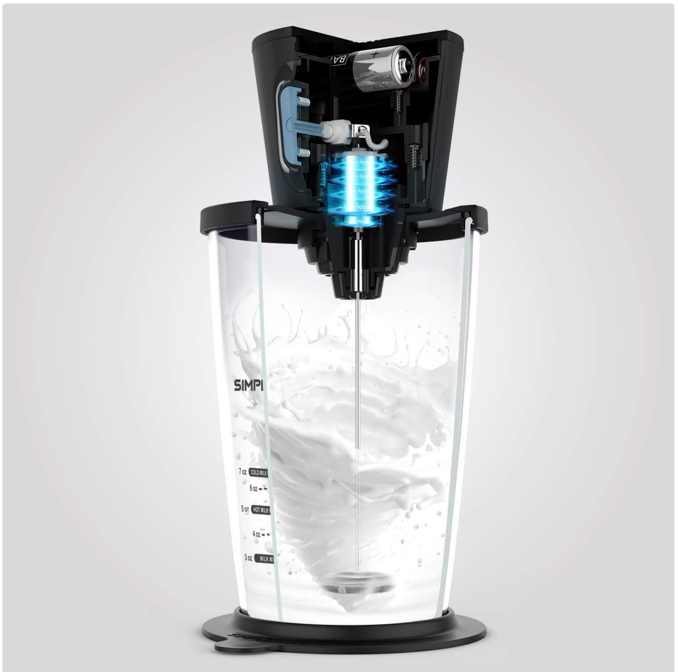
Figure 3: Internal view of the frother's motor and battery compartment.