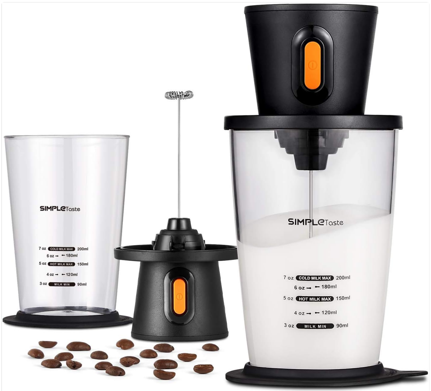
Figure 1: SIMPLETaste Electric Milk Frother with its components.