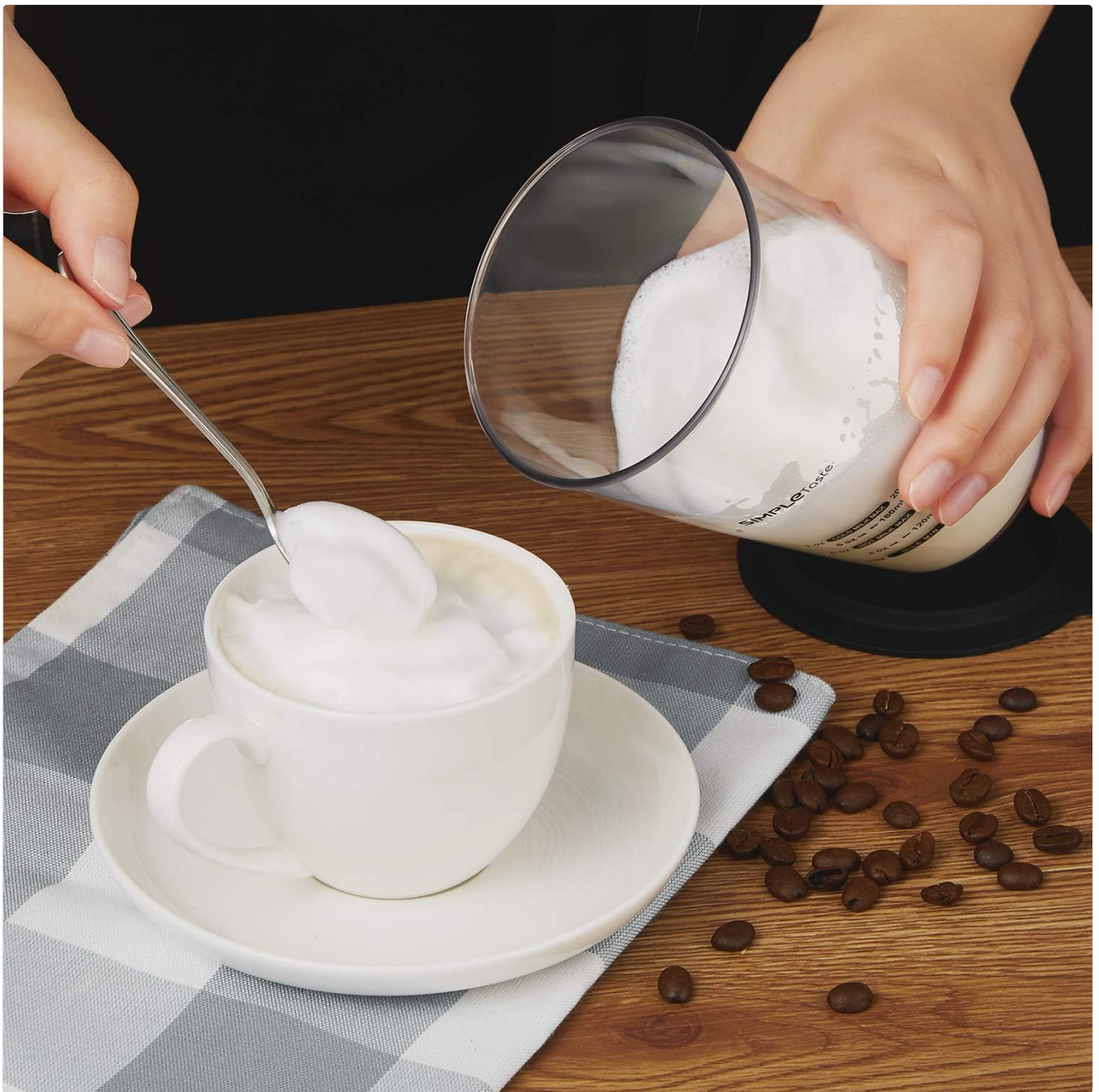
Figure 5: The SIMPLETaste frother offers hands-free convenience compared to traditional handheld models.