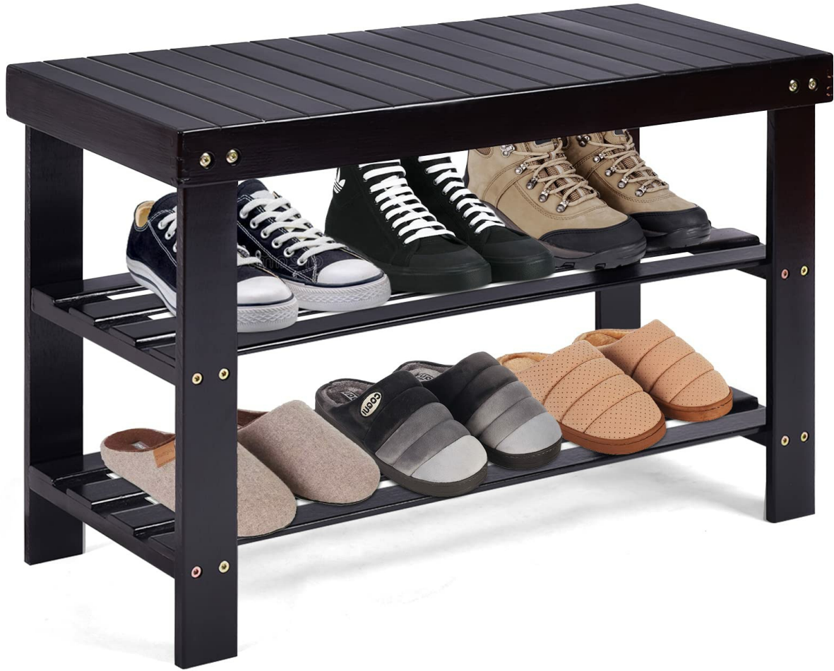
Image: The COSTWAY 3-Tier Bamboo Shoe Rack Bench, showcasing its use as both a seating area and shoe storage in a home setting.