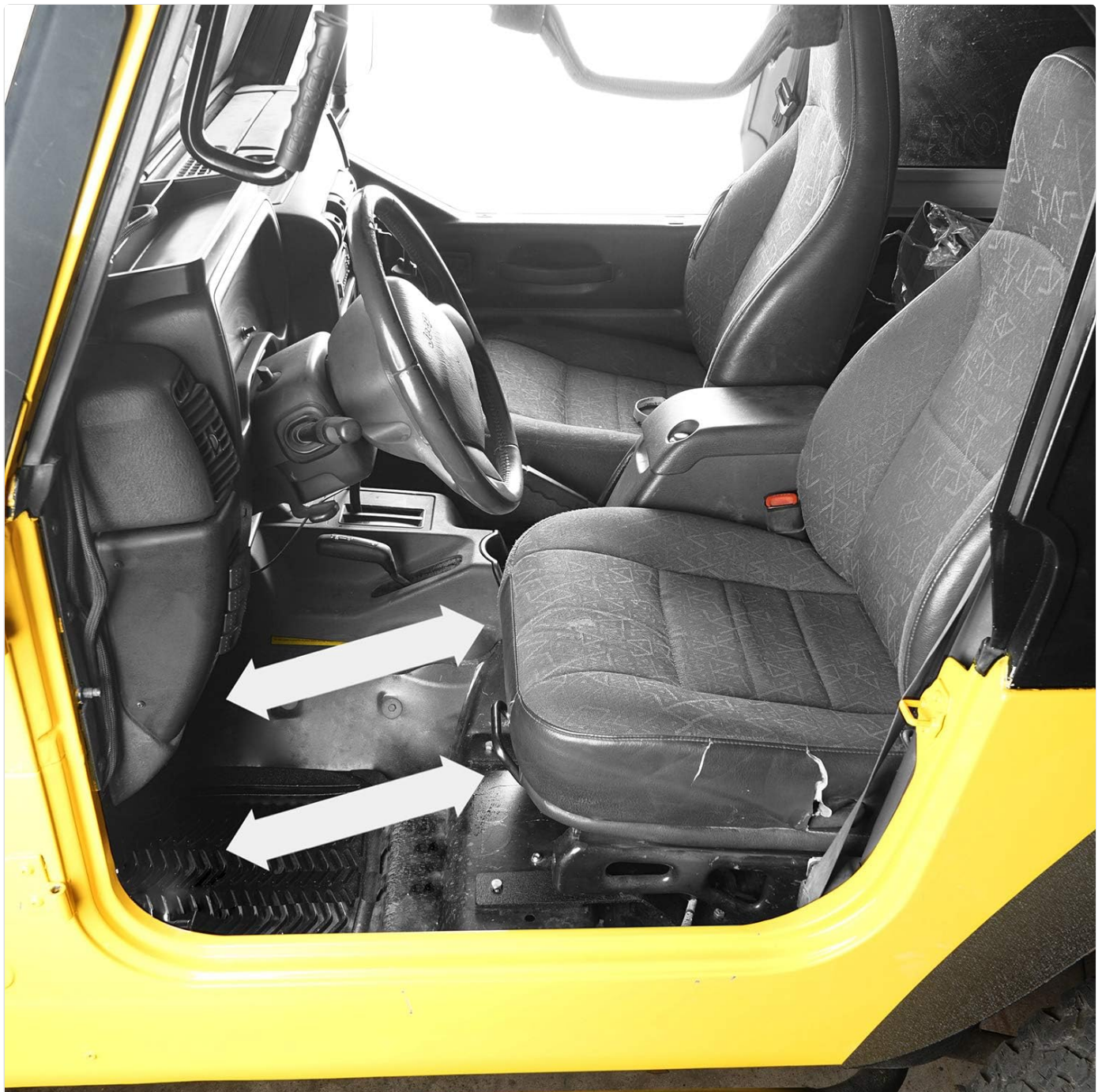
Image: Visual representation of the 4 inches of additional legroom provided by the adapter.