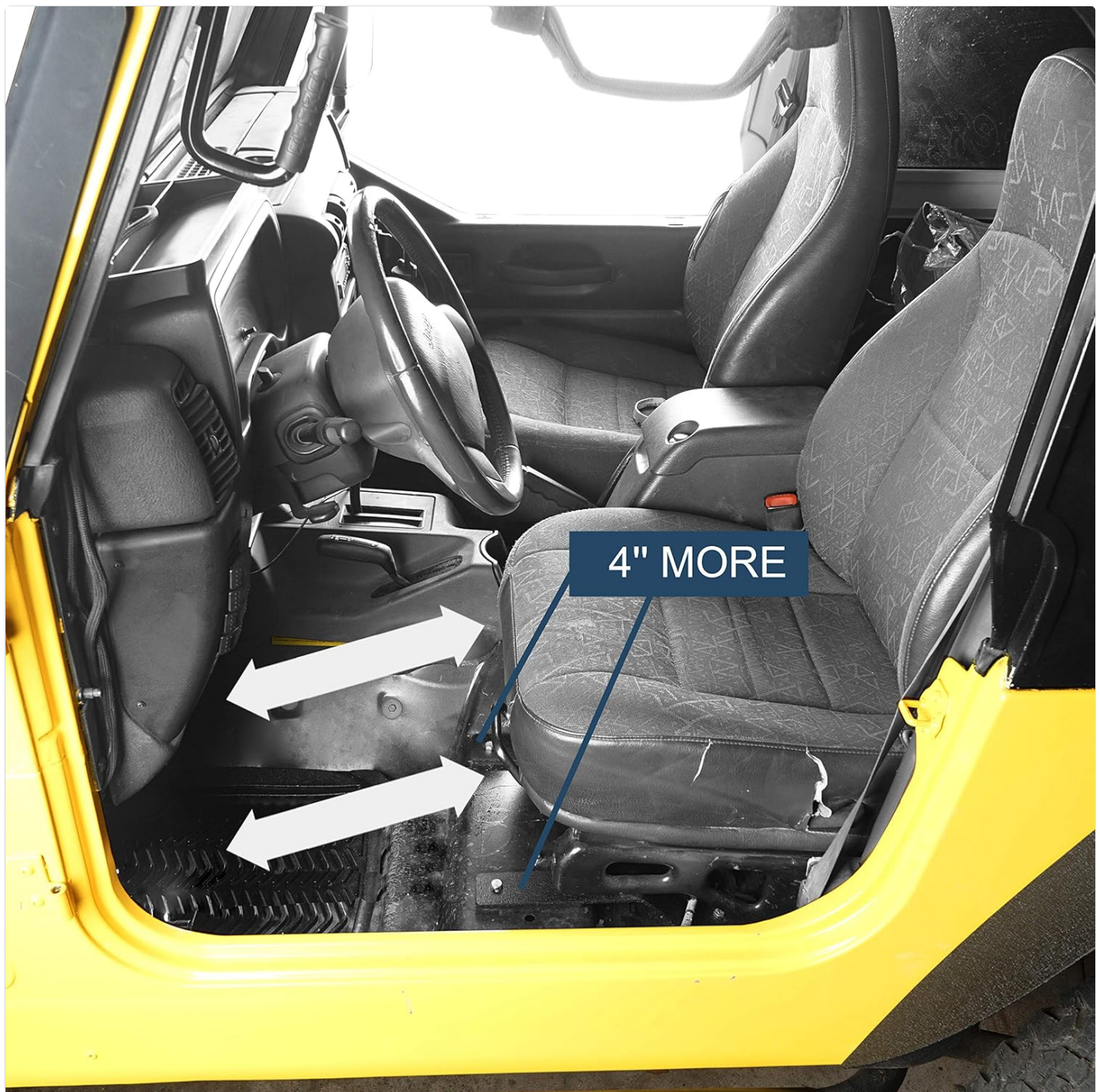
Image: The u-Box seat adapter bracket installed in a Jeep Wrangler TJ, demonstrating the extended seat position for improved comfort.