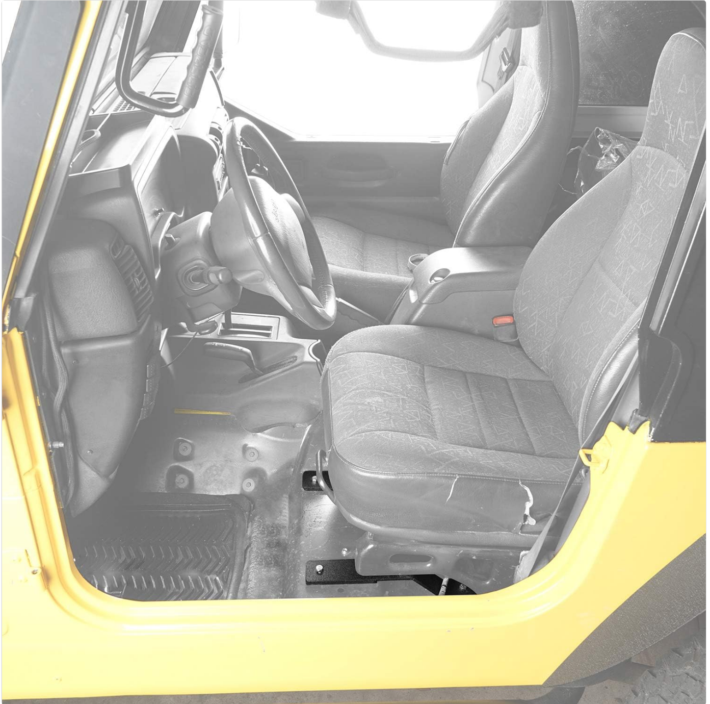
Image: Before and after installation comparison, illustrating the increased legroom.