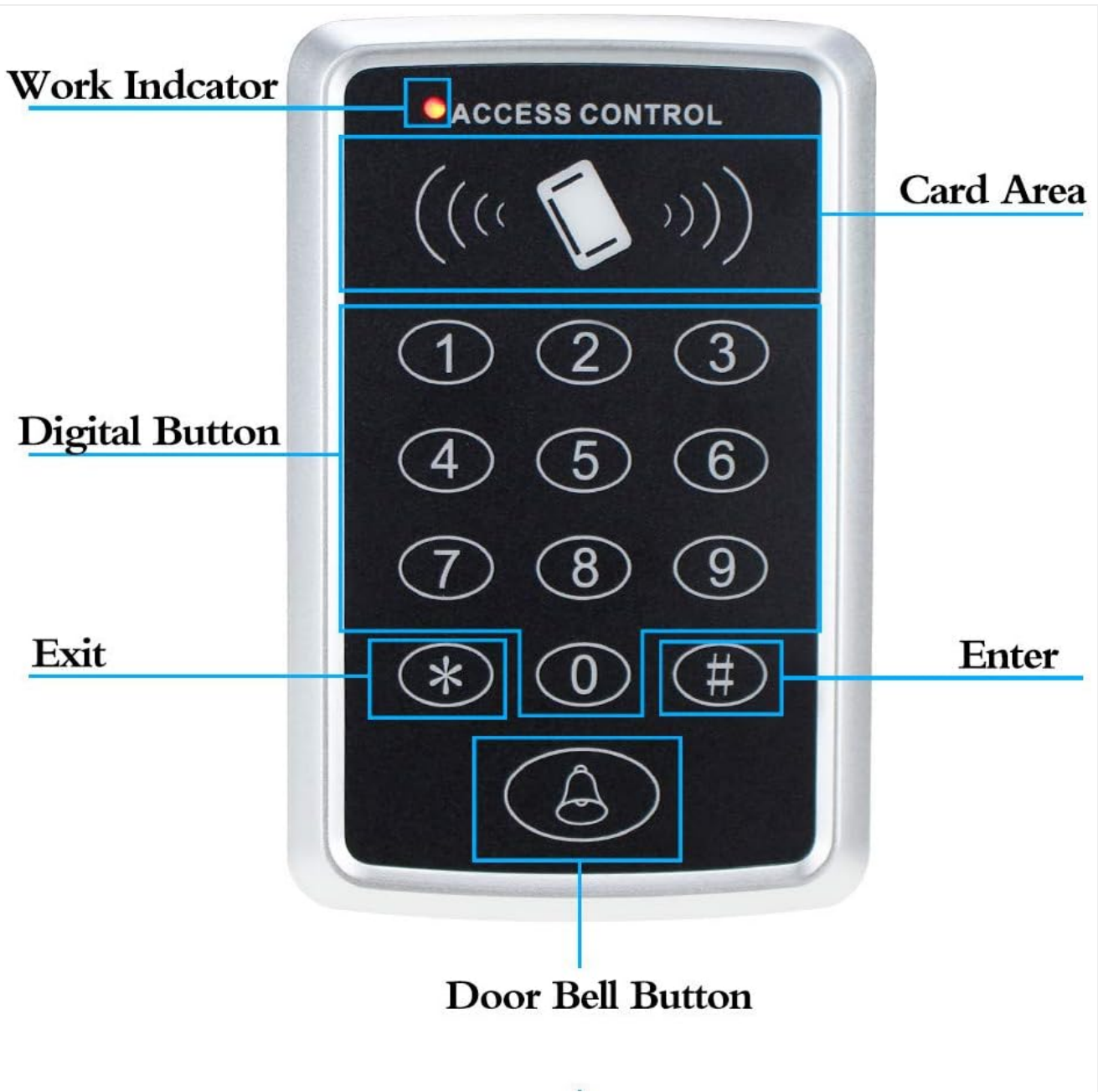
Figure 5.1: Labeled components of the access control keypad.