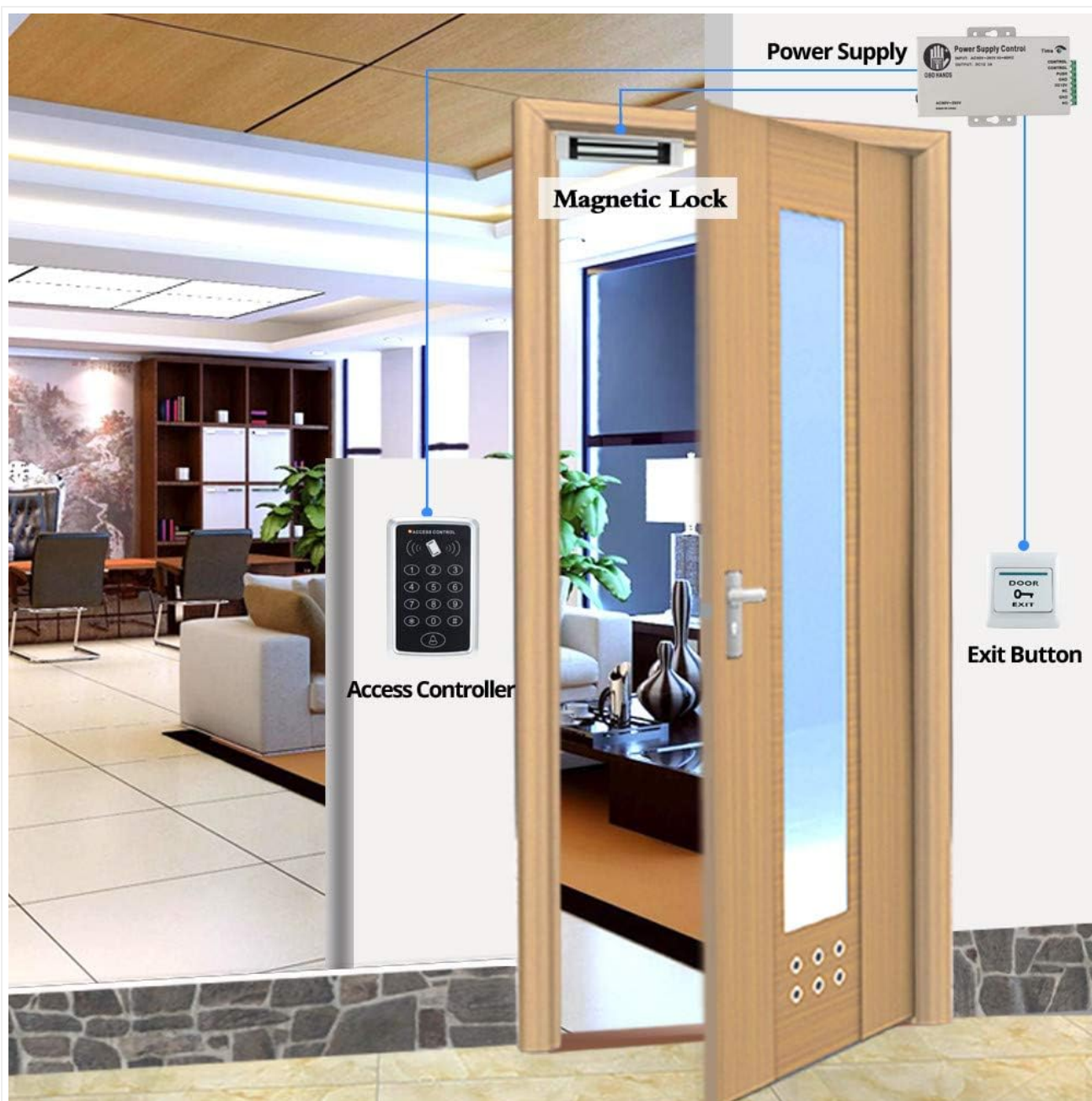
Figure 6.2: Example installation of the access control system.

The diagram illustrates a common setup where the access controller is mounted near the door, connected to a magnetic lock, an exit button on the inside, and a central power supply unit. Ensure the keypad is mounted at an accessible height and in a location protected from extreme weather conditions if installed outdoors.