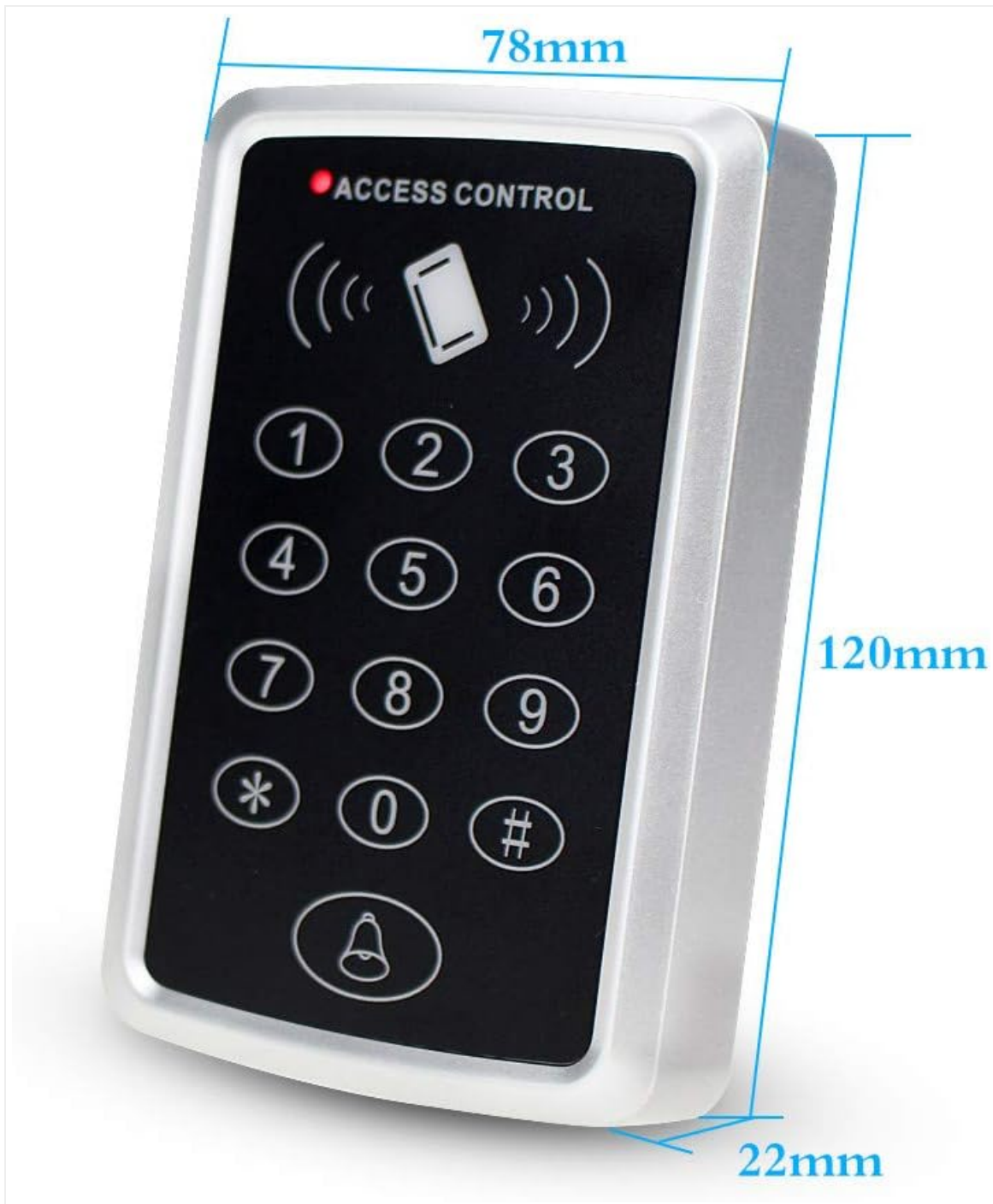
Figure 4.1: Keypad dimensions.