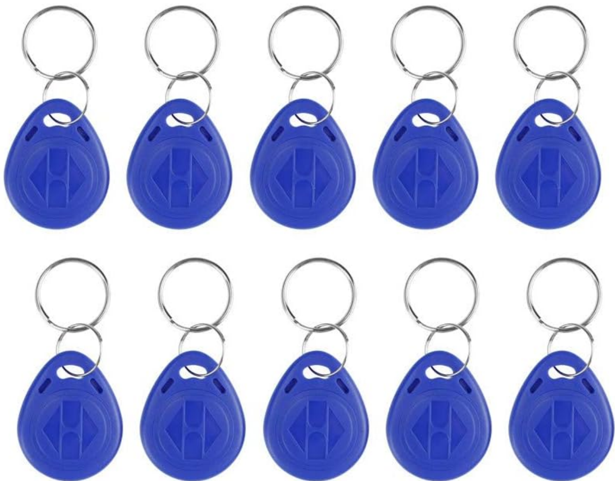
Figure 7.1: Example of 125KHz RFID key fobs.

Each card pre programmed a unique identity, is printed on the