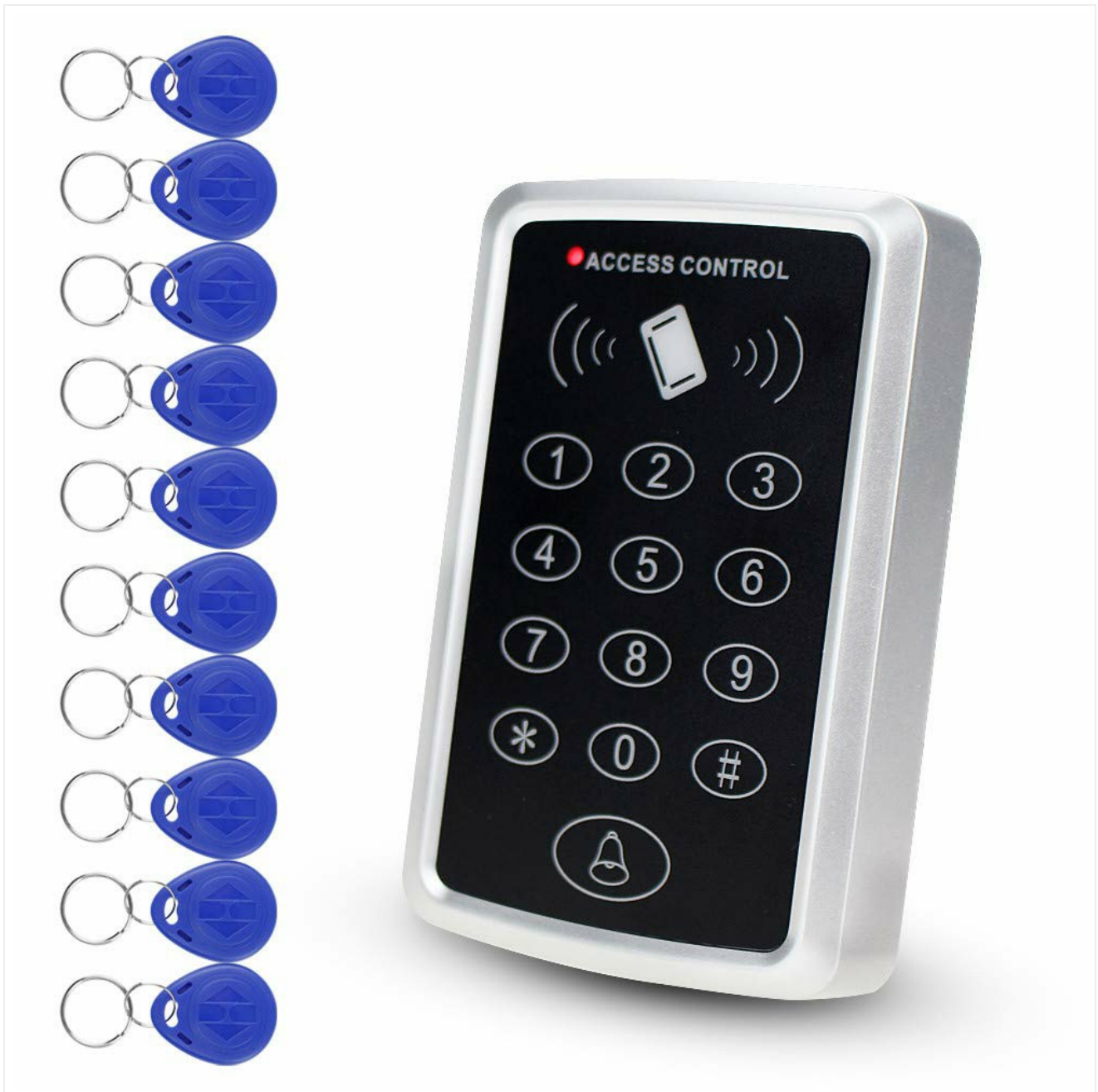
Figure 3.1: Contents of the Sebury NN99 Access Control System package.