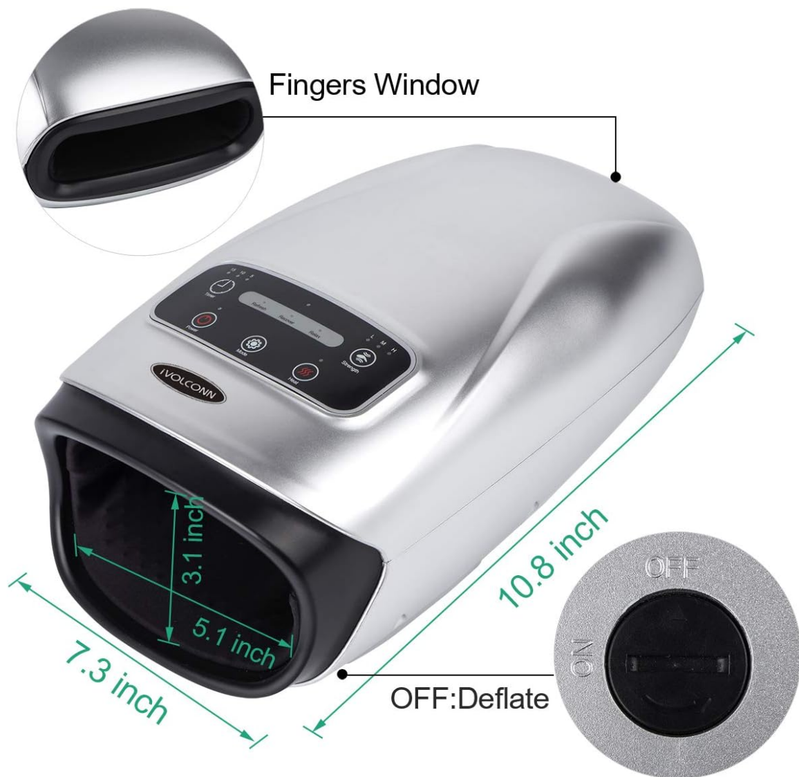
Image 4: The physical dimensions of the hand massager, including finger window size.