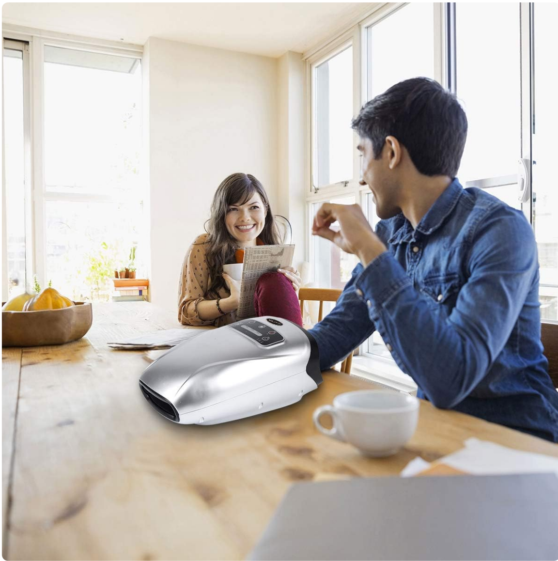
Image 1: The iVOLCONN Hand Massager providing relaxation. The device is white and silver, with a hand inserted into the opening.