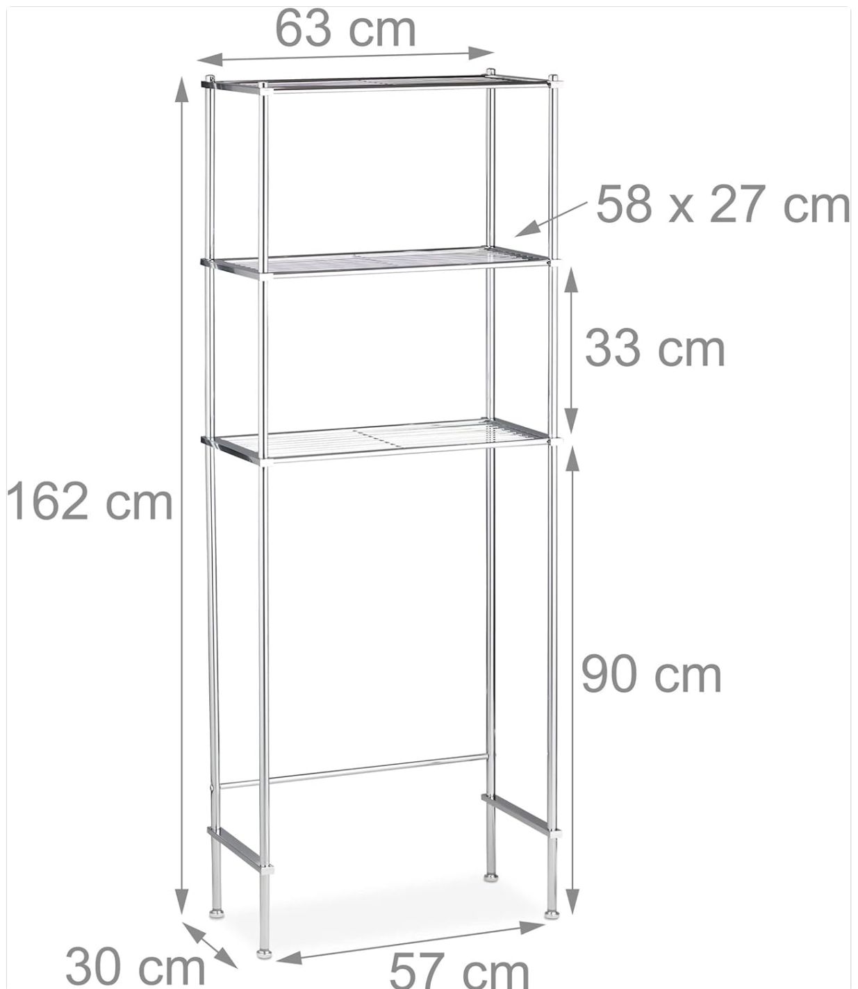
Image: Detailed dimensions of the laundry storage shelf, including overall height, width, depth, and individual shelf measurements.

The shelf measures approximately 162 cm (H) x 63 cm (W) x 30 cm (D). Each shelf is approximately 58 cm (W) x 27 cm (D). The lower shelf is positioned approximately 90 cm from the floor, providing clearance for most washing machines or toilets.