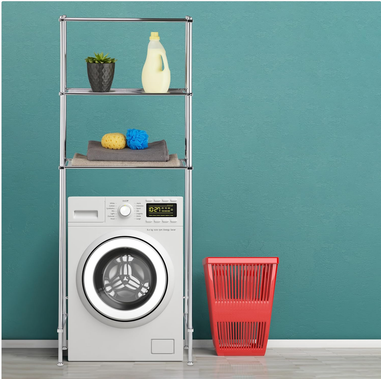
Image: The fully assembled Relaxdays Laundry Storage Shelf positioned above a washing machine, showcasing its intended use and storage capacity.

Once all components are assembled, gently shake the unit to ensure stability. Adjust the feet if necessary to level the shelf on uneven floors. Place the shelf in its desired location, typically over a washing machine, dryer, or toilet.