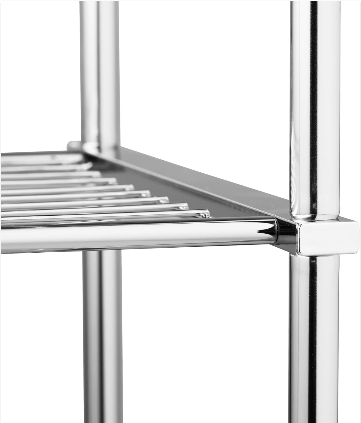
Image: Detail of a shelf corner, illustrating the connection point between the shelf grid and the frame.