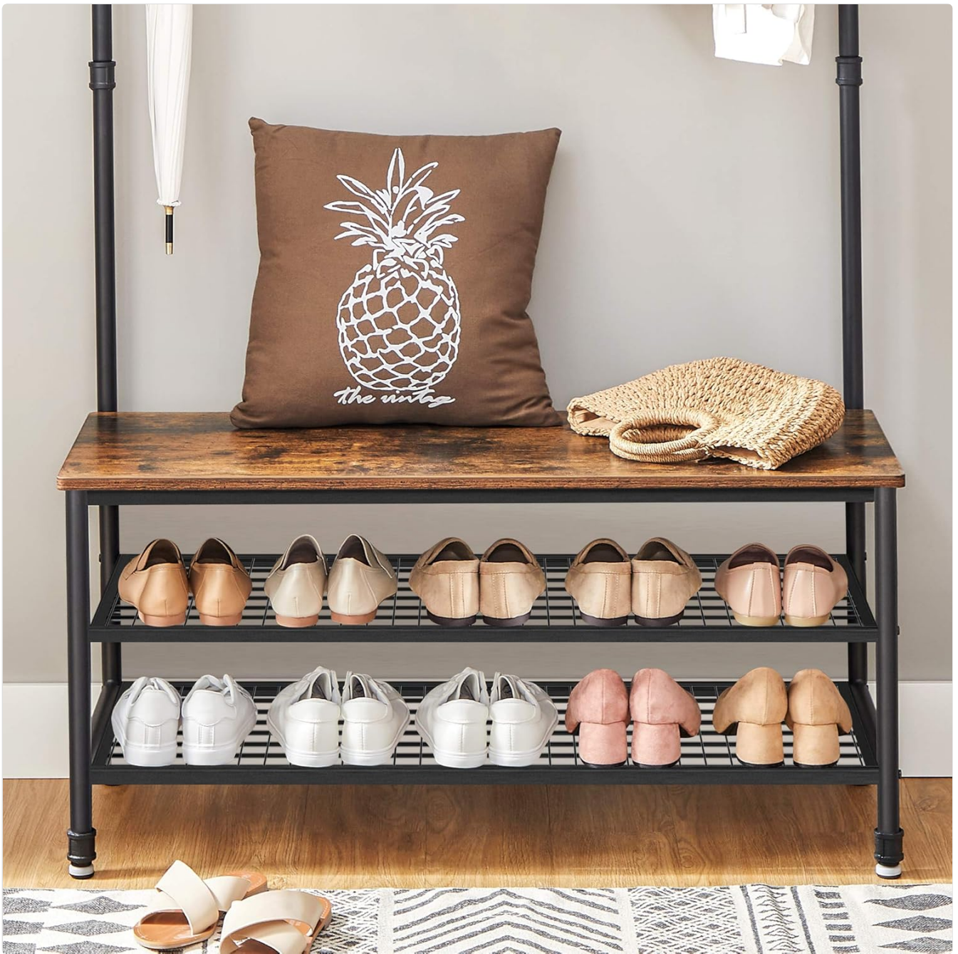
Figure 5: Organized shoe storage on the mesh shelves.