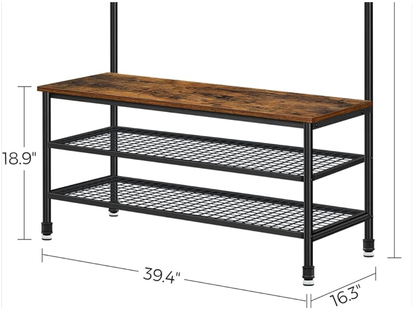
Figure 2: Product dimensions for planning placement.