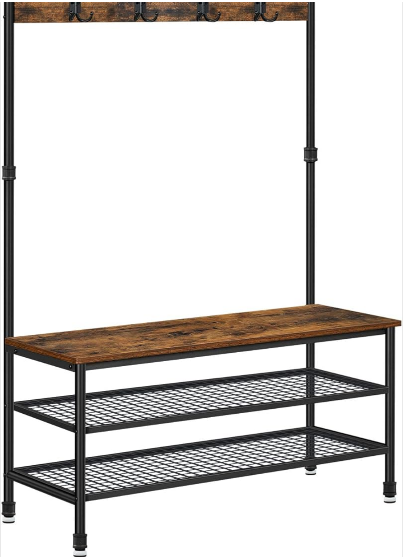
Figure 1: Overview of the VASAGLE DAINTREE 3-in-1 Entryway Coat Rack and Storage Bench.