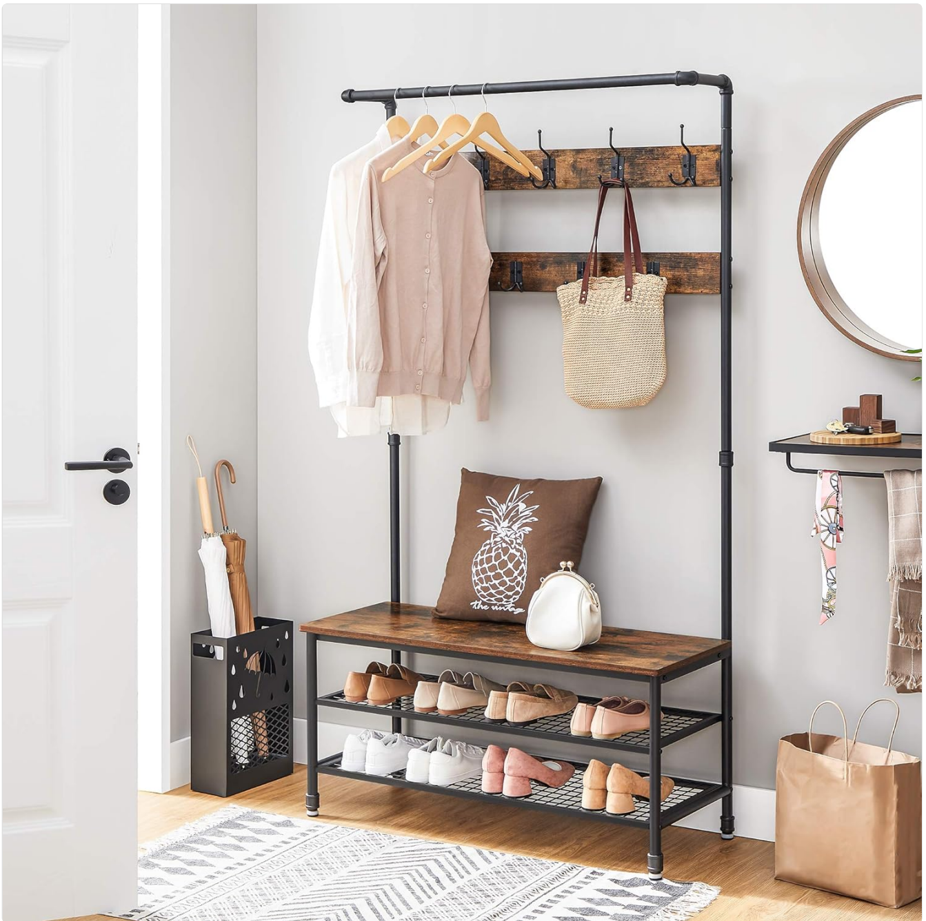
Figure 6: The hall tree in use, demonstrating its multi-functional design.