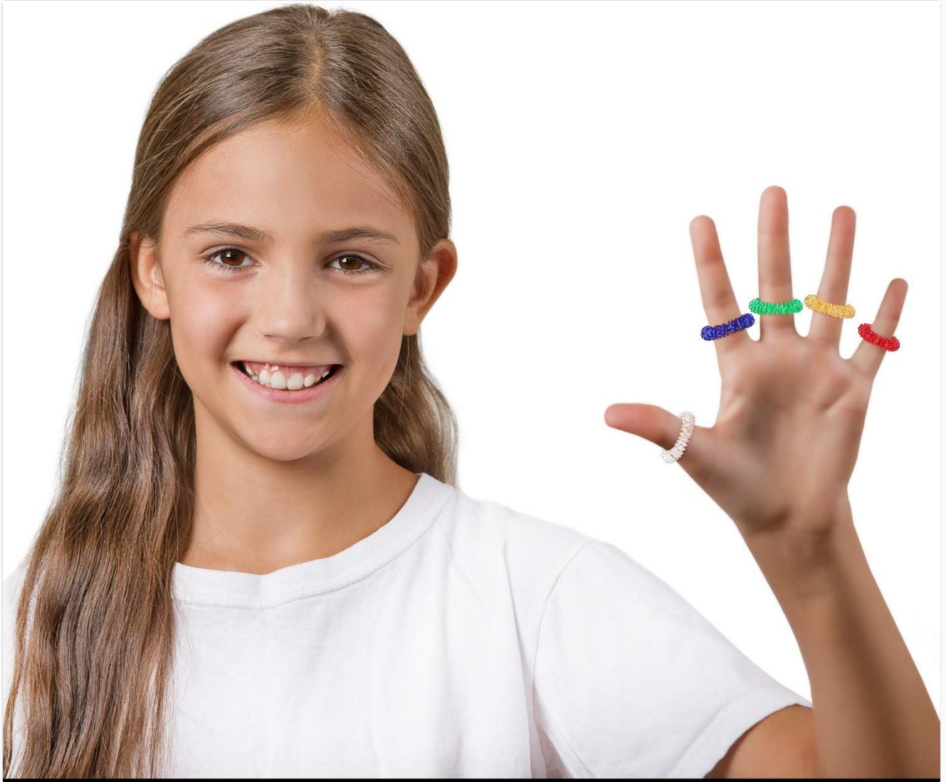
Figure 6.2: Various applications of acupressure rings on fingers.