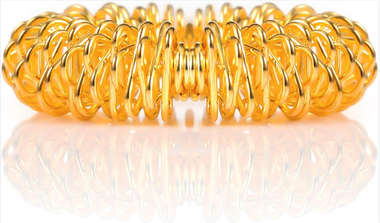
Figure 6.1: Demonstration of rolling the acupressure ring on a finger.

The elastic nature of the ring allows it to adapt to various finger sizes during the rolling motion.