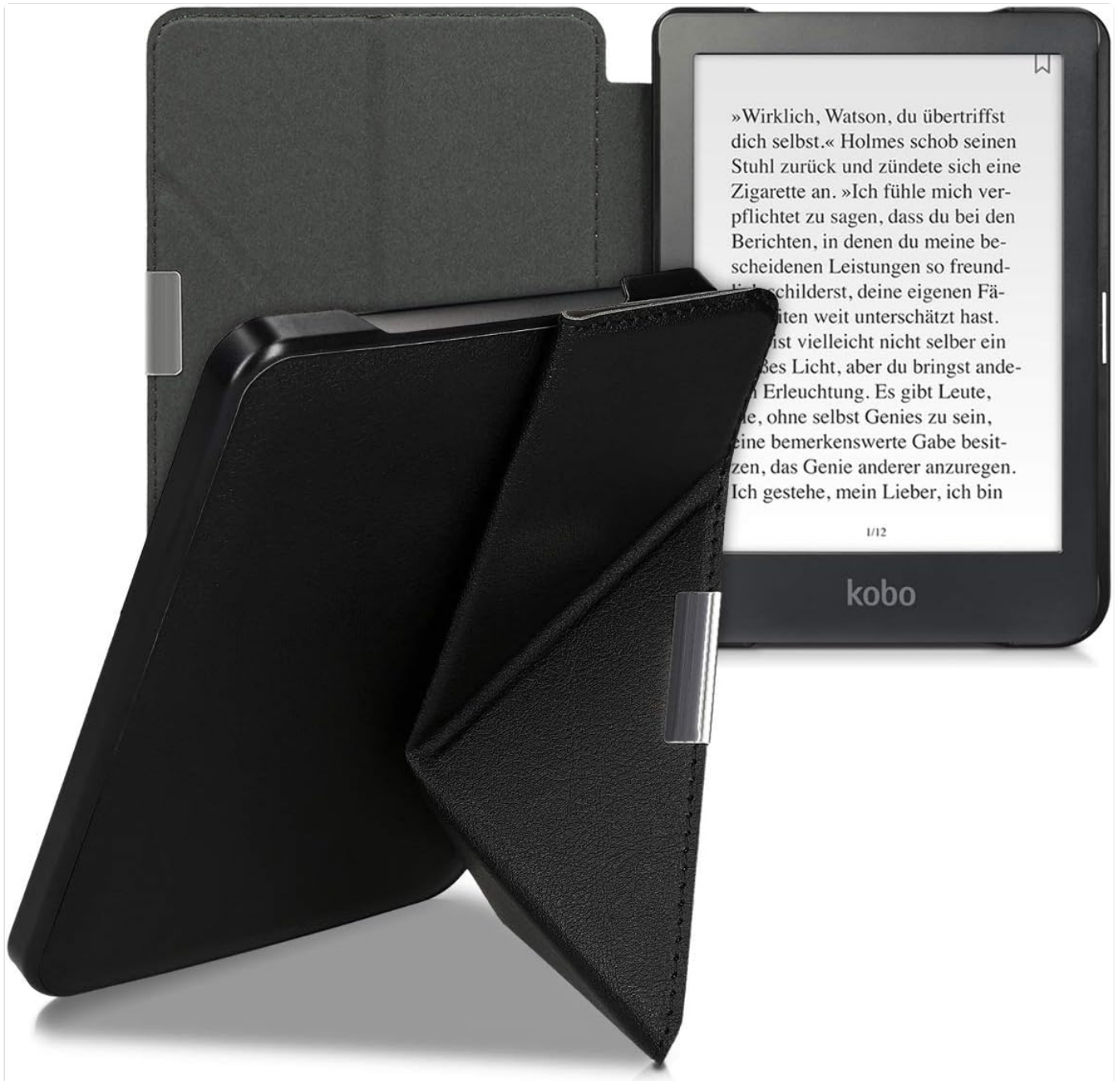
Image: Front view of the Kobo Clara HD securely held in the origami stand position.