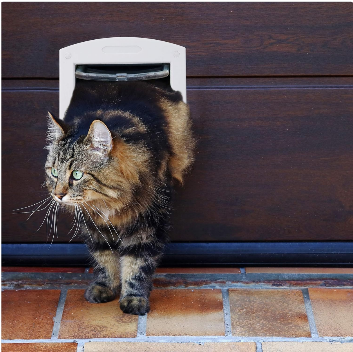
Image: A brown tabby cat is shown exiting a dark brown door through the installed cat flap, demonstrating a typical installation scenario.