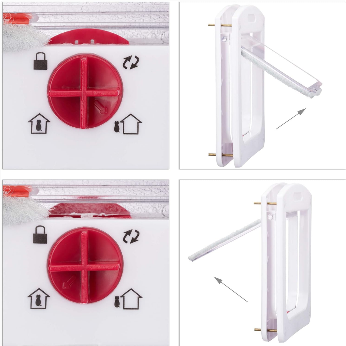
Image: A close-up view of the red circular dial on the cat flap, illustrating the four locking positions with their respective icons. This image helps users understand how to select the desired access mode.

4. Fully Locked: (Represented by a lock icon) The flap is completely locked, preventing both entry and exit. Use this when you want to keep your pet securely inside or outside, or to prevent other animals from entering your home.