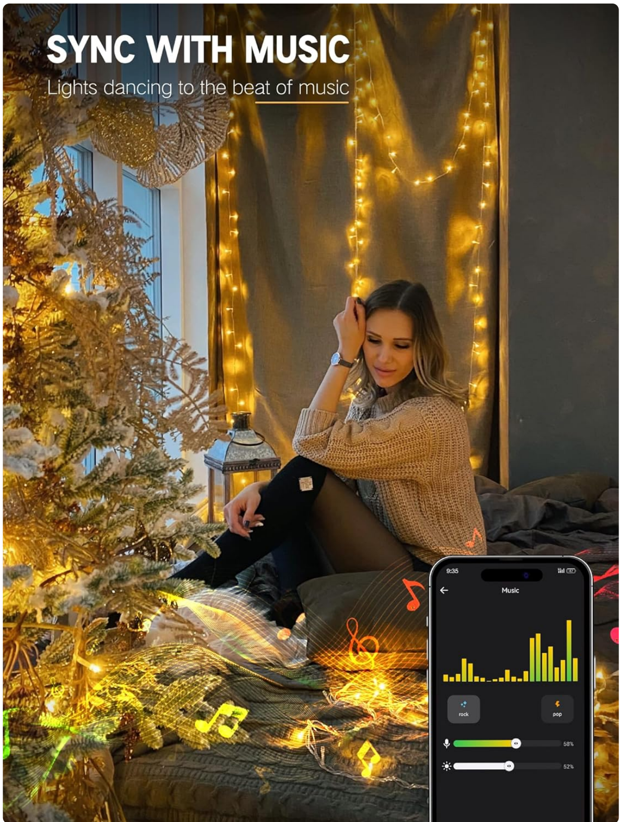
Image: A person relaxing near a Christmas tree with BrizLabs lights, illustrating the "Music Sync" feature where lights respond to music.