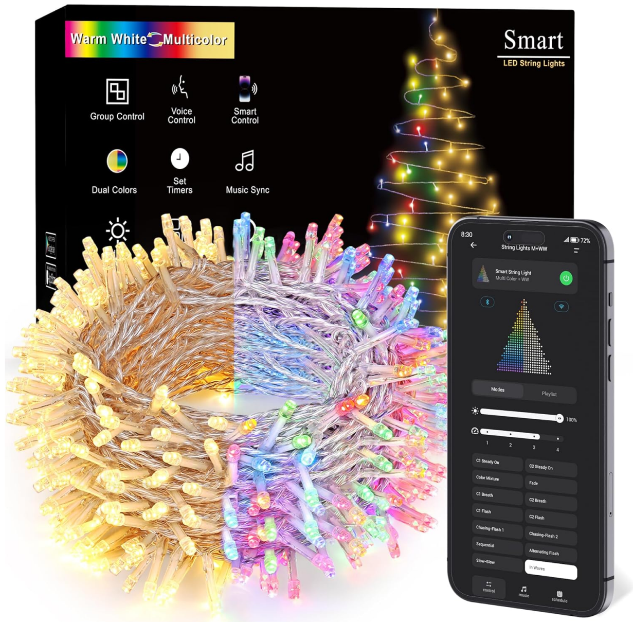
Image: BrizLabs Smart Christmas Lights showing the coiled lights and a smartphone displaying the app interface for control.