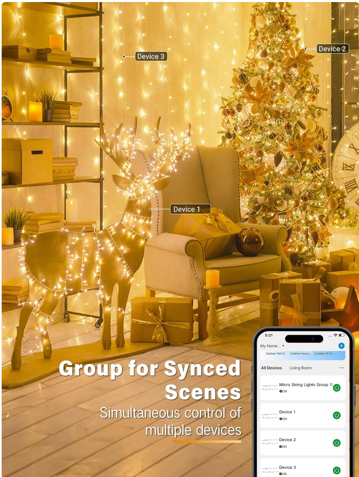
Image: A living room with multiple BrizLabs light installations, showing "Group for Synced Scenes" for simultaneous control of devices.