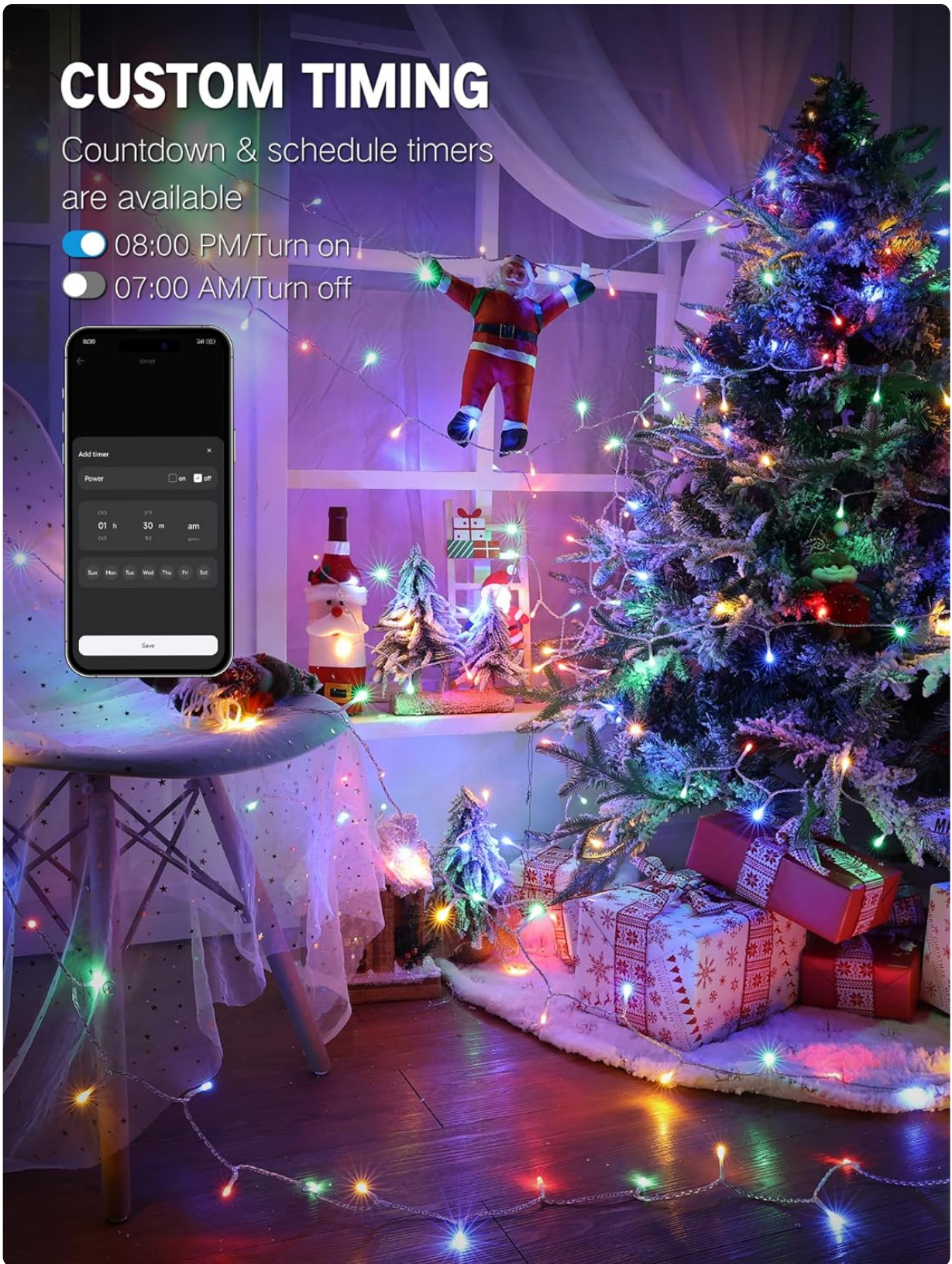
Image: A decorated Christmas tree with BrizLabs lights, demonstrating the "Custom Timing" feature for setting schedules via the app.