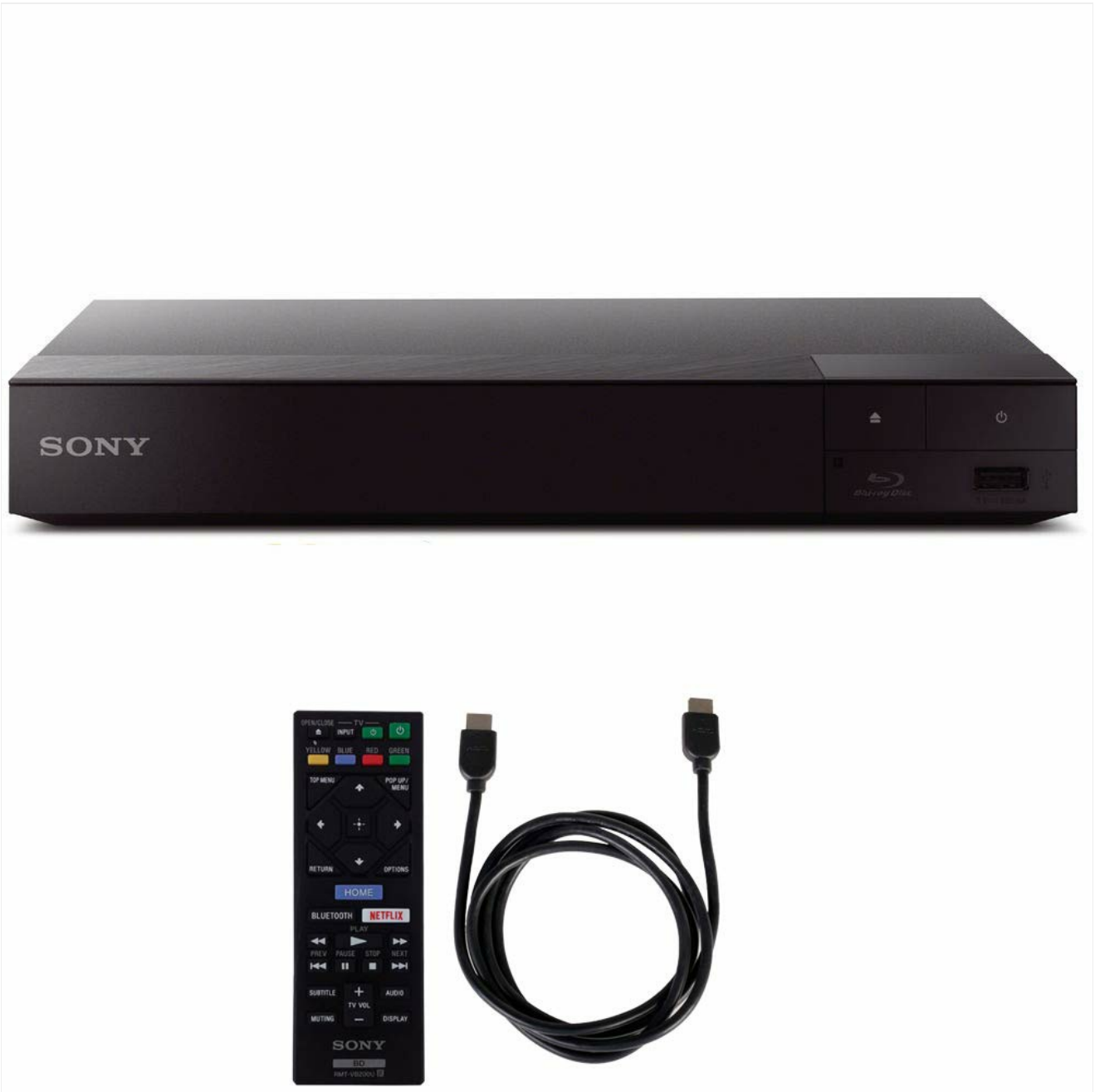
Image: Front view of the Sony BDP-S6700 Blu-ray Disc Player, showing its sleek black design and front panel controls.

Connect the Blu-ray Disc player to your television and power source.