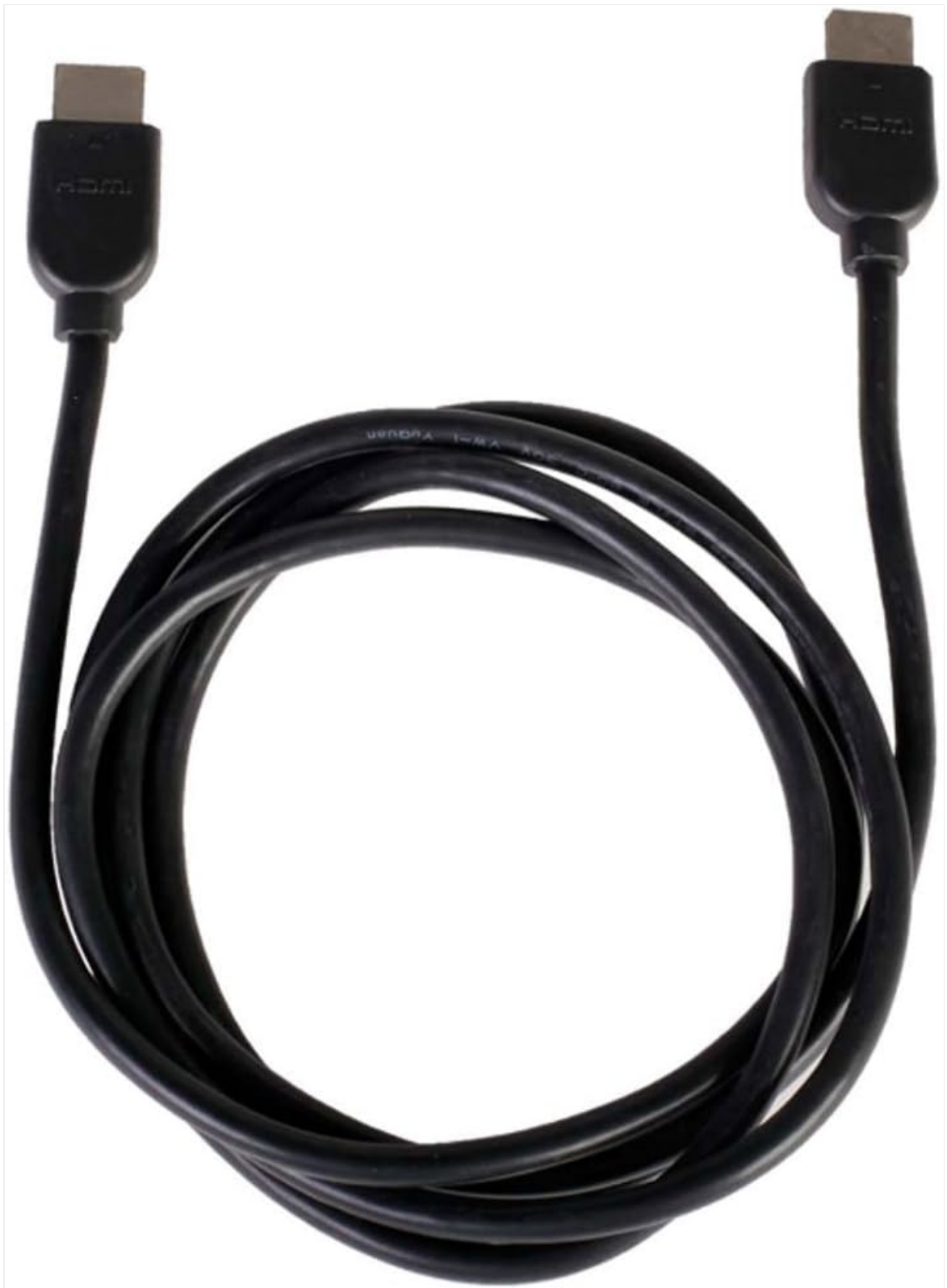
Image: A coiled 6ft High Speed HDMI Cable, used for connecting the player to a television.