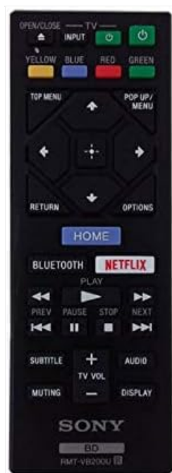
Image: The Sony RMT-VB200U remote control, featuring dedicated buttons for Netflix and Bluetooth.

The supplied remote control (RMT-VB200U) provides full control over the player's functions.