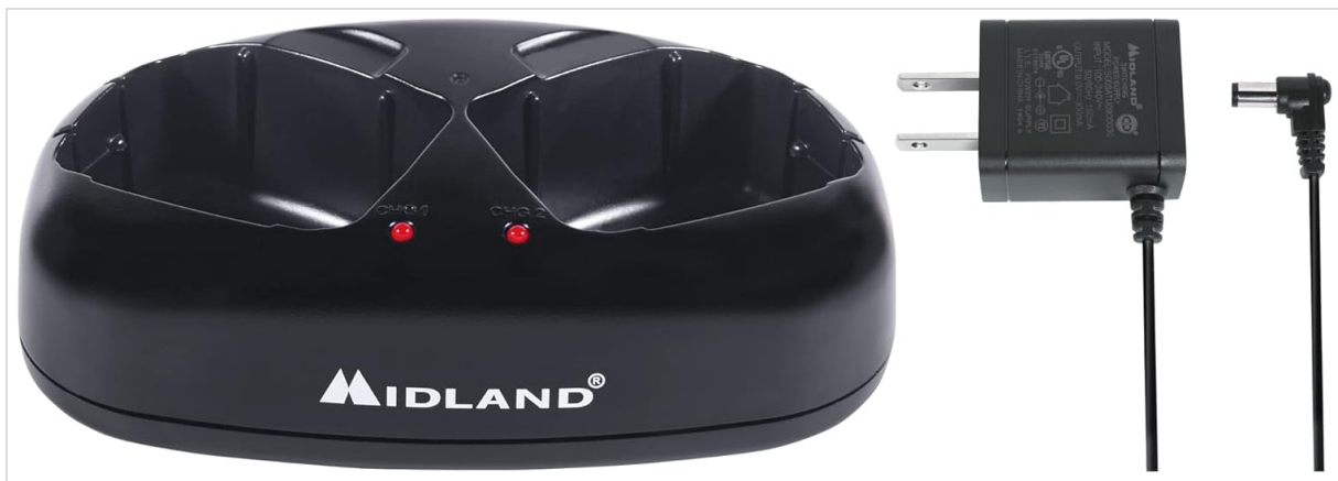
Image 1: Midland AVP10 Dual Desktop Charger with its accompanying AC adapter. The charger is black, oval-shaped, with two charging bays and two red LED indicators labeled "CHG 1" and "CHG 2". The AC adapter is also black, with a standard US plug and a barrel connector for the charger.