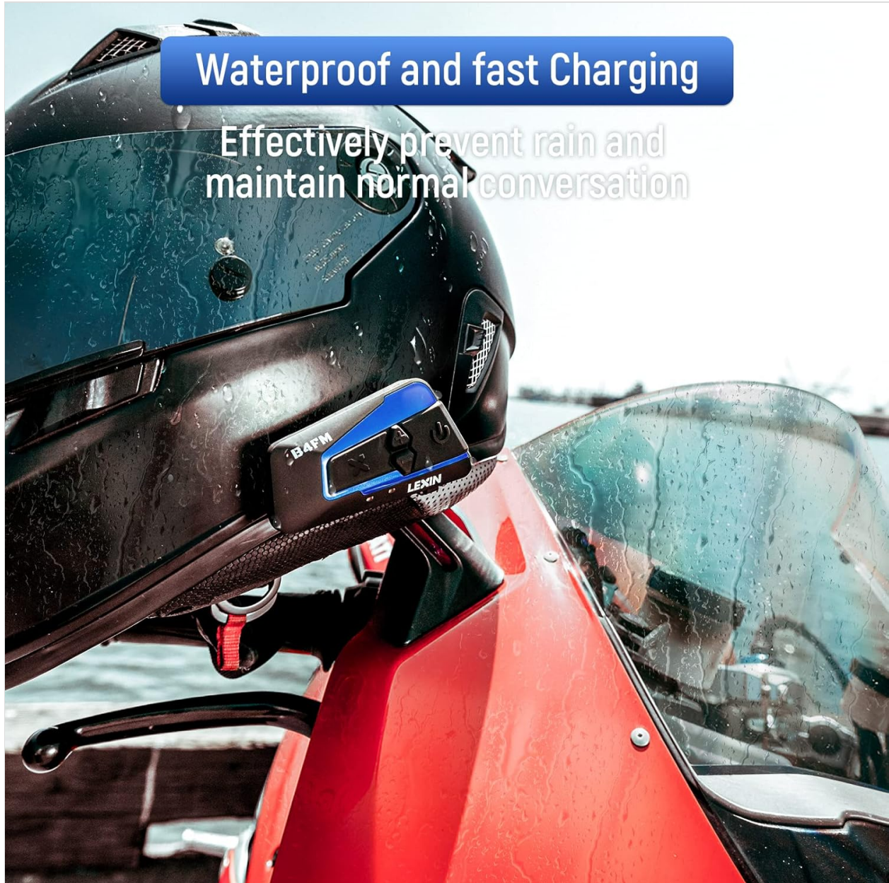
Image: A LEXIN B4FM unit mounted on a helmet, with water droplets on the helmet and windshield, emphasizing its waterproof capabilities and ability to function in rain.

The LX-B4FM helmet communication system is designed with IP67 waterproof ports and plugs, ensuring reliable performance in various weather conditions, including temperatures as low as -22°F (-30°C). While it is waterproof, avoid submerging the unit in water for extended periods.