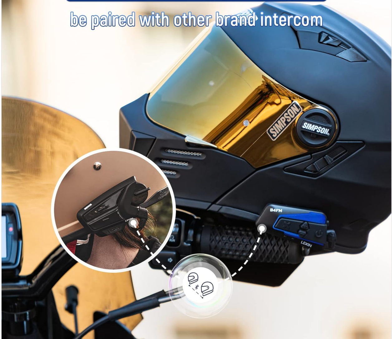
Image: A LEXIN B4FM unit mounted on a helmet, illustrating its capability for universal pairing with other brands of intercom systems.