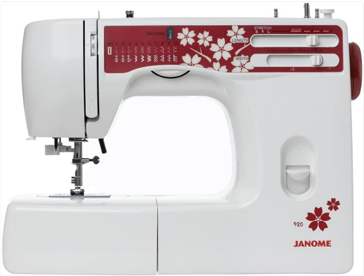
Figure 1: Front view of the Janome 920 Sewing Machine, showcasing its white body with red floral accents and control panel.