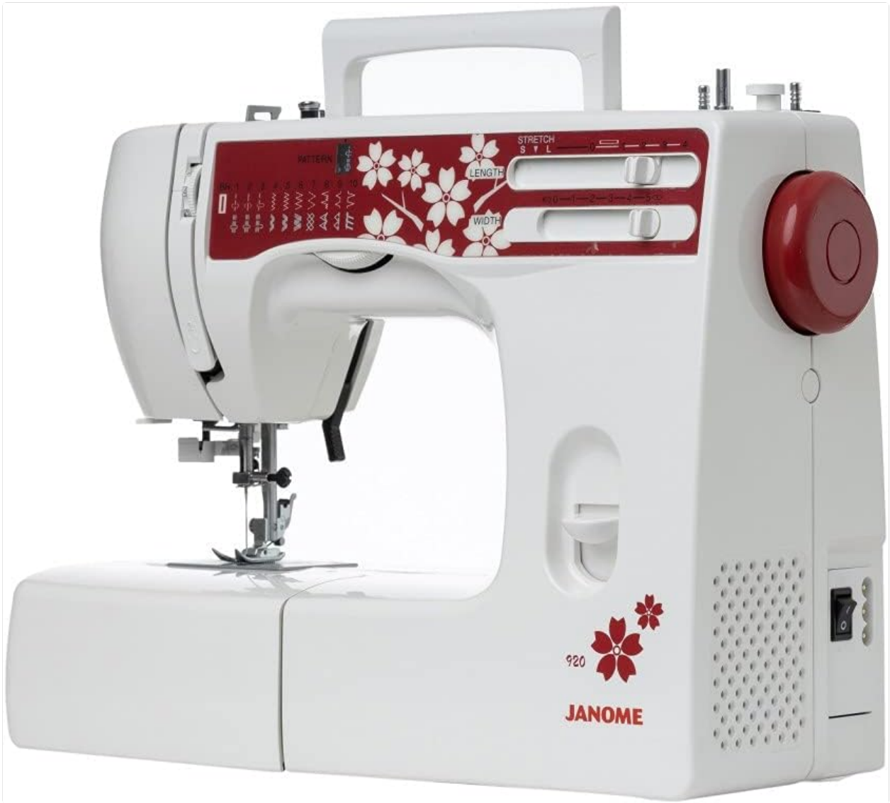
Figure 2: Angled view of the Janome 920, highlighting the integrated carrying handle and side profile.