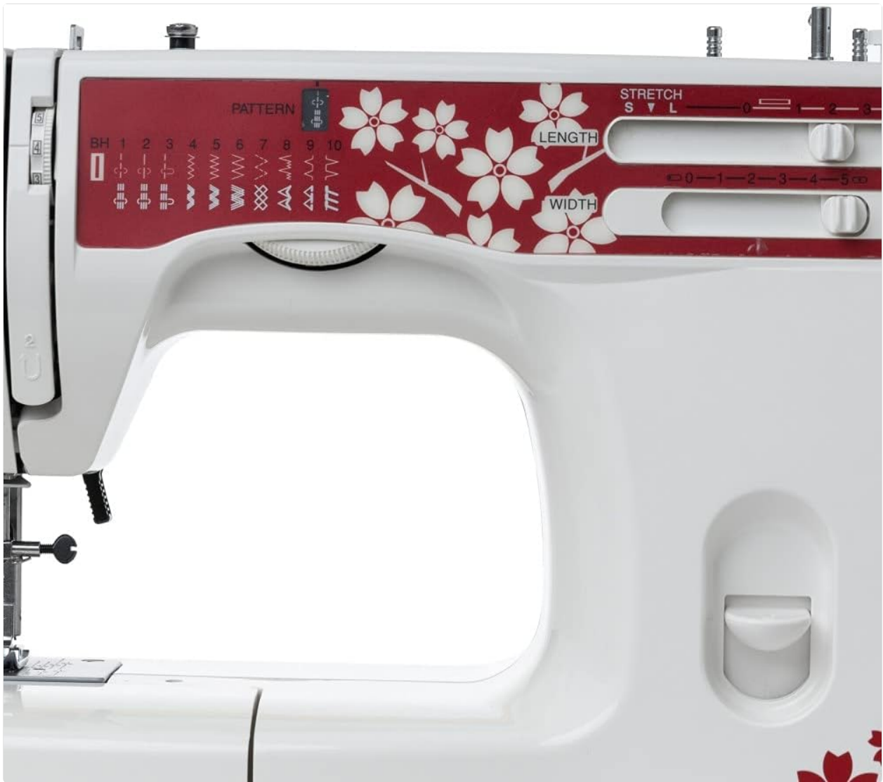
Figure 3: Close-up of the Janome 920's control panel, showing stitch pattern selector, length, and width adjustment sliders.