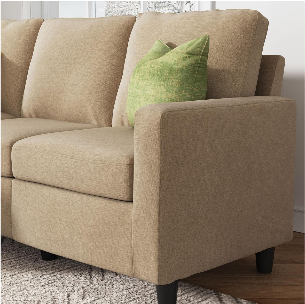
Image: Sectional sofa with left-facing chaise.

The HONBAY sectional sofa is designed for versatility. The chaise component can be easily moved to either the right or left side of the couch to suit your living space configuration.