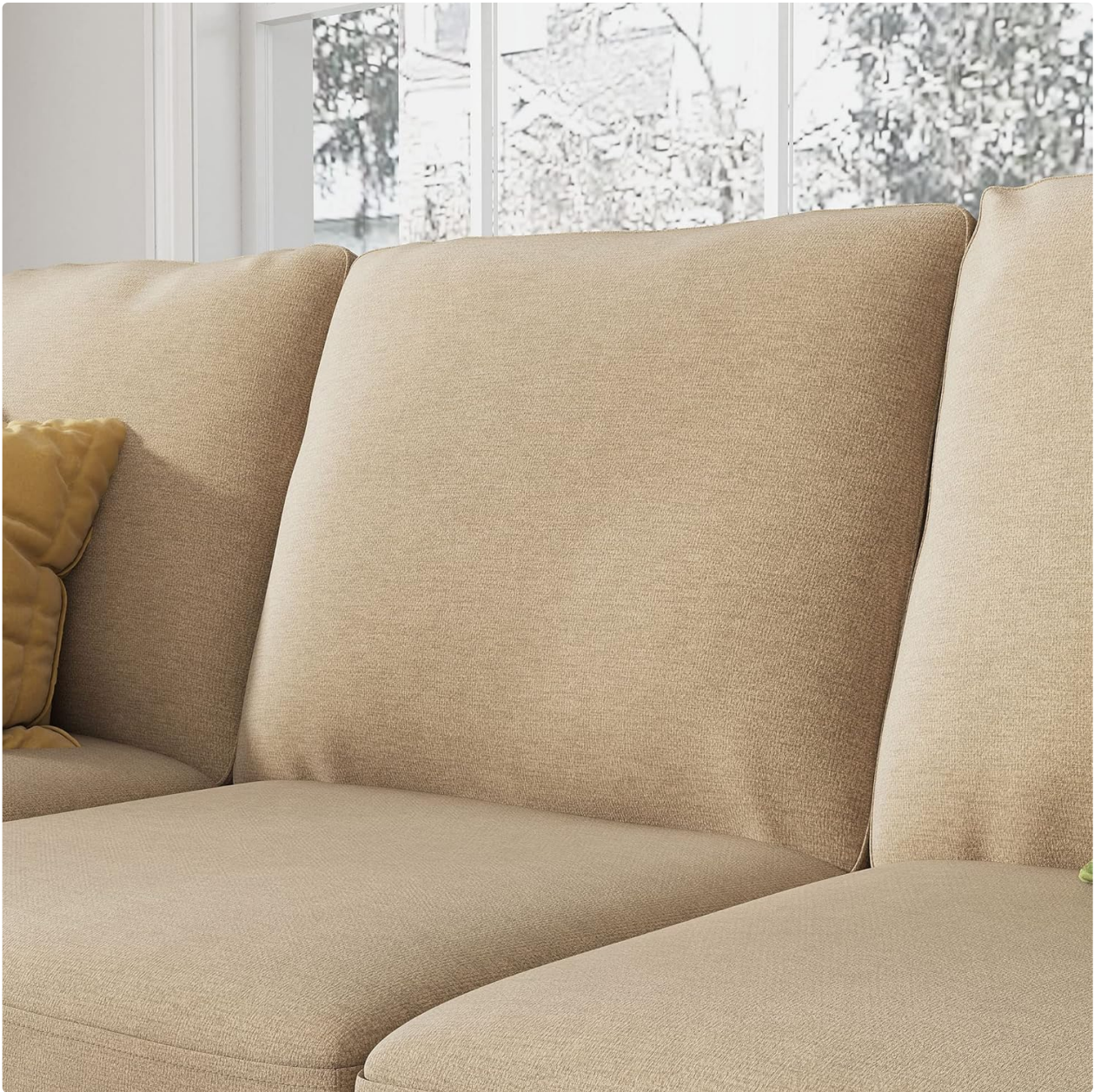
Image: Sectional sofa with right-facing chaise.

To change the chaise orientation, simply detach the chaise from the main sofa body, reposition it to the desired side, and re-secure it using the connecting hardware. The ottoman can also be used independently as additional seating.