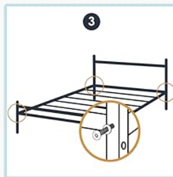
Image: Step 3 - Securing the frame with bolts.