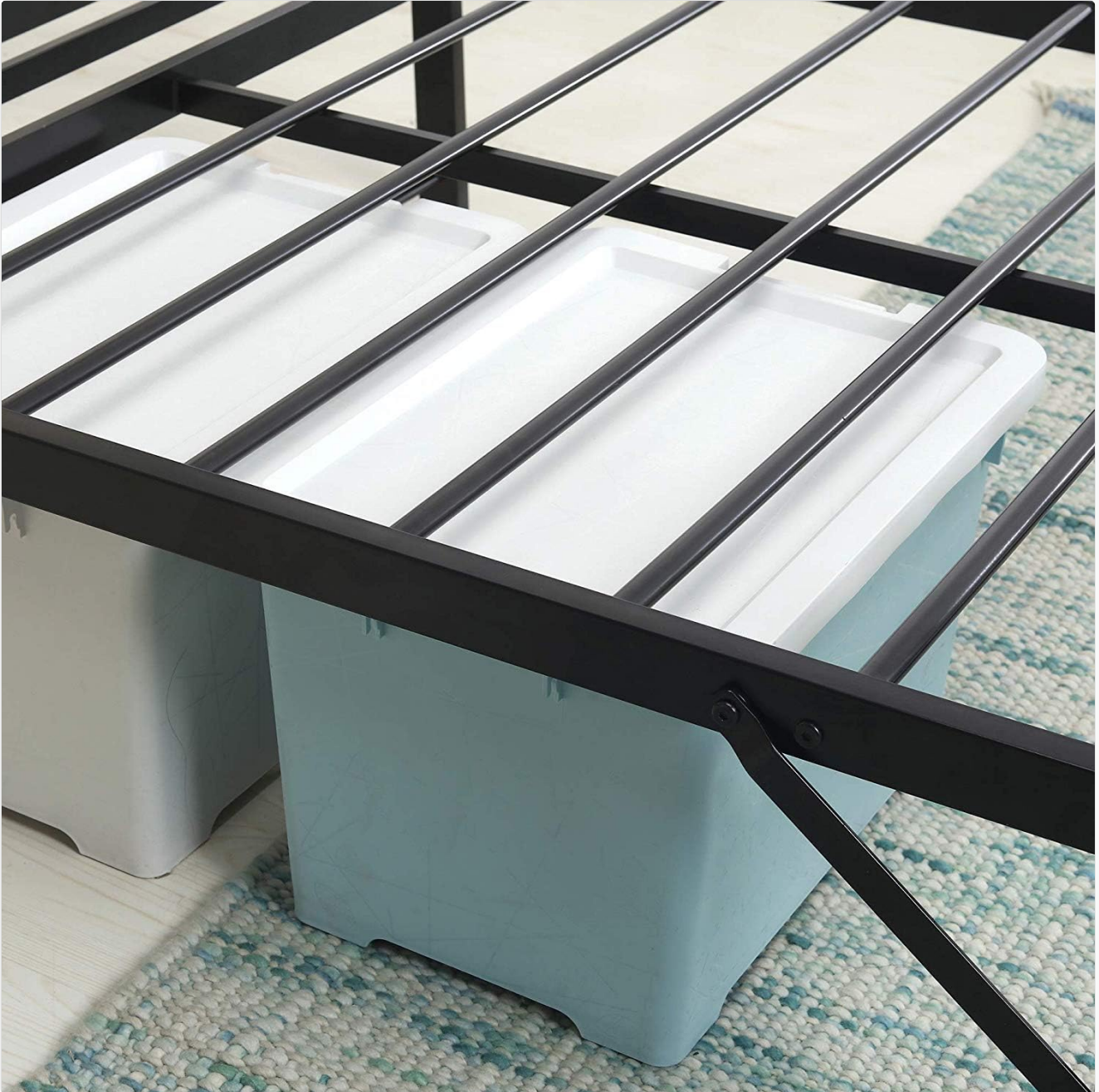
Image: Under-bed storage space with bins.