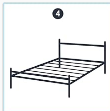
Image: Step 4 - Fully assembled bed frame.