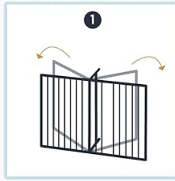
Image: Step 1 - Folded frame.

4. Final Check: Verify all connections are secure and the frame is stable before placing your mattress.