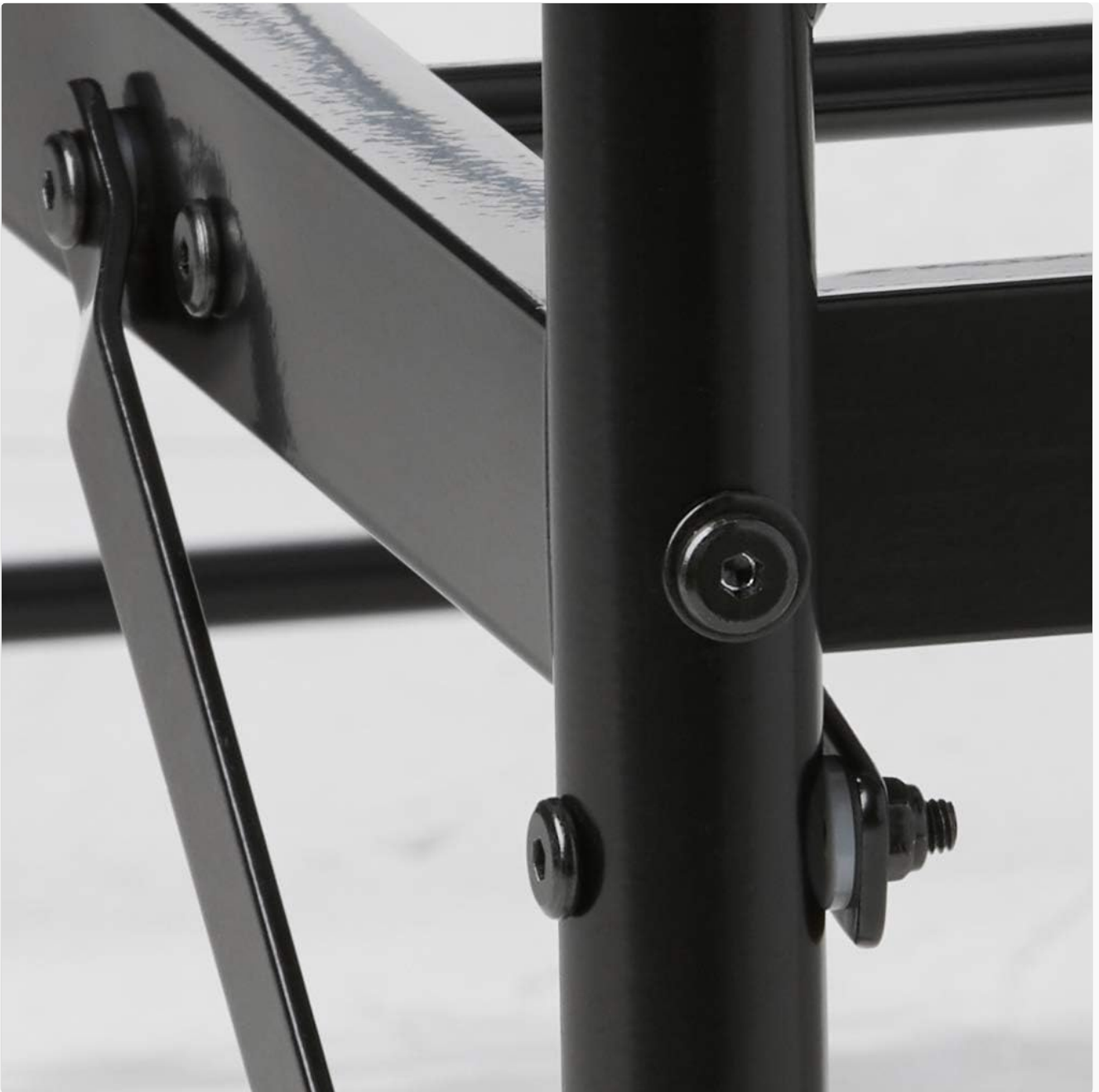
Image: Detail of a bolt for securing the frame.