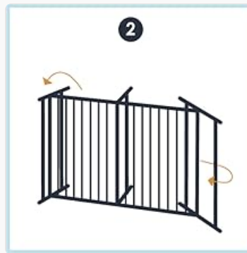
Image: Step 2 - Partially unfolded frame.