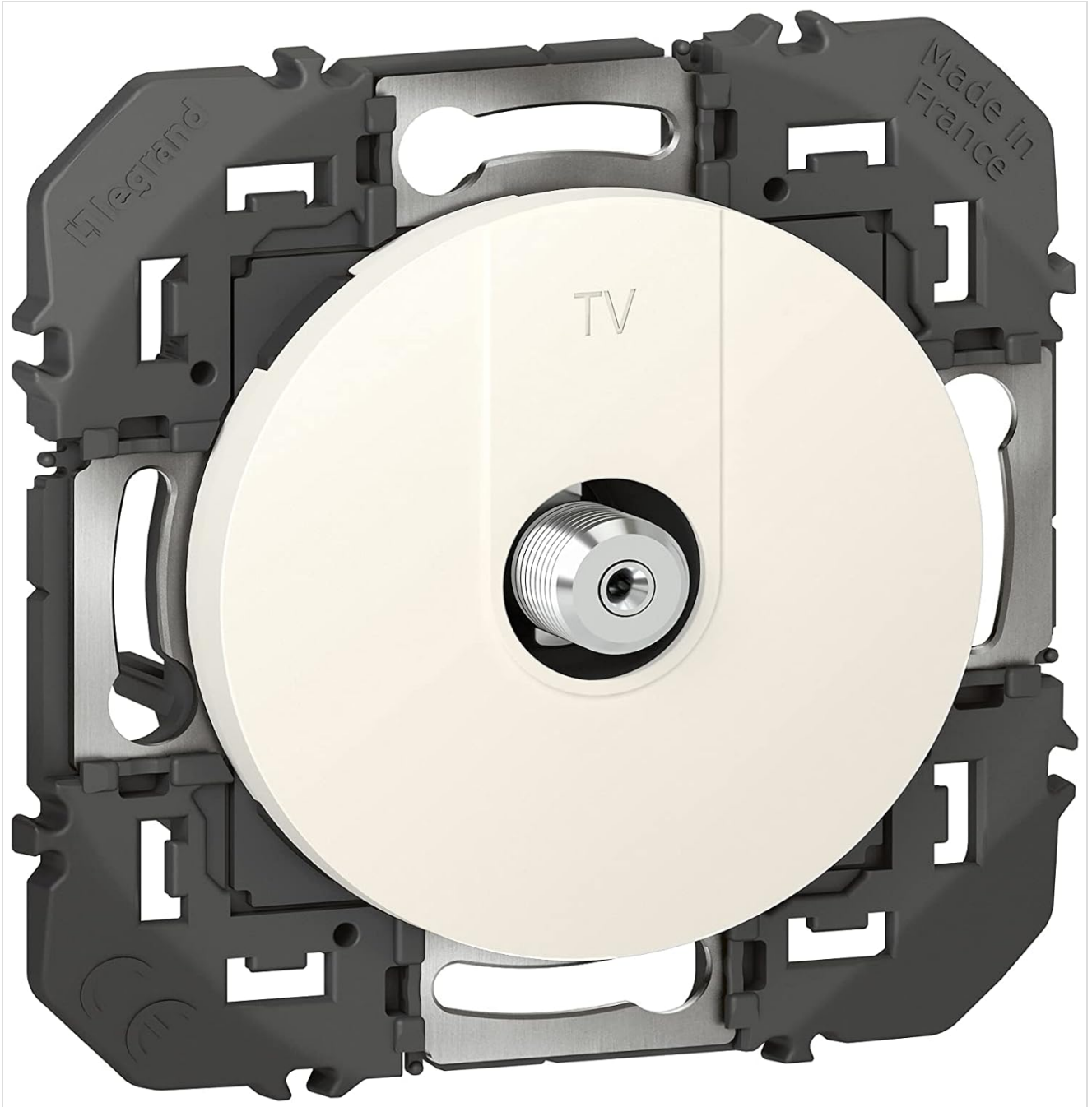
Image: Front view of the Legrand LEG95223 TV socket, highlighting the F-type connector and the robust mounting frame. This image shows the socket ready for installation into a wall box.