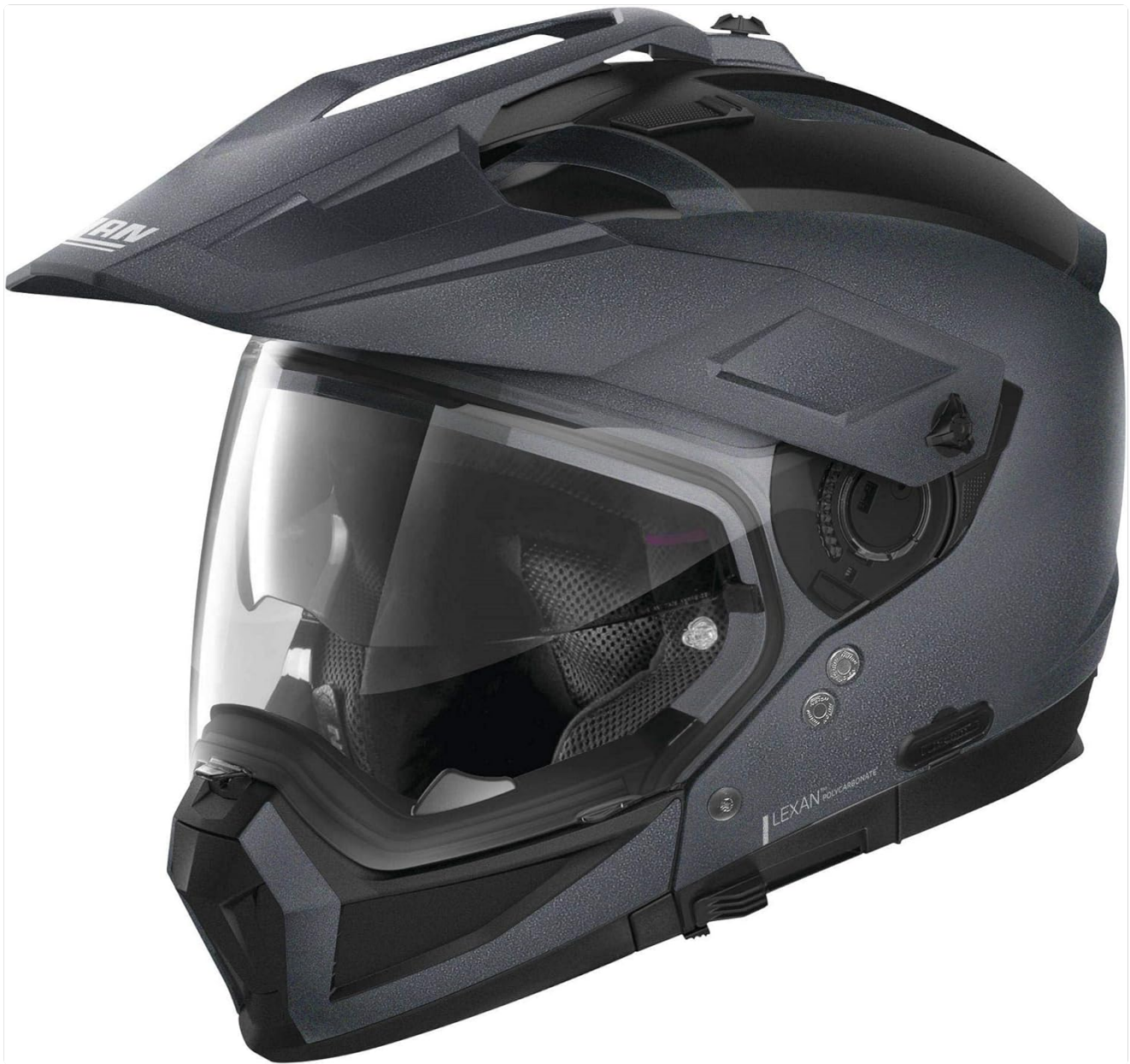
Figure 2.1: The Nolan N70-2 X Modular Helmet in its standard configuration with chin bar, face shield, and peak installed. This configuration provides the benefits of a full-face helmet.