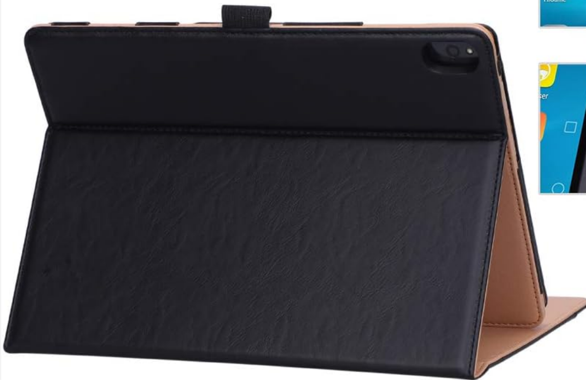
Figure 4.2: Precise cutouts ensure full access to all tablet features.