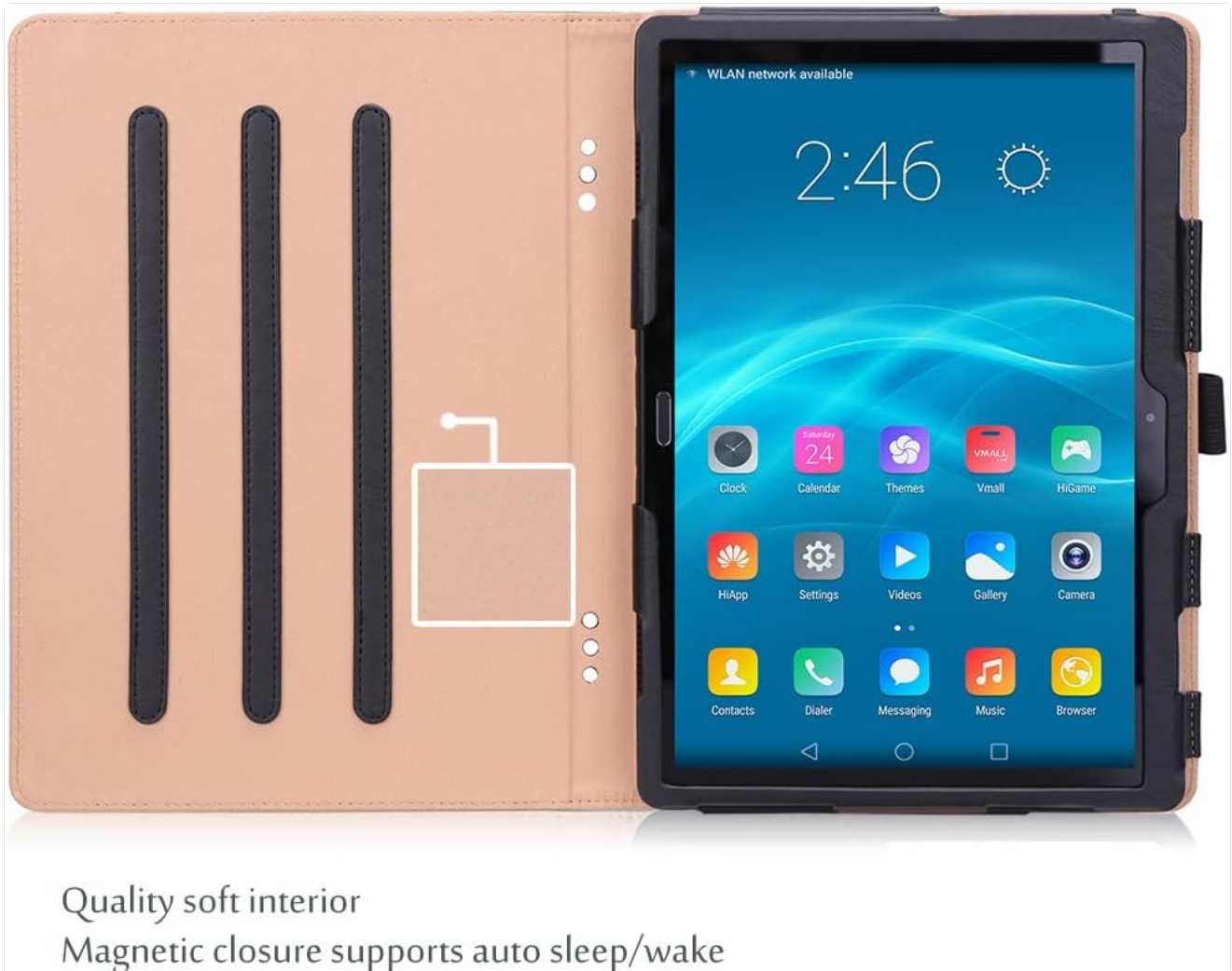
Figure 4.1: Open case interior, ready for tablet insertion.

Video 4.1: General installation guide for ProCase Vintage Stand Folio Cover. While this video features an iPad Pro, the installation steps are similar for your Lenovo tablet.