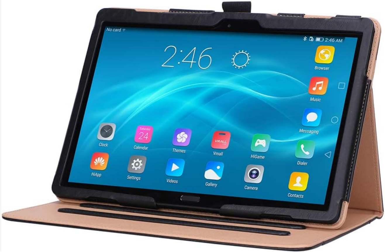
Figure 5.1: Tablet positioned in a stand angle for viewing.