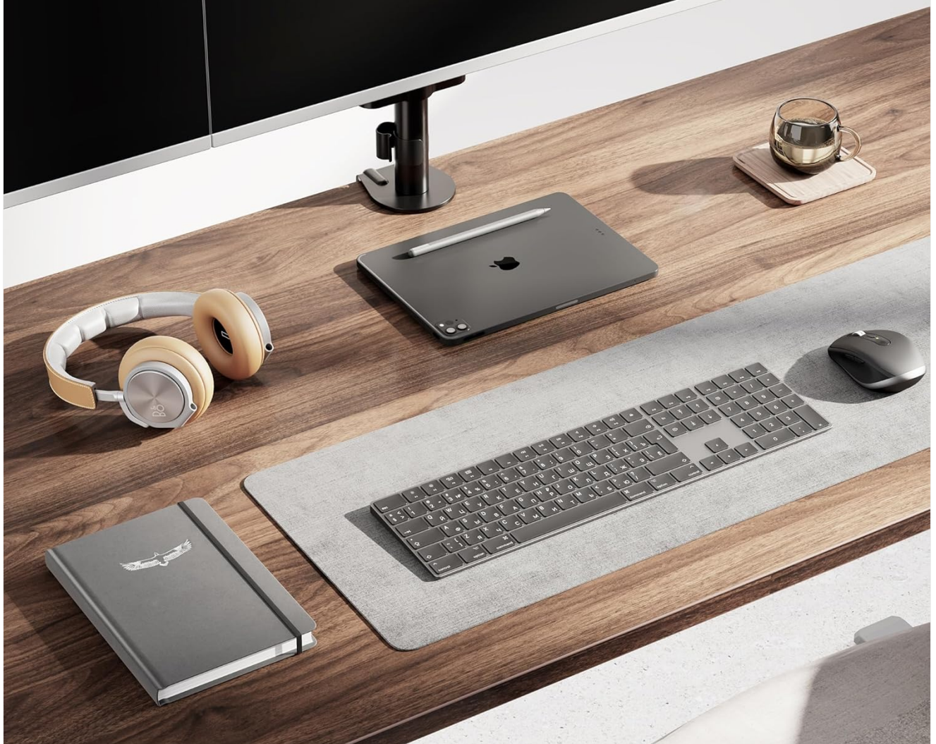
Image: The versatile design of the VonHaus Triple Monitor Stand makes it suitable for multiple workstations, whether for work, gaming, or general browsing.

Increases desktop space and offers a tidier appearance.