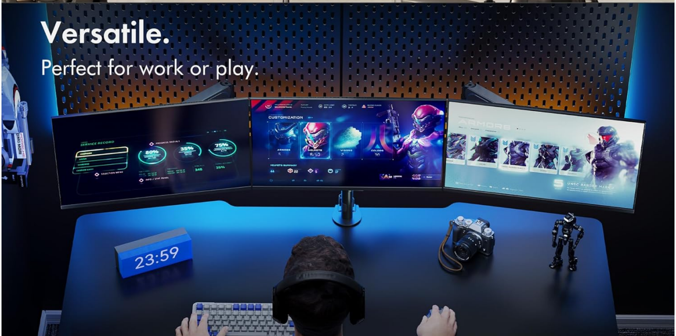
Image: The VonHaus Triple Monitor Stand helps to free up desk space, providing a tidier and more organized appearance for your workstation.