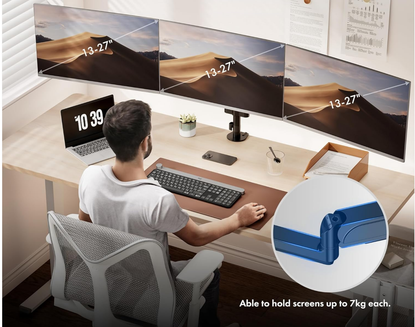
Image: The VonHaus Triple Monitor Stand is compatible with a wide range of screens, typically 13-27 inches, and supports VESA 75x75mm and 100x100mm mounting patterns.