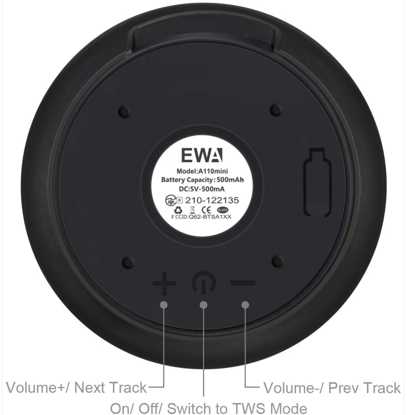
Image: Speaker bottom with labeled control buttons.