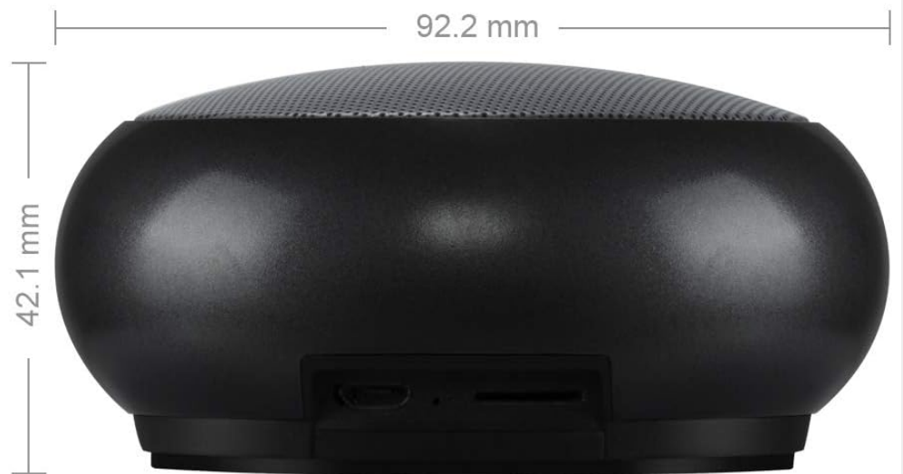
Image: EWA A110mini speaker with LED indicator and Micro SD Card slot labeled.