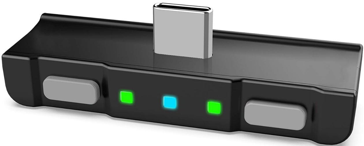
Figure 1: HomeSpot Bluetooth Audio Adapter (Model: HS3-NS002-GG)

The HomeSpot Bluetooth Audio Adapter (Model: HS3-NS002-GG) is designed to provide high-quality wireless audio and voice chat capabilities for your gaming consoles and PCs. This adapter offers low-latency audio transmission and supports dual headphone connections, making it ideal for an immersive and shared gaming experience.