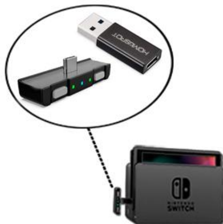
Figure 4: Items included in the HomeSpot Bluetooth Audio Adapter package.