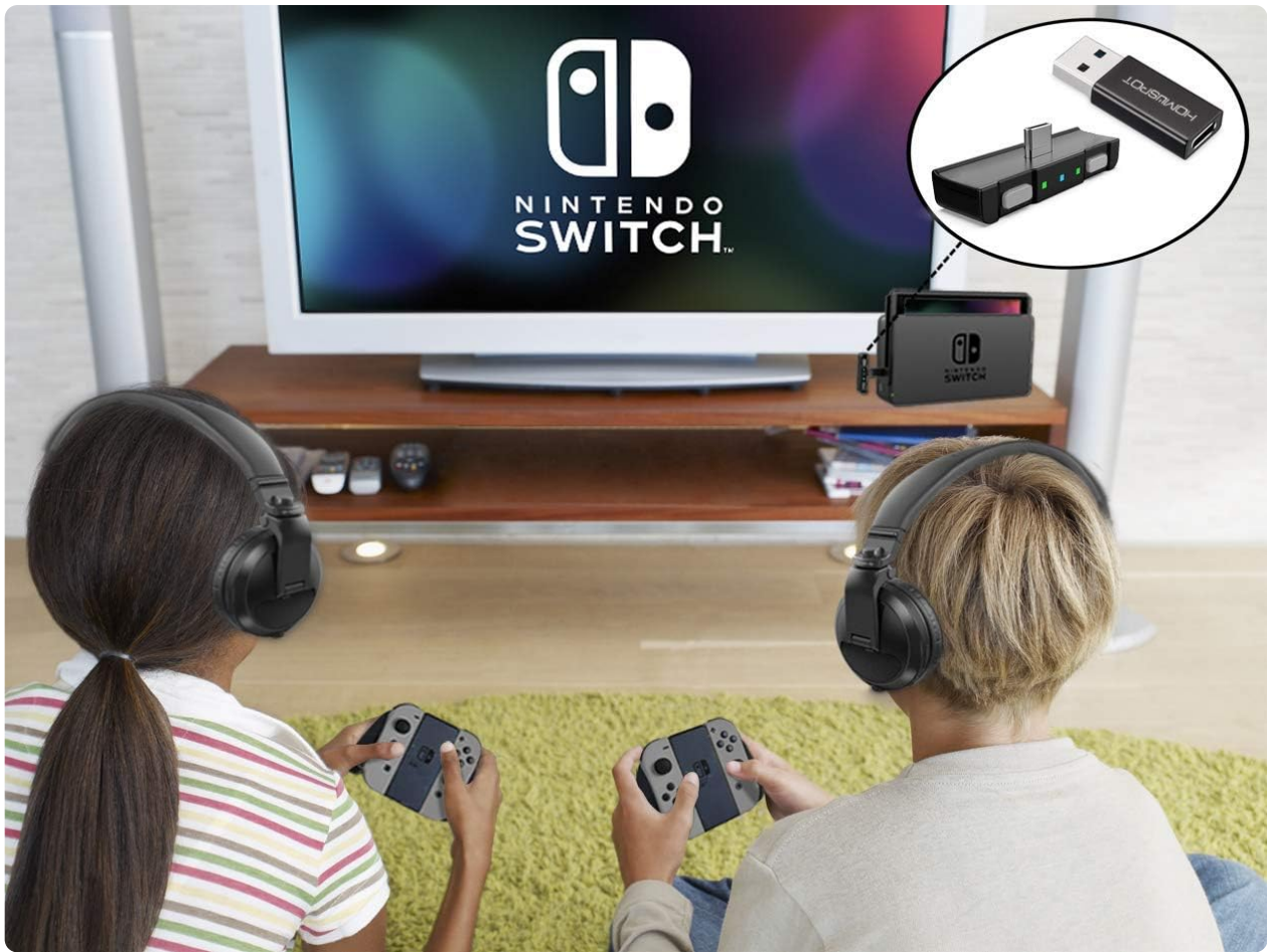
Figure 6: Adapter connected to Nintendo Switch dock.