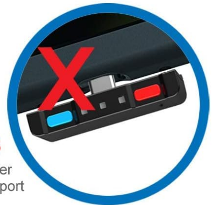
Figure 10: Adapter may not fit with protective casings.

Protective casing will prevent the adapter from being fully inserted into the USB-C port