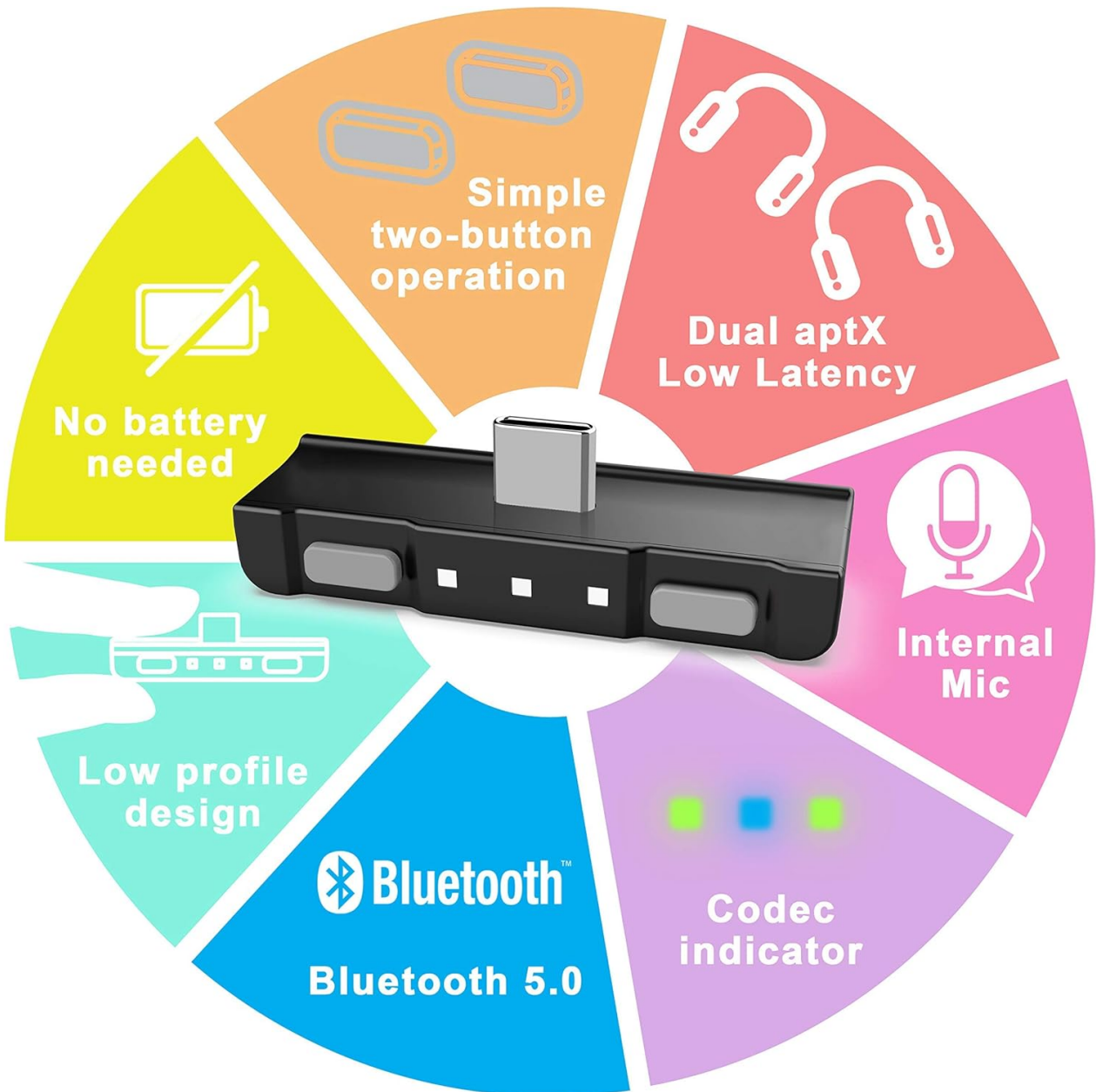
Figure 2: Key features of the HomeSpot Bluetooth Audio Adapter.