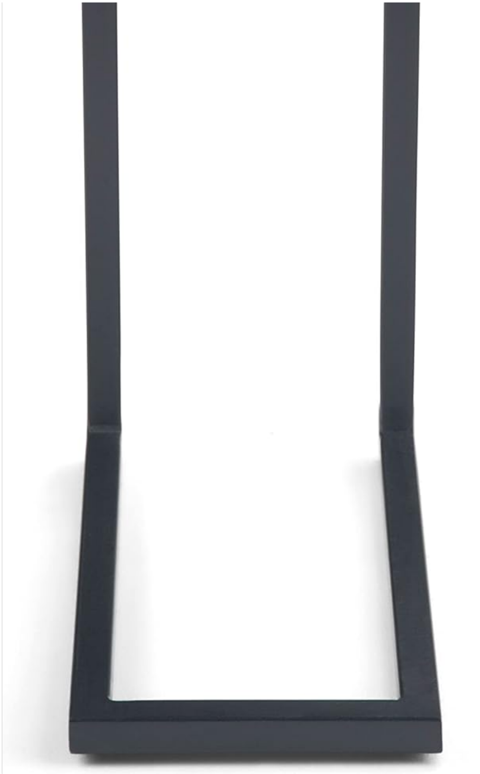
A direct front view of the C-Side table, highlighting the slim profile and the solid wood top.