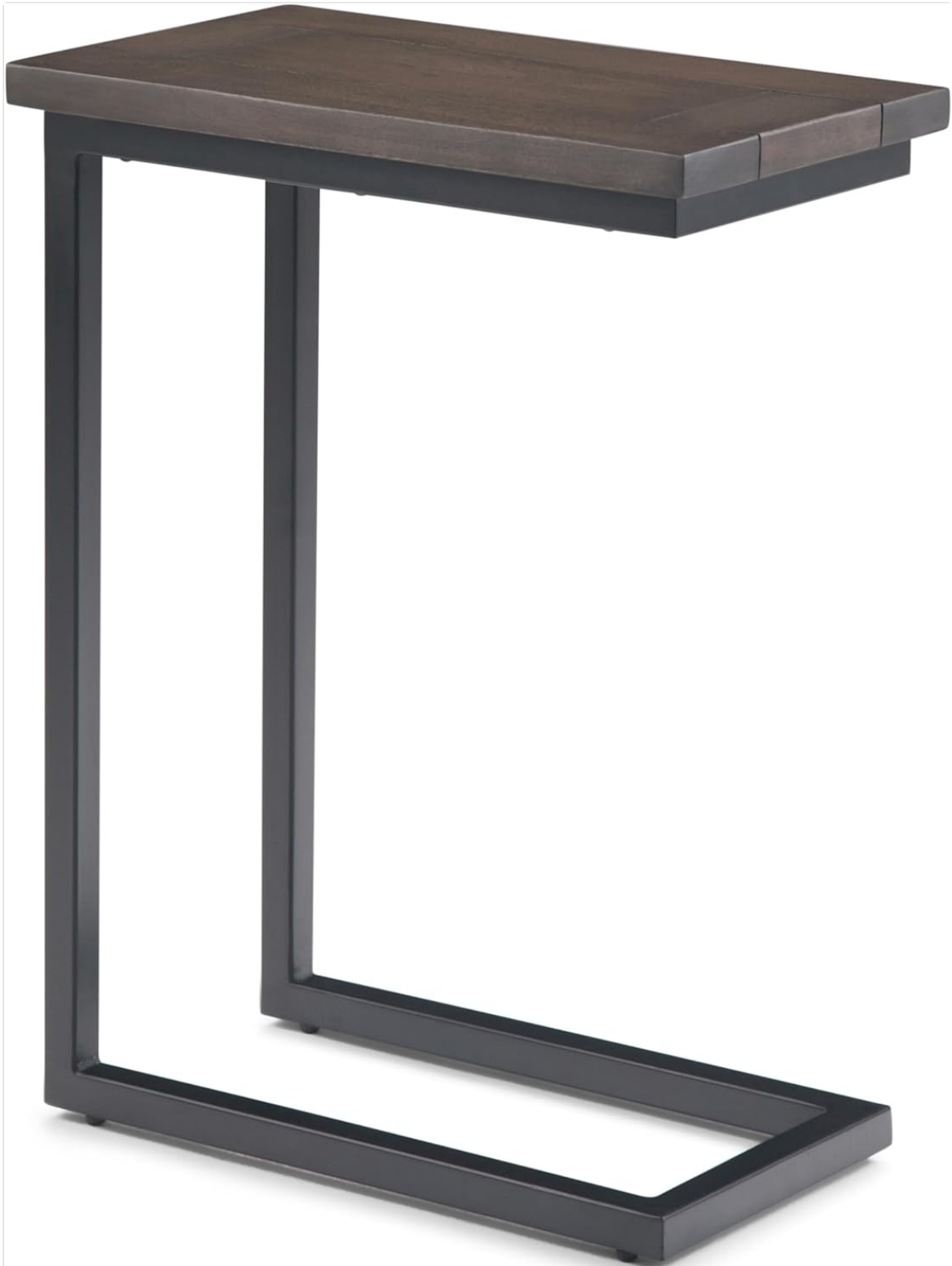
The SIMPLIHOME Skyler C-Side Table, showcasing its C-shaped design and Walnut Brown mango wood top with a black metal frame.