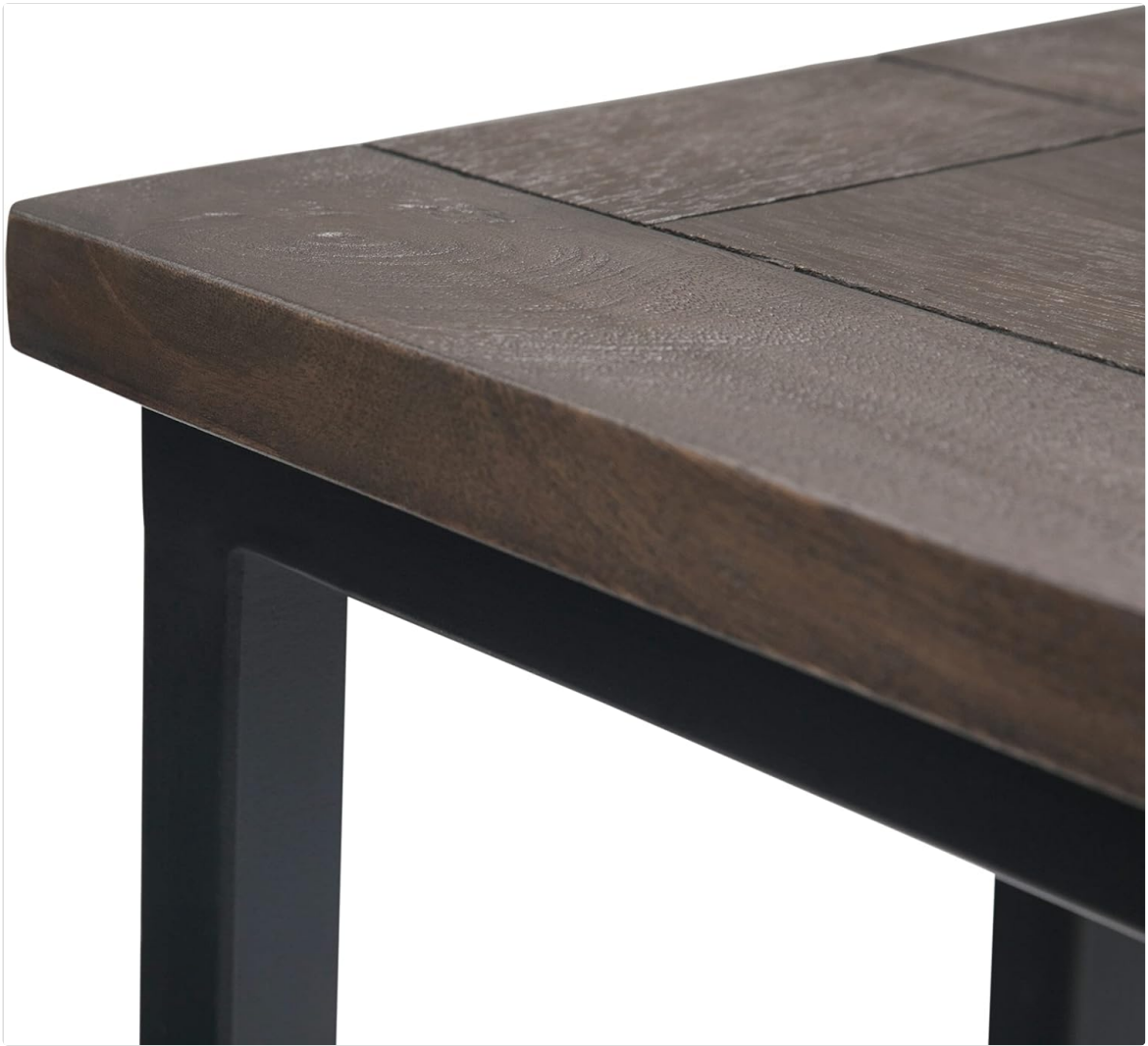
A detailed close-up of the mango wood tabletop, showing its grain and Walnut Brown finish.