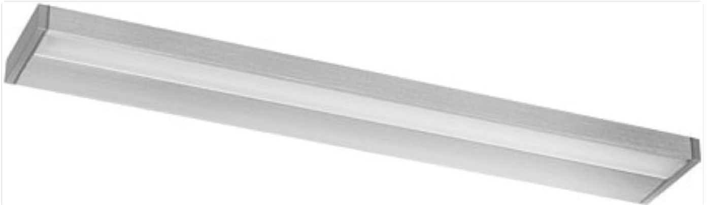
Figure 1: The IKEA Godmorgon LED Cabinet Wall Lamp, a sleek, elongated light fixture designed for bathroom environments.

The IKEA Godmorgon LED Cabinet Wall Lamp (Model 502.509.11) is designed to provide uniform lighting, ideal for illuminating areas around mirrors and washbasins. This LED light source is energy-efficient, consuming up to 85% less energy and lasting 20 times longer than incandescent bulbs. It is specifically designed to complement the GODMORGON bathroom series.