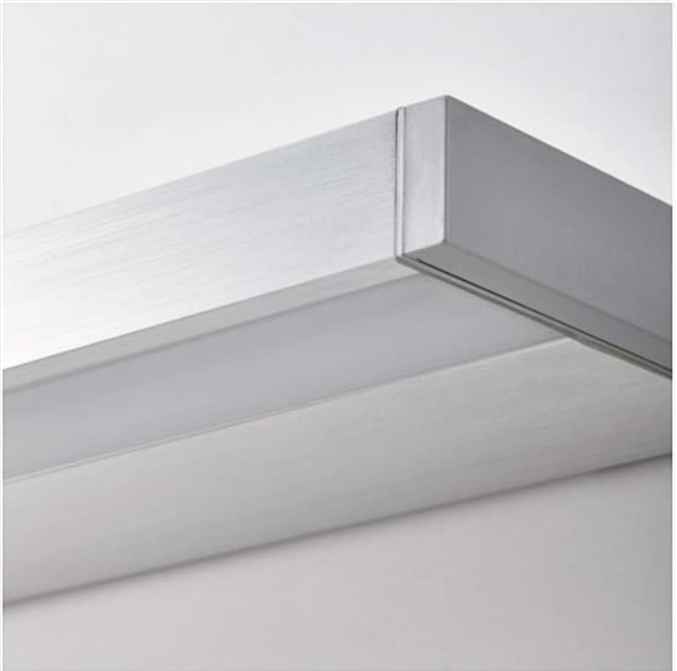
Figure 4: A close-up view of the end of the lamp, showing its sleek design and integrated LED light strip.