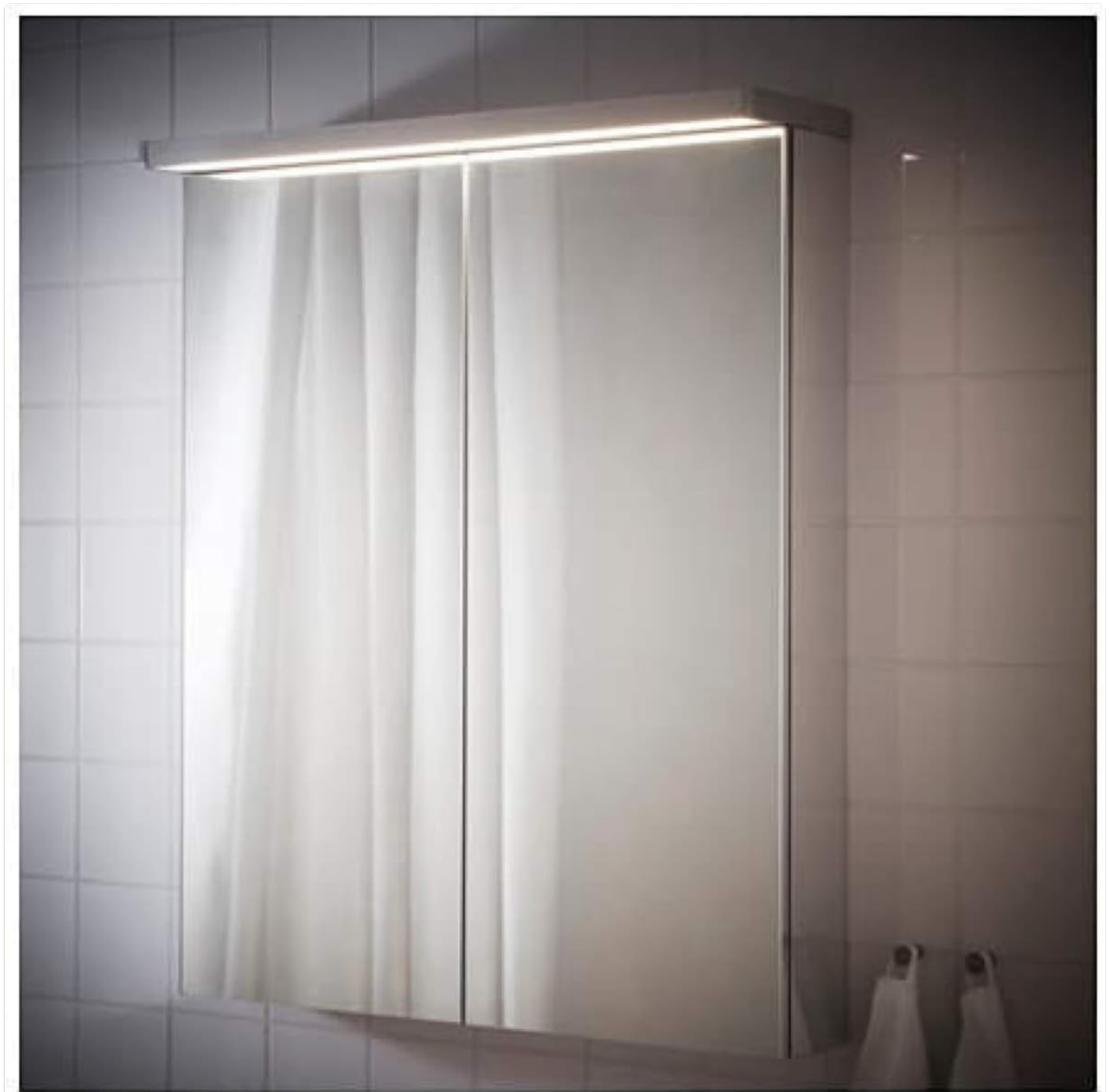
Figure 3: The IKEA Godmorgon LED Cabinet Wall Lamp installed above a mirror cabinet, demonstrating its intended use for illuminating bathroom vanity areas.