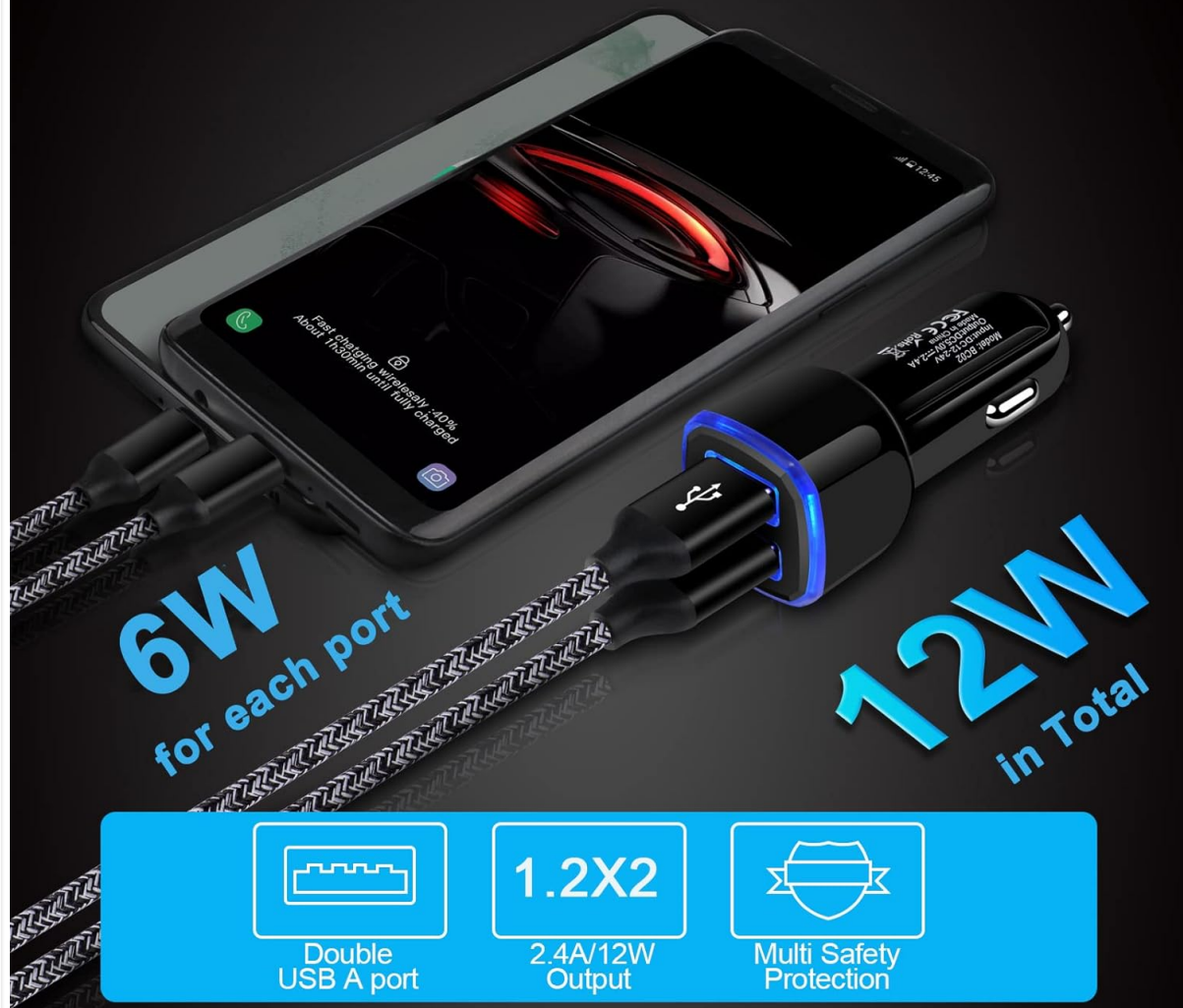
Image: A close-up of the ANDHOT car charger connected to a smartphone, detailing its 12W total output and dual USB ports.