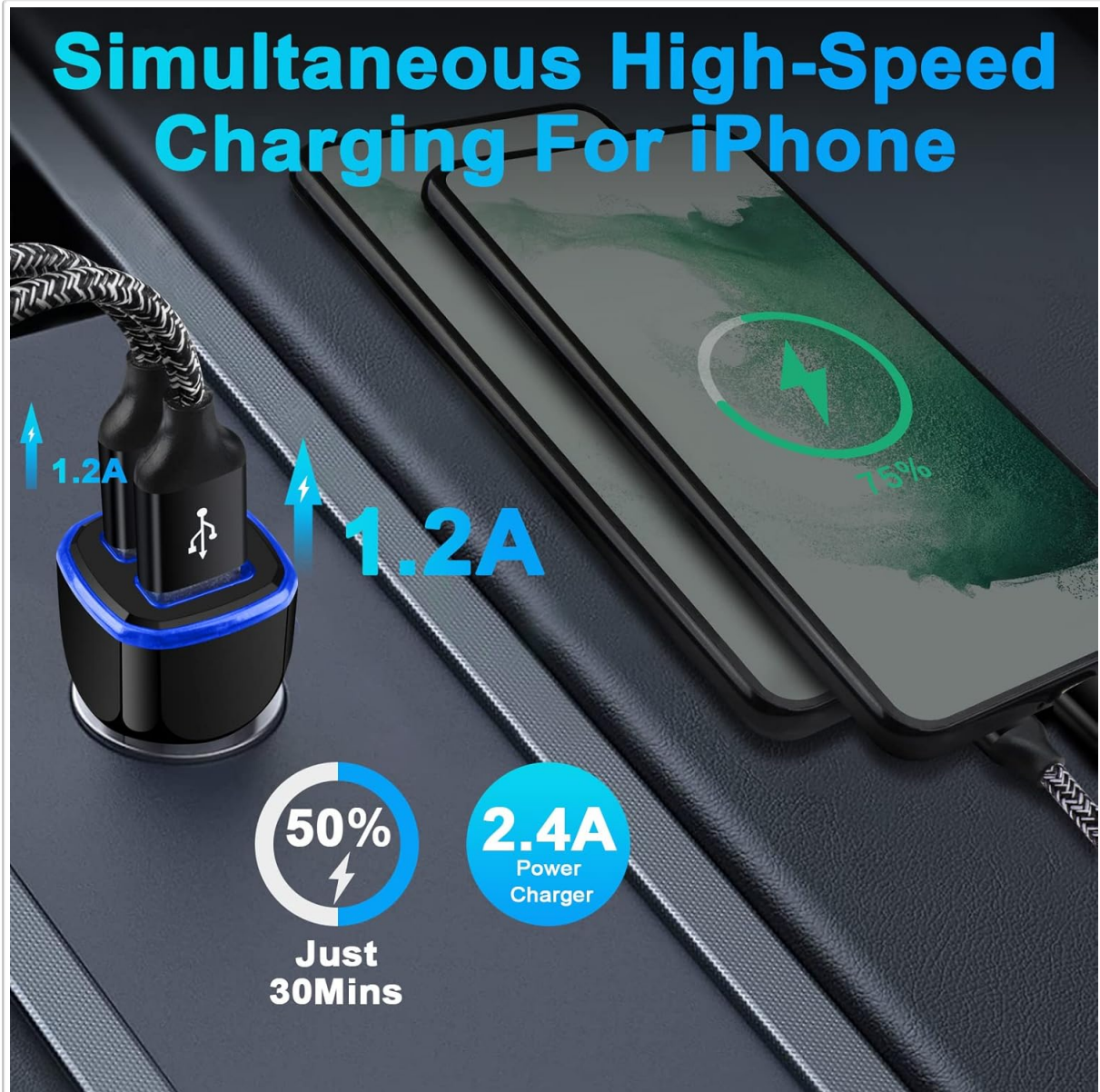
Image: The ANDHOT car charger providing simultaneous charging to two smartphones, illustrating the 1.2A output per port for a total of 2.4A.