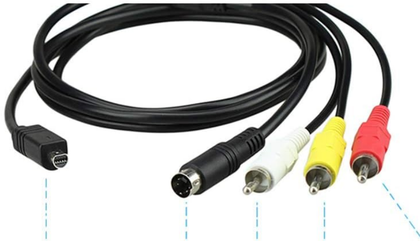
Semicircle DV interface