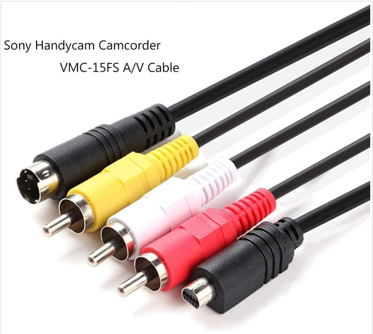
Image: The WYMECT VMC-15FS A/V Cable with its 10-pin camcorder connector and S-Video, yellow video, red audio, and white audio RCA connectors.