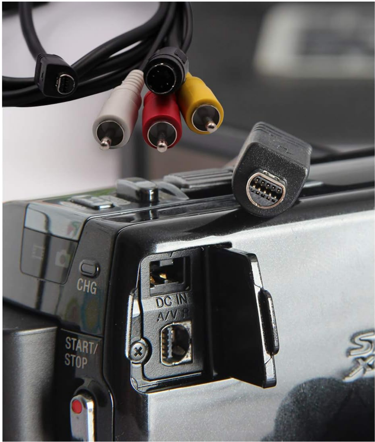
Image: A close-up view of the 10-pin connector being inserted into the A/V port of a Sony Handycam camcorder.