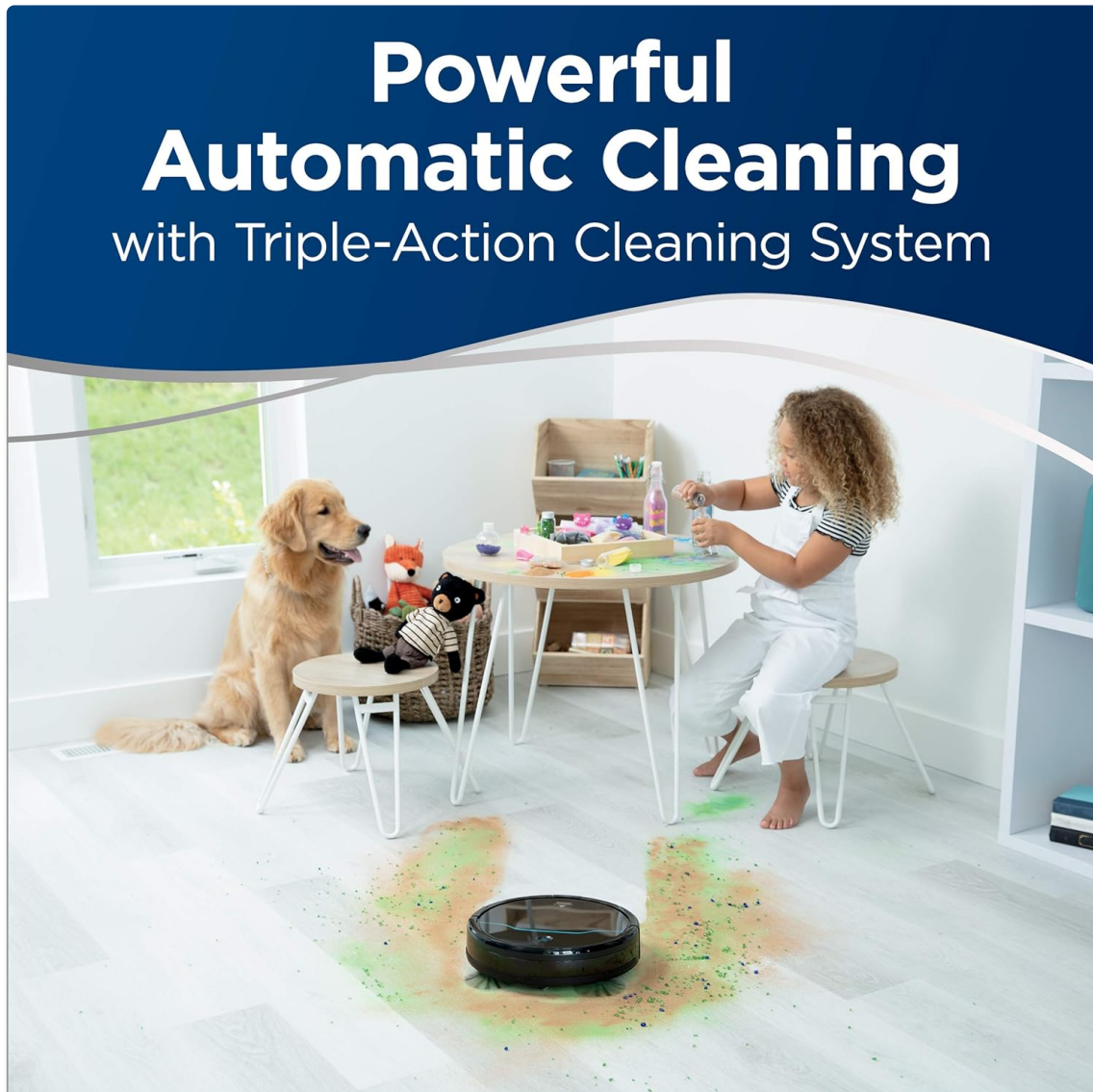
Image: The Bissell EV675 Robot Vacuum actively cleaning a floor, demonstrating its automatic cleaning capabilities.

Press the power button once to start a cleaning cycle. The robot will automatically begin cleaning in a systematic pattern. Alternatively, use the remote control to select a cleaning mode or start cleaning.