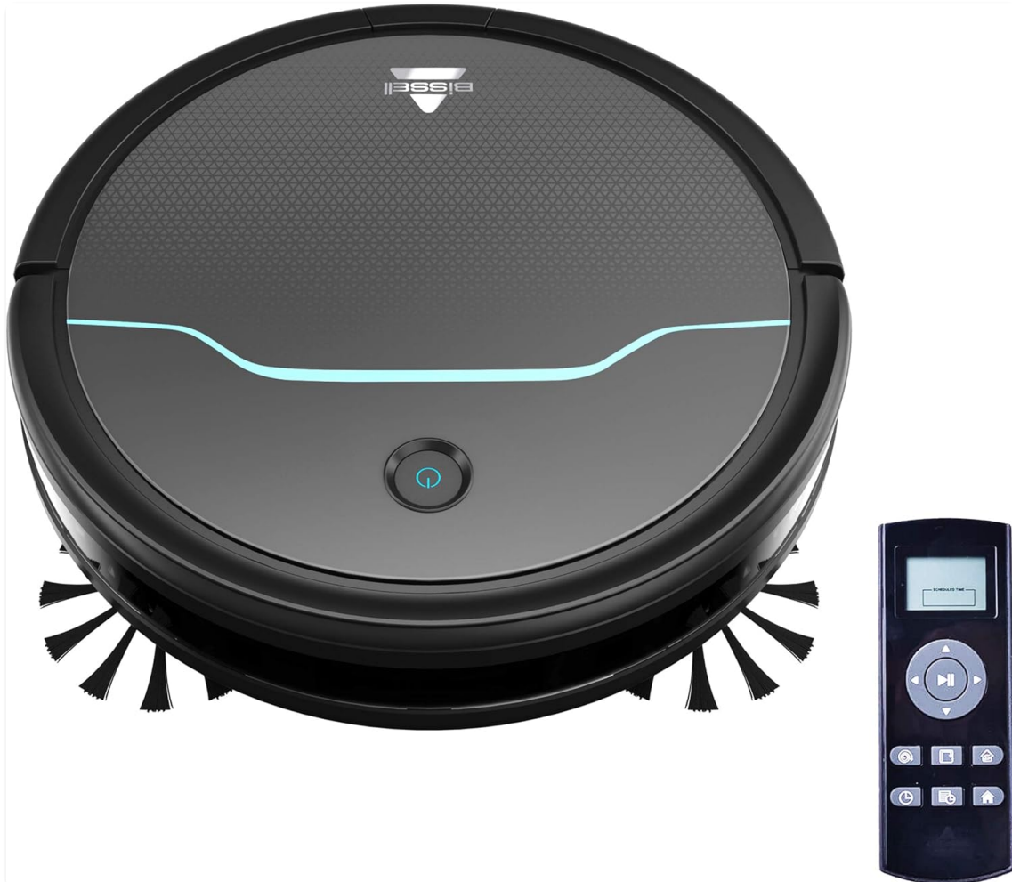
Image: Top view of the Bissell EV675 Robot Vacuum Cleaner with its remote control.

The Bissell EV675 is a robotic vacuum designed for efficient floor cleaning, especially effective on pet hair. It features a low-profile design to clean hard-to-reach spaces and a self-charging dock for convenience.