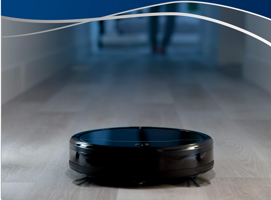
Image: The Bissell EV675 Robot Vacuum positioned in a hallway, illustrating its readiness for pre-set cleaning schedules.

This image depicts the robot vacuum in a typical home setting, ready to execute its programmed cleaning schedule.