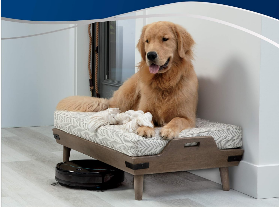
Image: The Bissell EV675 Robot Vacuum cleaning under a pet bed, demonstrating its low-profile design.

This image illustrates the vacuum's ability to clean under furniture, reaching areas that are typically difficult to access.