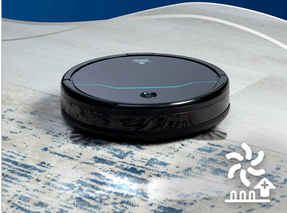
Image: The Bissell EV675 Robot Vacuum transitioning from a hard floor to a patterned rug, showcasing its multi-surface cleaning capability.

This image highlights the vacuum's versatility in cleaning different floor types, including carpets.