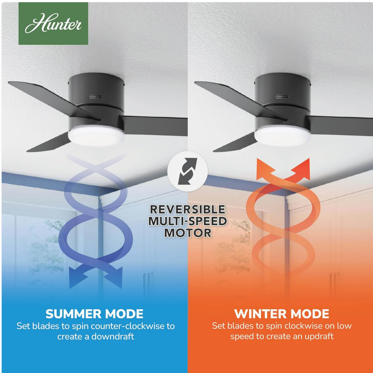
Image 6: Reversible Multi-Speed Motor showing Summer Mode (downdraft) and Winter Mode (updraft).

Adjust your fan's direction to optimize comfort and energy efficiency throughout the year.