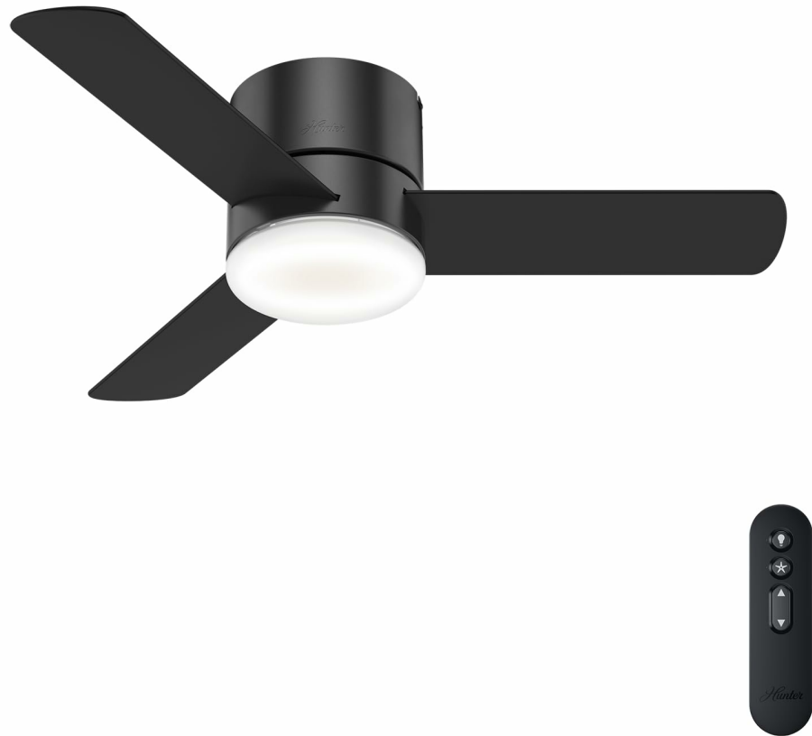
Image 1: Hunter Minimus 44-inch Matte Black Ceiling Fan with LED Light.