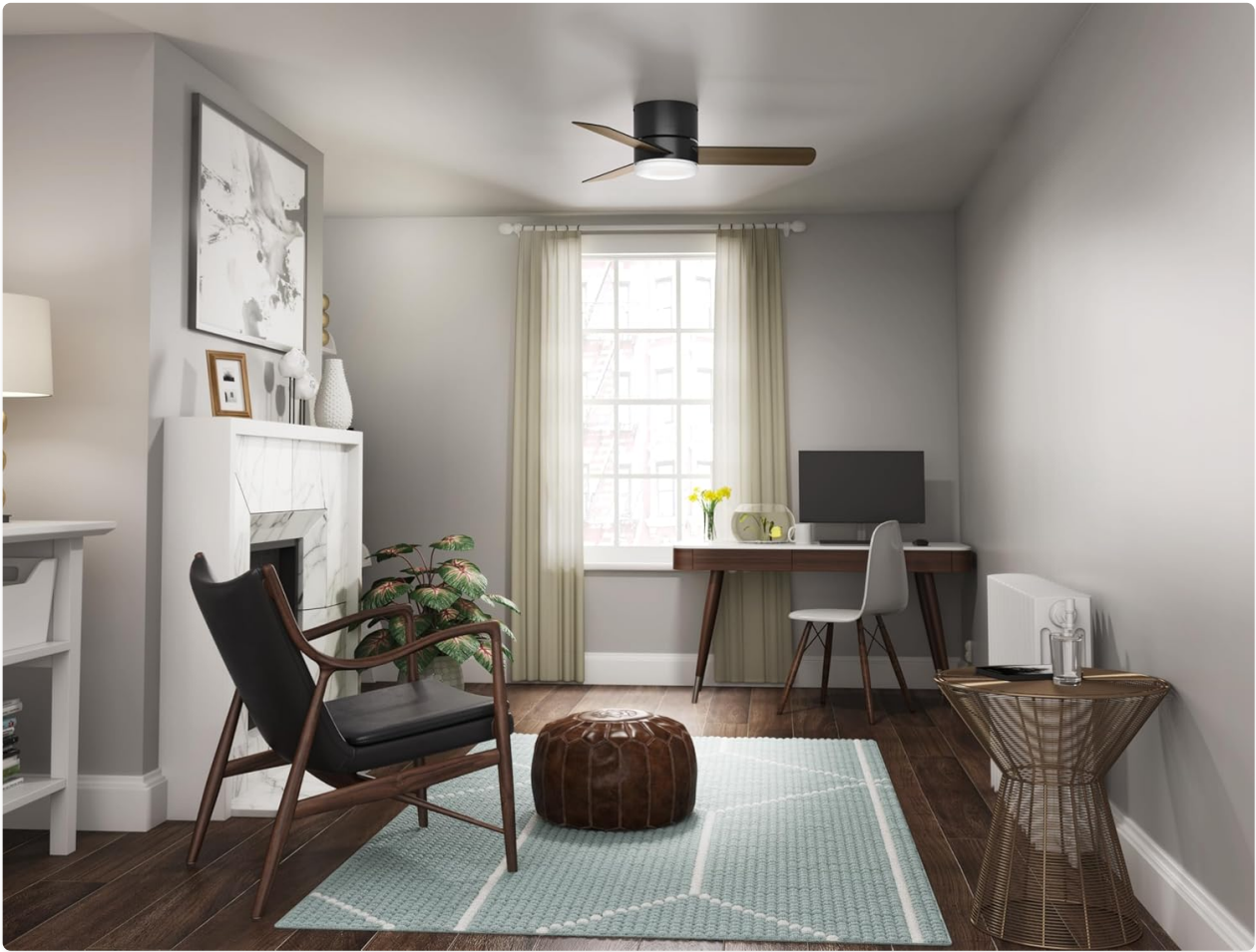
Image 4: Hunter Minimus 44-inch Ceiling Fan installed in a modern home office setting.