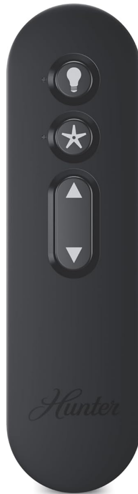
Image 5: Hunter Minimus Remote Control with buttons for light, fan on/off, speed adjustment, and direction change.

Video 3: How to Use a Hunter Remote. This video demonstrates the functions of the Hunter remote control for light, fan speed, and direction.