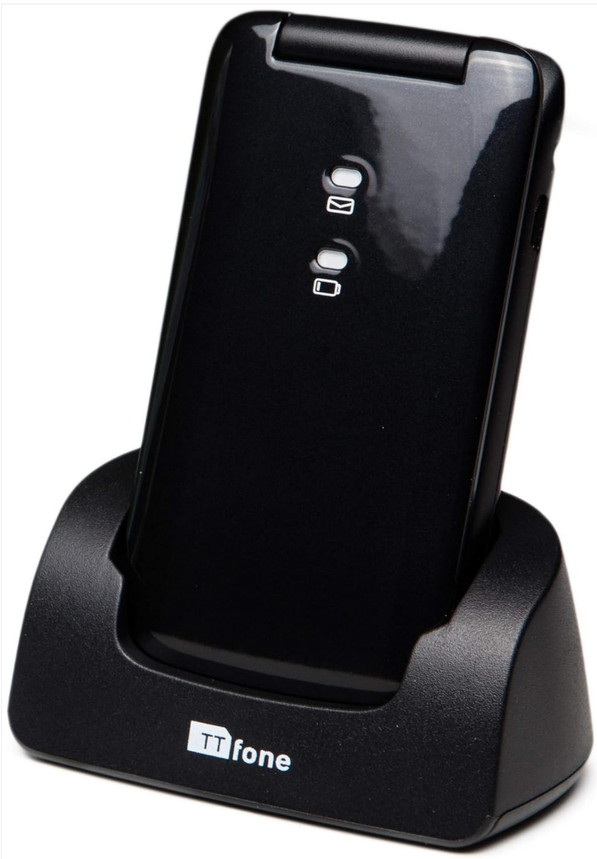
Image: The TTfone Nova TT650 flip phone closed and resting in its black charging dock, ready to charge.