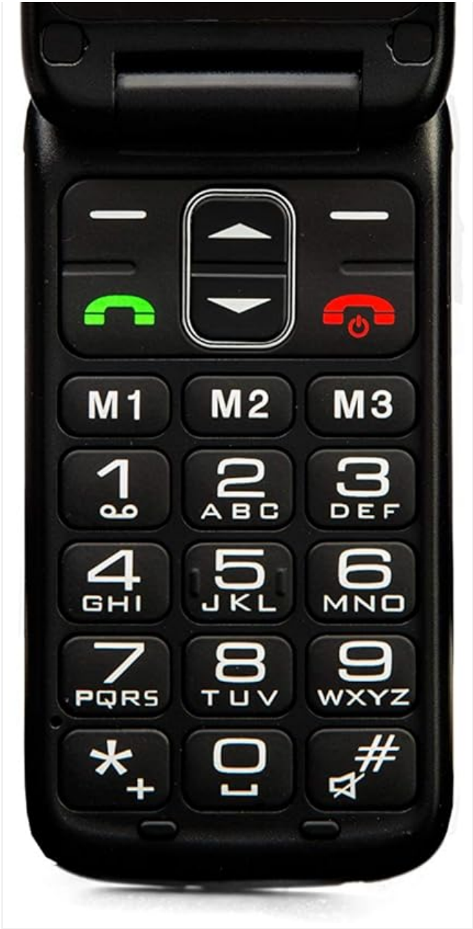
Image: The TTfone Nova TT650 flip phone fully open, showcasing its large, clearly labeled keypad and simple display interface.