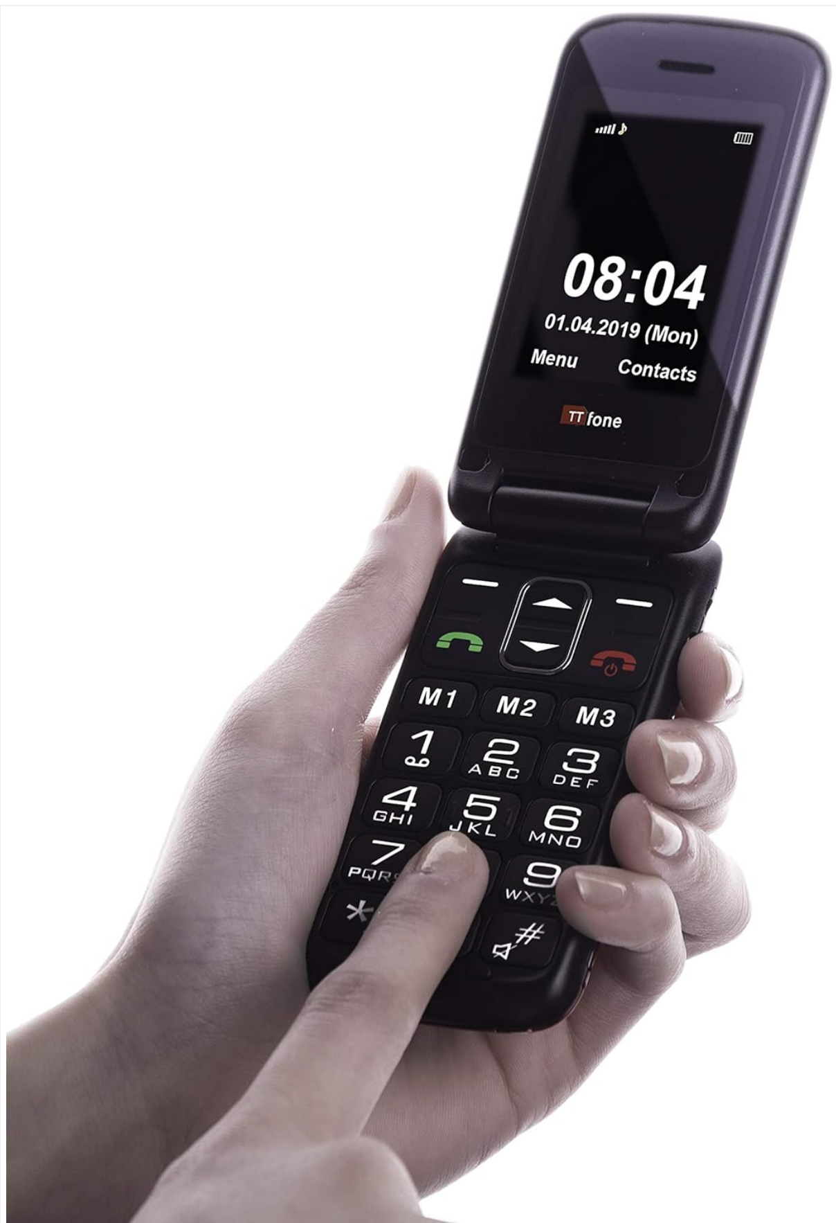
Image: A hand pressing a button on the large keypad of the open TTfone Nova TT650 flip phone, demonstrating ease of use.