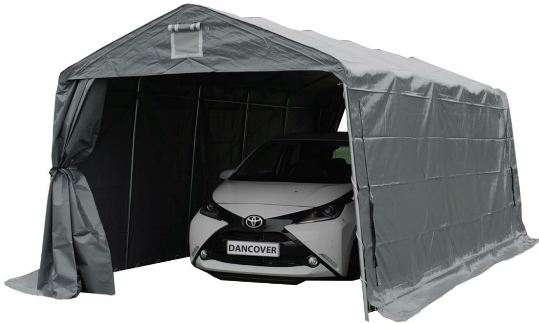
Image 1.1: The Dancover PRO Garage Tent fully assembled, providing shelter for a vehicle.