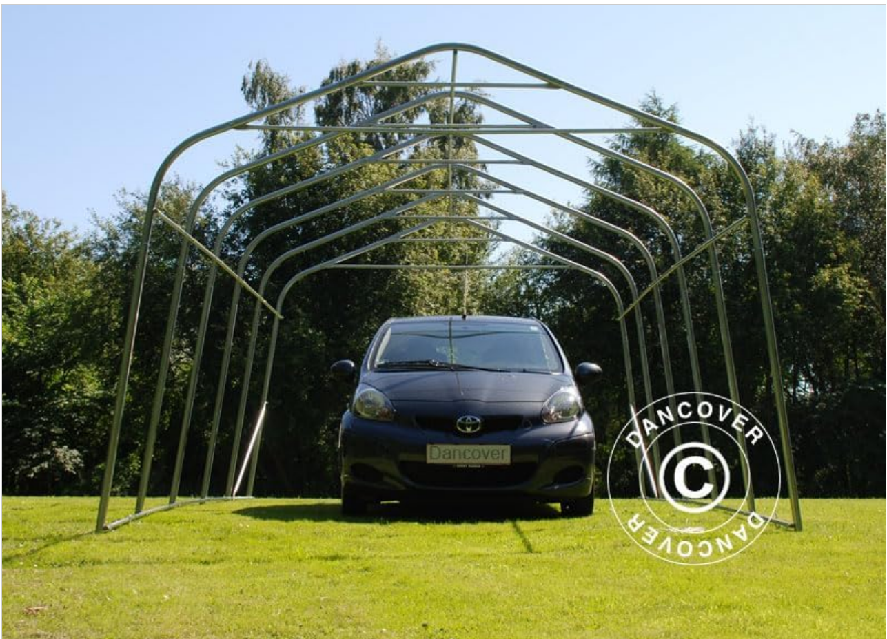
Image 4.1: The robust galvanized steel frame structure before the cover is applied.