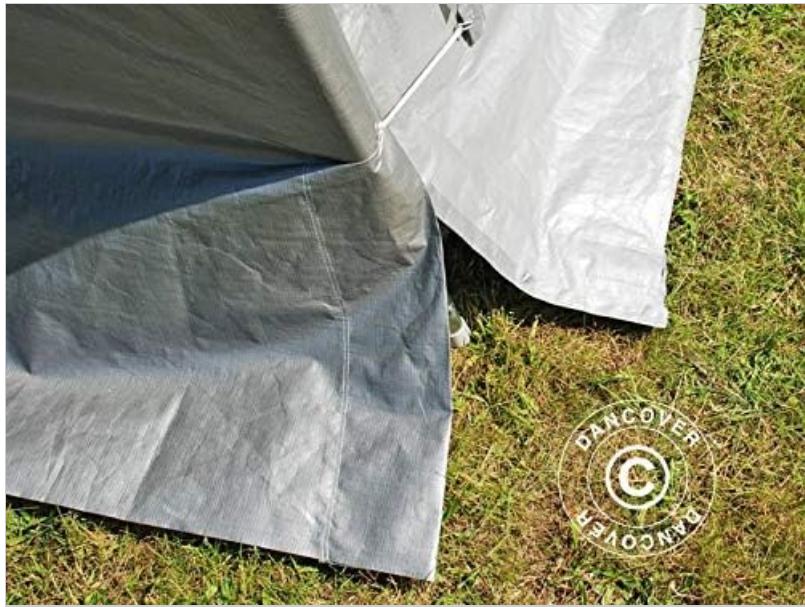
Image 4.4: The ground flap designed to be buried or weighted for enhanced stability and protection.