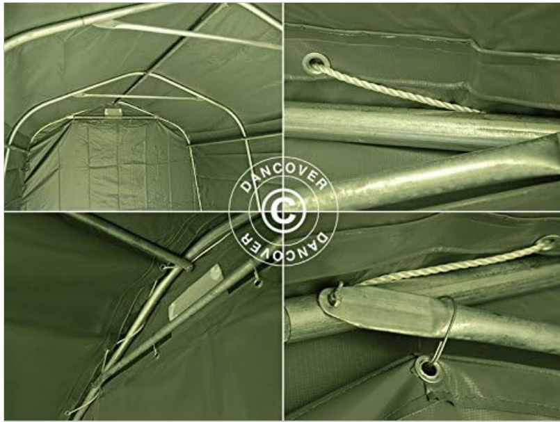
Image 4.2: Detail of the frame connections and rope attachment points for securing the cover.