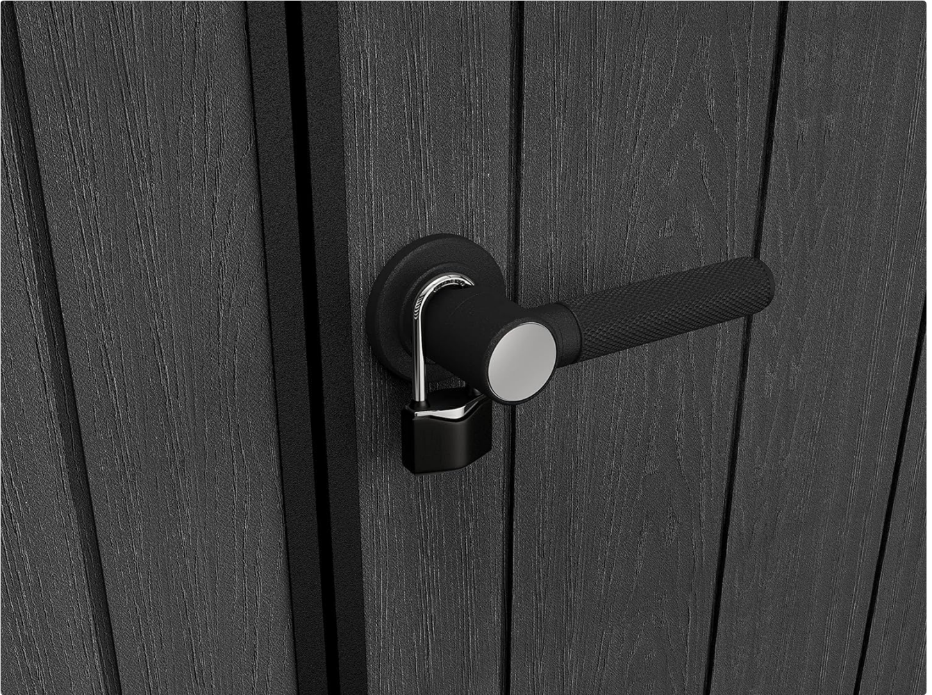
Image: Close-up of the shed's door handle, showing the integrated locking mechanism where a padlock can be attached.