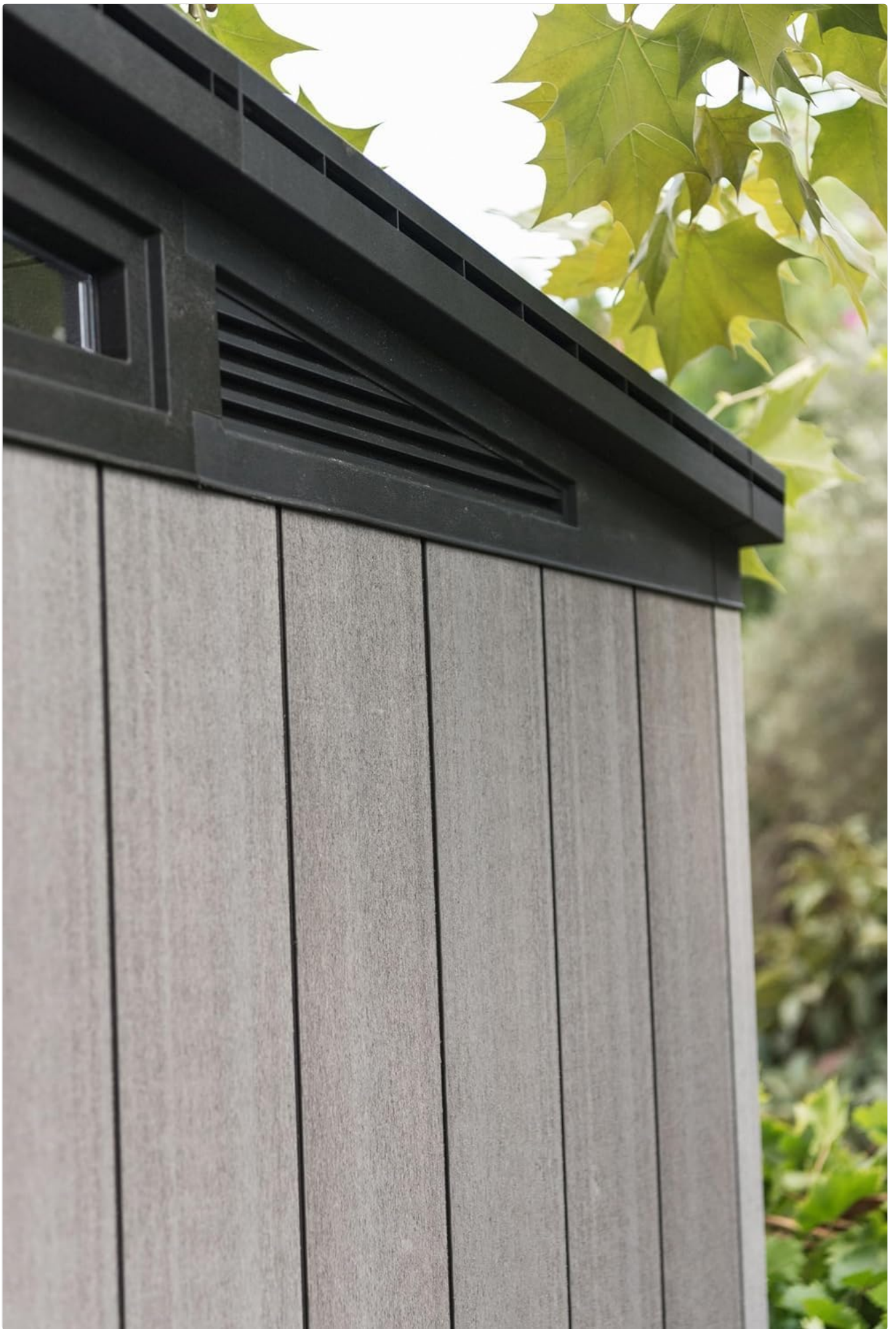
Image: Detail of the ventilation grille located near the roofline, ensuring airflow within the shed.