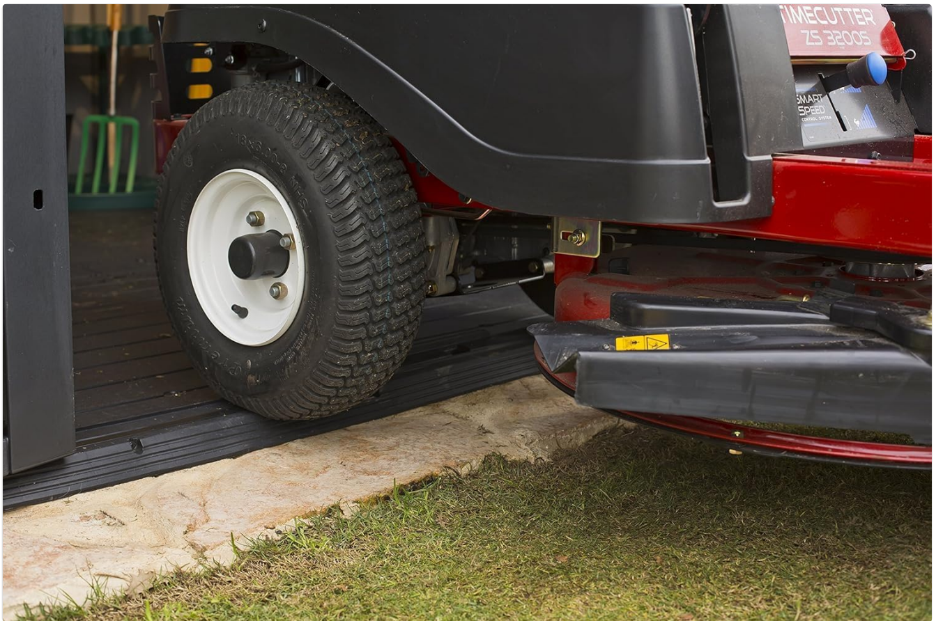
Image: The inclined threshold at the shed entrance, designed for smooth passage of wheeled equipment.