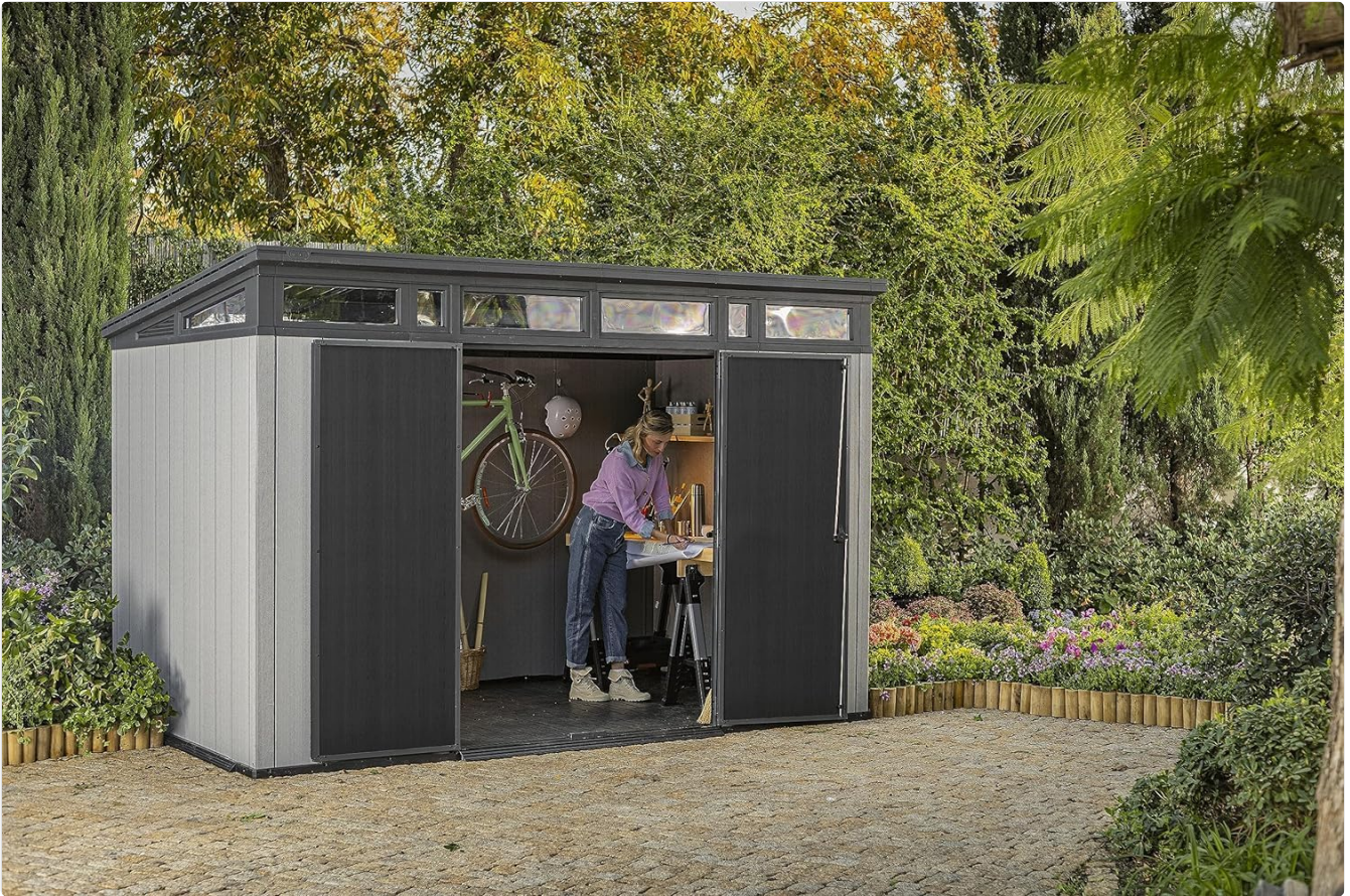
Image: The interior of the Keter Artisan 117 shed with doors fully open, showing a person organizing items.