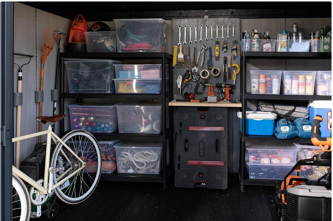
Image: An organized interior view of the shed, demonstrating potential storage solutions for various tools and equipment.