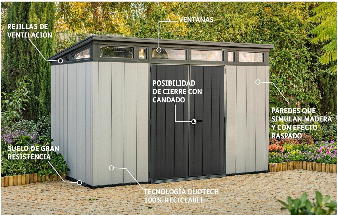
Image: An exterior view of the Keter Artisan 117 shed, illustrating its overall design and structure.