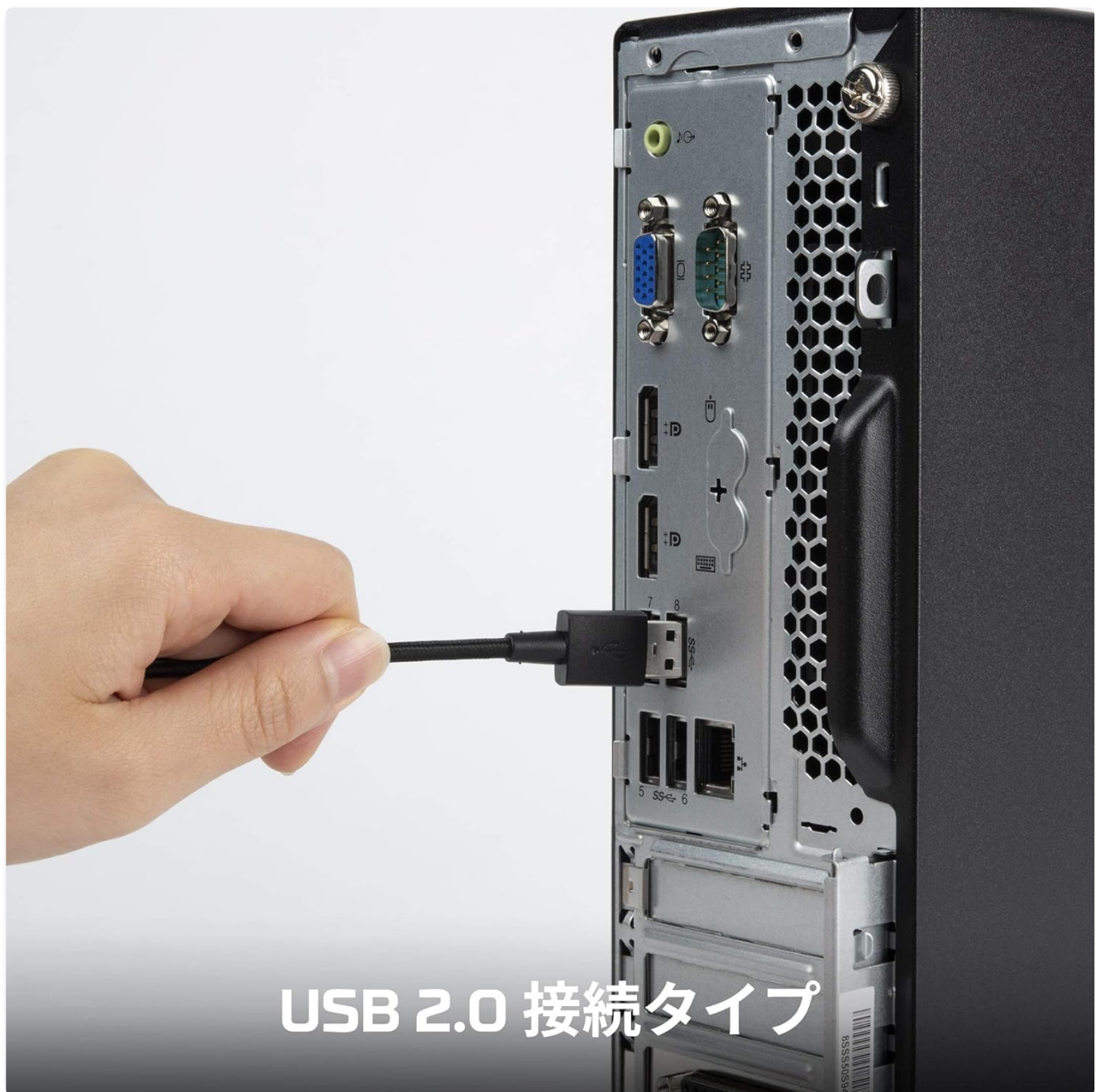
Image: A hand connecting the USB-A cable of the keyboard to a computer's USB port.

Video: This video demonstrates the physical handling of the keyboard, including adjusting the feet for optimal typing angle, and showcases the initial RGB lighting effects upon connection.