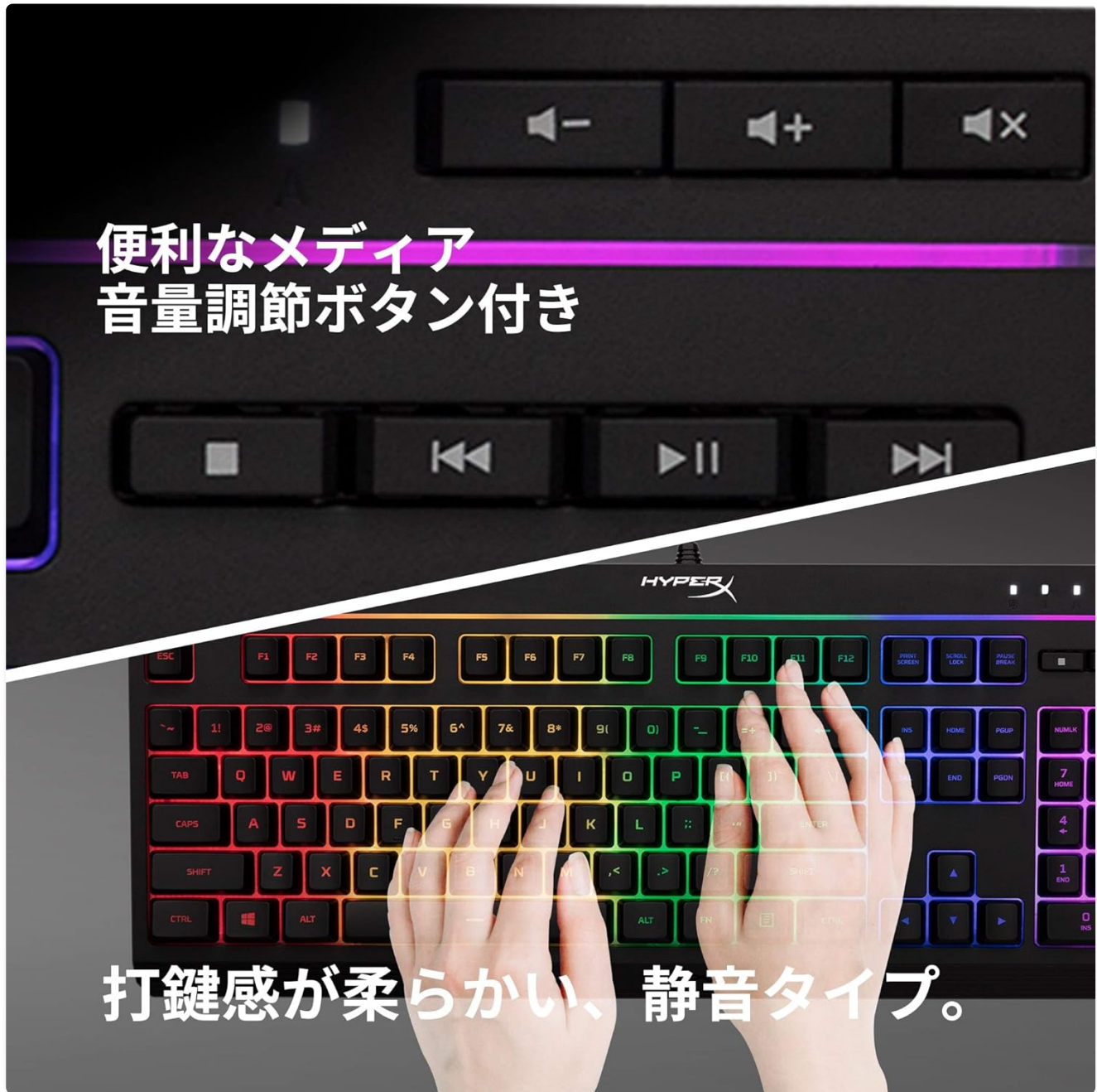
Image: Close-up of the dedicated media control buttons on the top right of the keyboard.