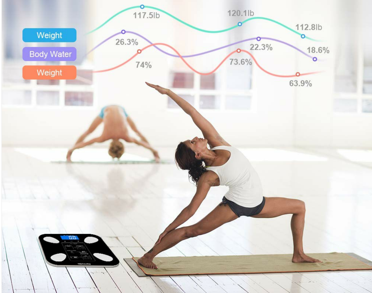
Image: A graphical representation demonstrating how the scale can help record and track changes in body composition data, such as weight and body water, over time.