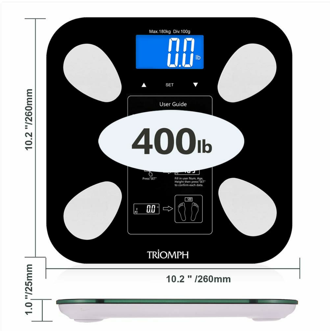
Image: The Triumph Body Fat Scale with its dimensions (10.2 inches / 260mm square, 1.0 inch / 25mm thick) and a maximum capacity of 400 lbs (180 kg) displayed on the screen.