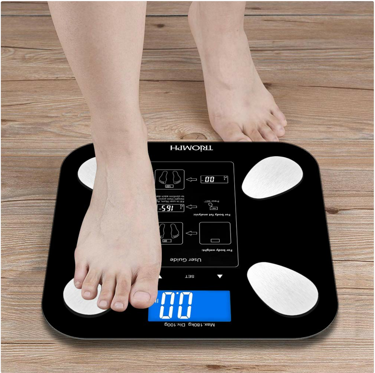
Image: A person standing barefoot on the Triumph Body Fat Scale, demonstrating the correct posture for taking a measurement.