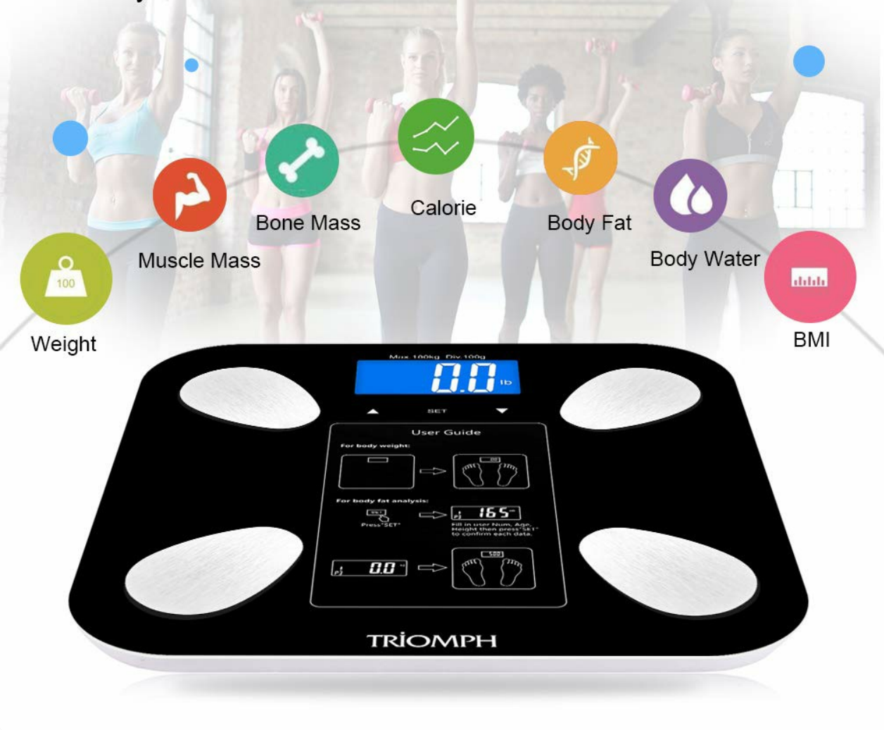
Image: An overview of the 7 key body composition metrics measured by the scale: Weight, Muscle Mass, Bone Mass, Calorie, Body Fat, Body Water, and BMI.

7 key body composition metrics give you a comprehensive view for your health.