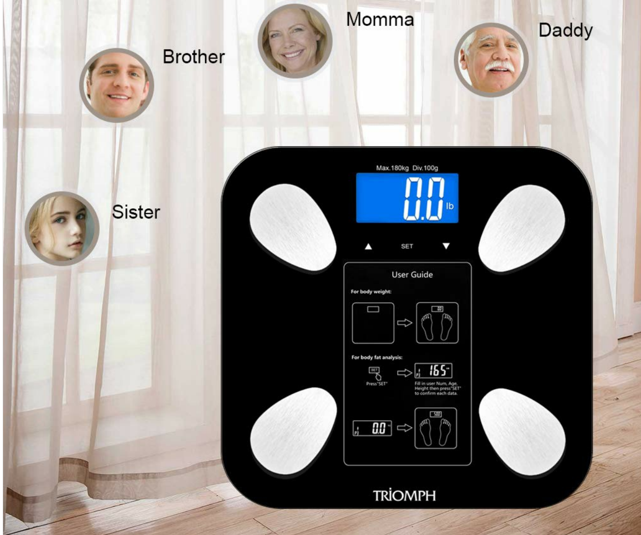
Image: The scale's display showing user profile indicators (P1, P2, etc.) and images representing different family members, illustrating its capacity to store data for up to 10 users.