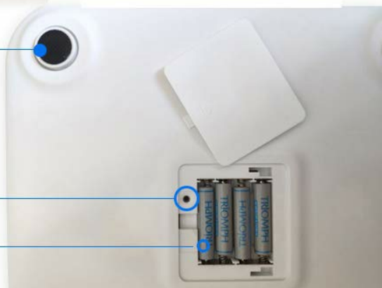
Image: The underside of the scale, highlighting the battery compartment for 4 AAA batteries and anti-skid padding for stability.