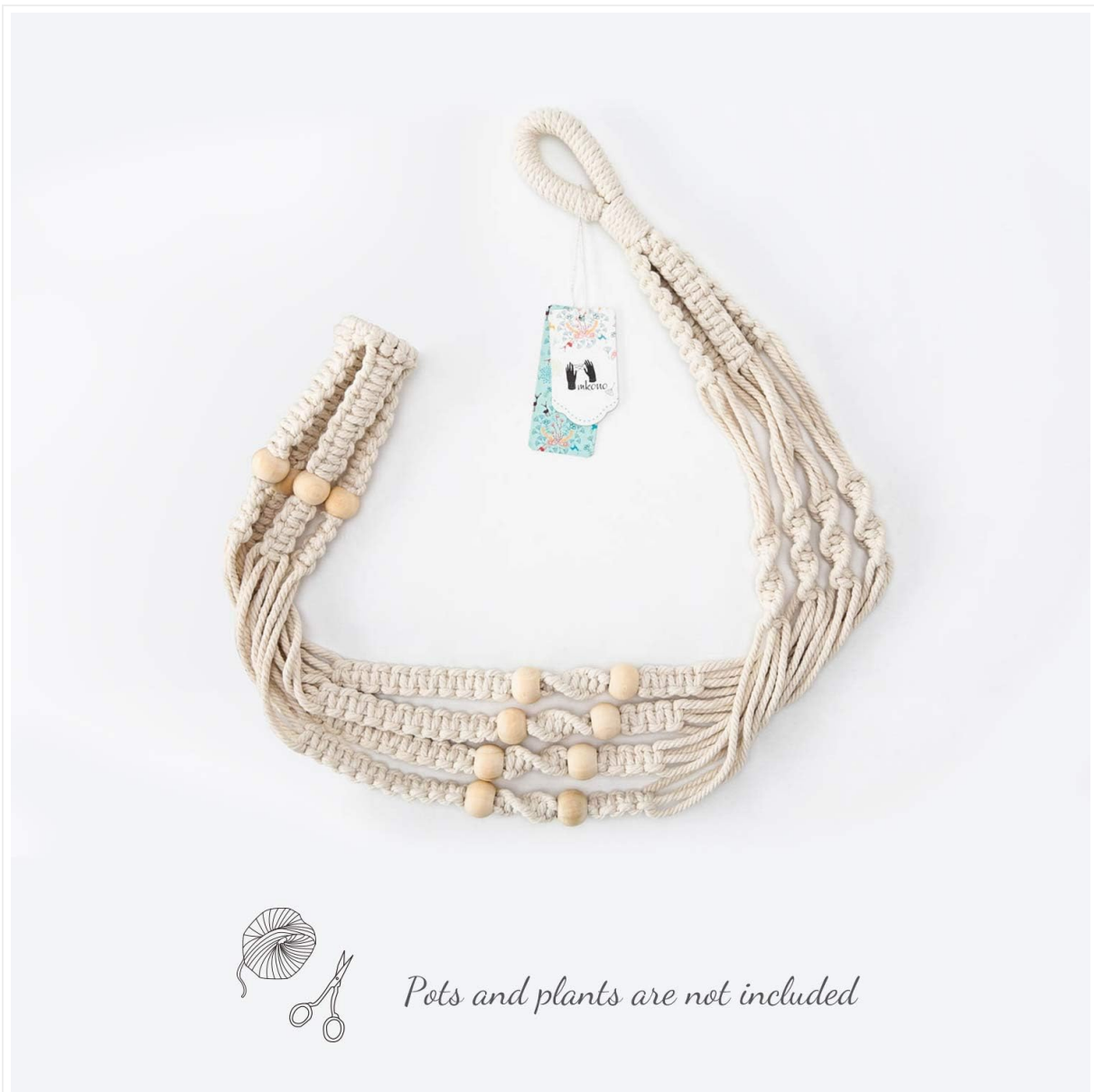
Image 2: The macrame plant hanger folded, highlighting the woven cotton cord and wooden beads.