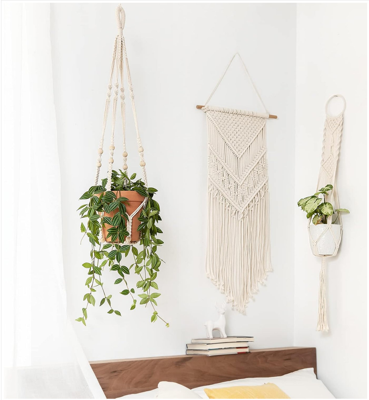
Image 1: The Mkono Macrame Plant Hanger in an indoor setting, showcasing its design and how it holds a potted plant.