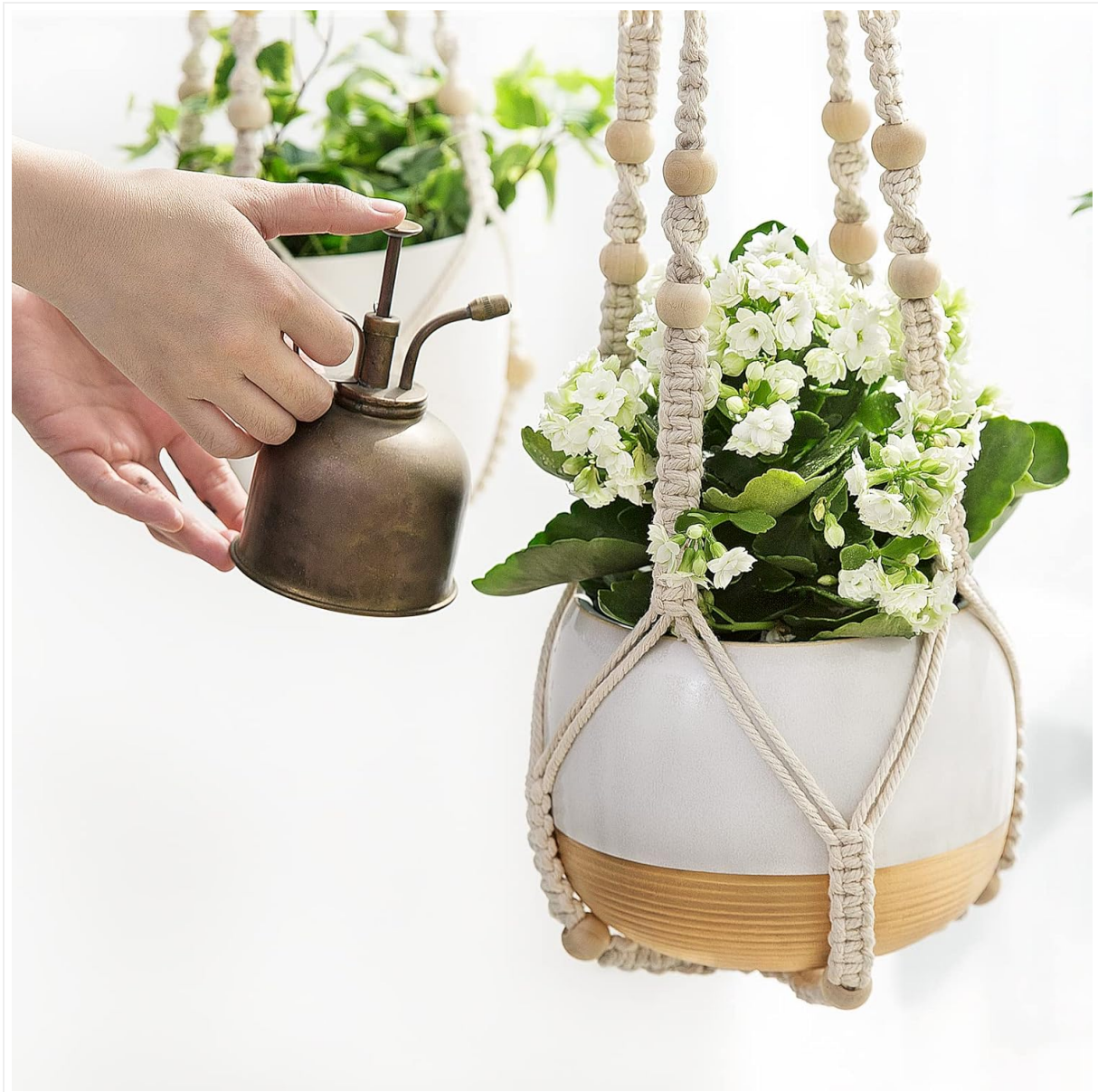
Image 4: A plant in the macrame hanger being watered, illustrating the ease of access for plant care.