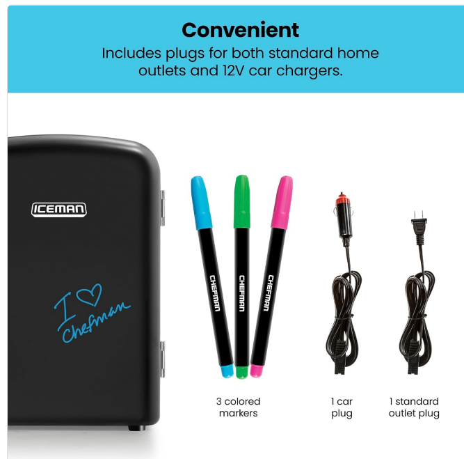
Image: The Iceman Mini Portable Personal Fridge shown with its included AC and DC power cords, and the three dry-erase markers. This illustrates the convenience of its dual power options and the dry-erase feature.

Note: Ensure the fridge is OFF before connecting or disconnecting power cords.