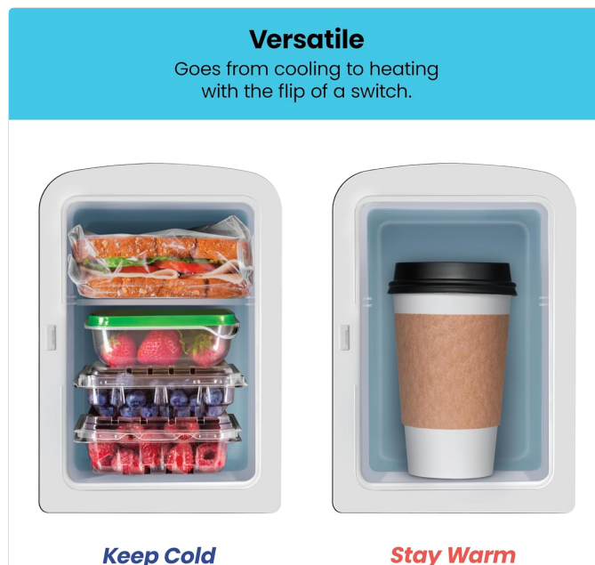
Image: A visual representation of the fridge's versatility, showing one side filled with cold items like berries and a sandwich, and the other side with a warm beverage, demonstrating its cooling and heating functions.