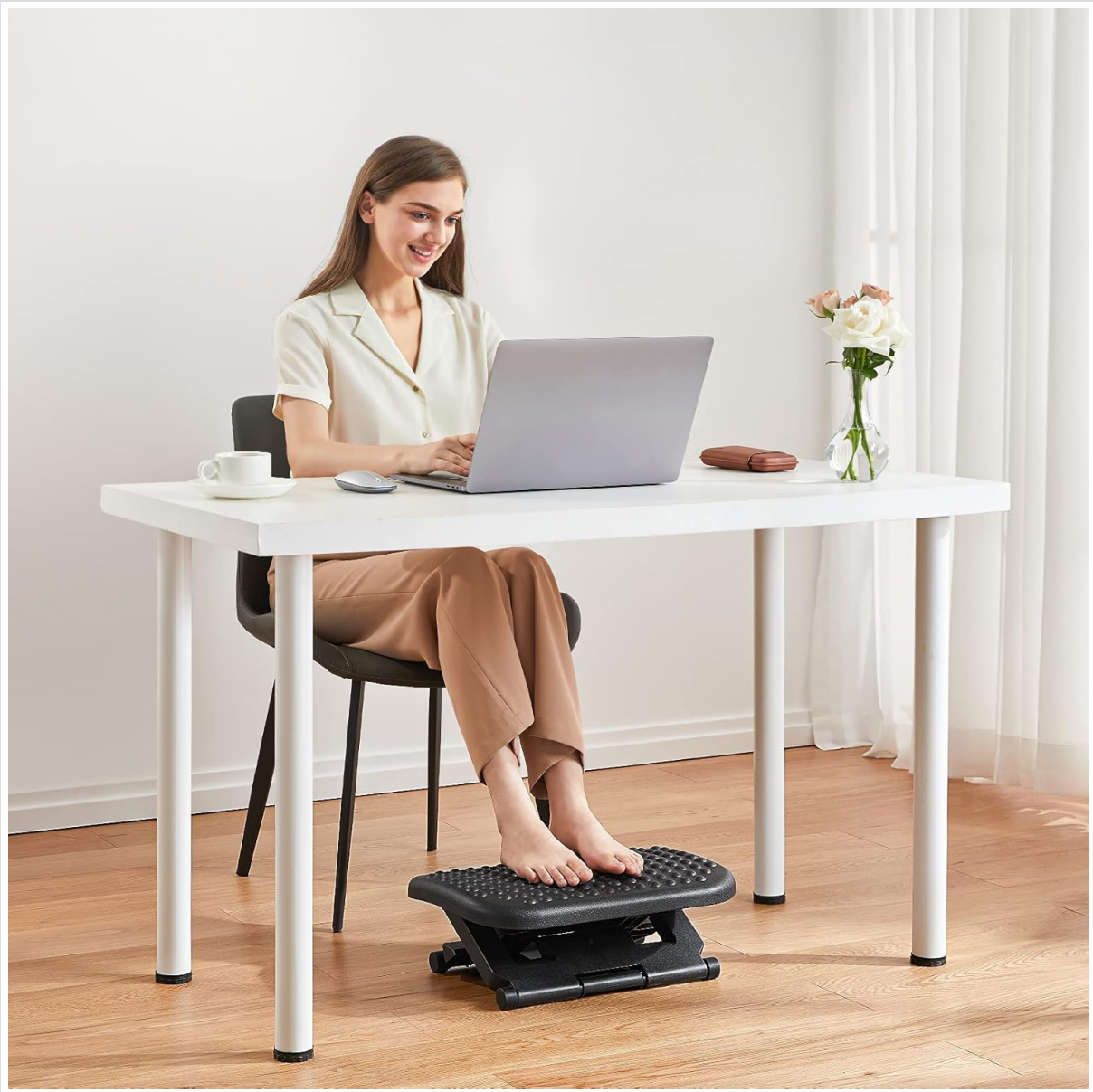
Image 1.1: User demonstrating proper ergonomic posture with the footrest.