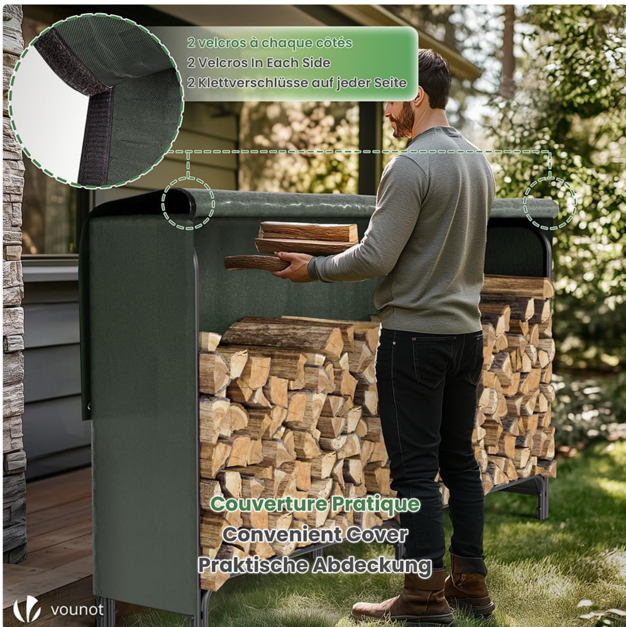
Image: A user accessing firewood from the rack, highlighting the practical design of the waterproof cover with side openings.