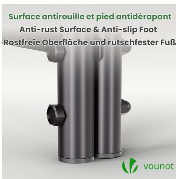
Image: Key features of the log rack, including the elevated base to keep wood dry and reinforced stability for safe storage.