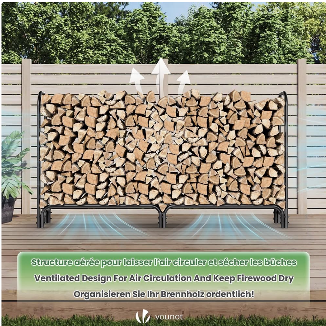
Image: Illustration of the ventilated design, which promotes air circulation to keep firewood dry and seasoned.