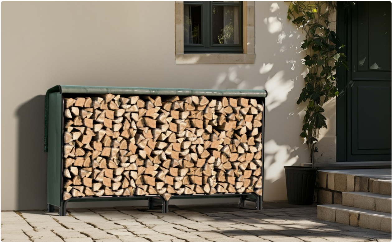
Image: The log rack with its cover providing protection against various weather conditions, including rain and snow.