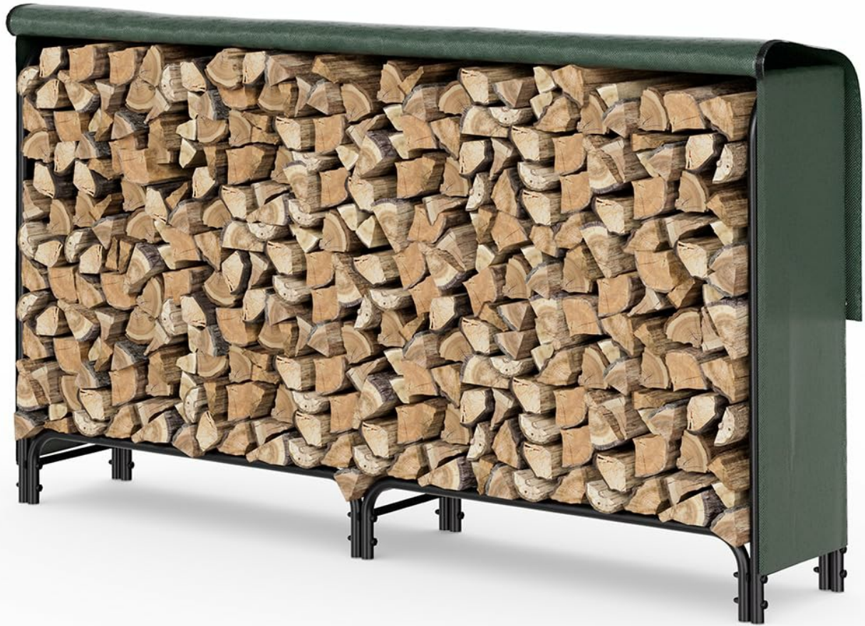
Image: The VOUNOT Metal Outdoor Log Rack, fully assembled and filled with firewood, demonstrating its capacity and organized storage.