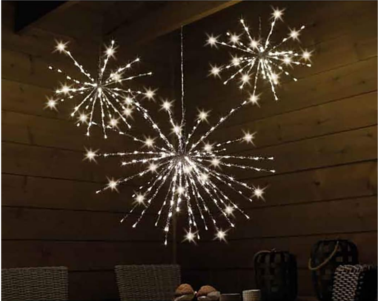
Image: Three Lumineo Polestar lights displayed together in an outdoor covered area, demonstrating their decorative effect.