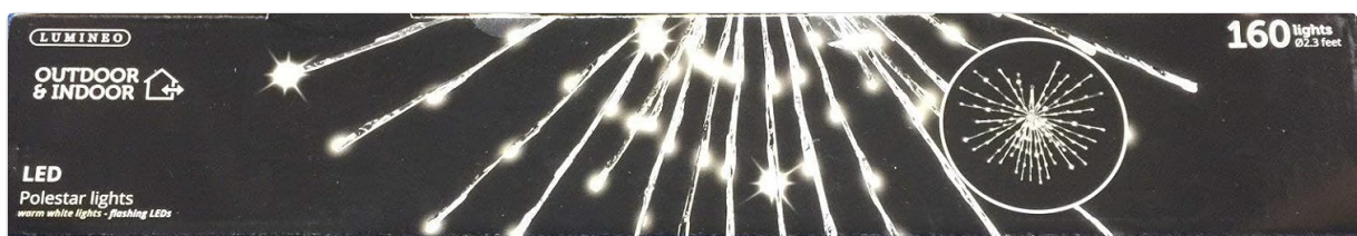
Image: The Lumineo Polestar fully illuminated, showcasing its warm white flashing LED lights.