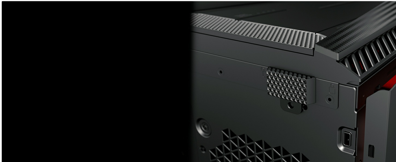
Figure 3: Side panel removed, demonstrating tool-less access for component upgrades.