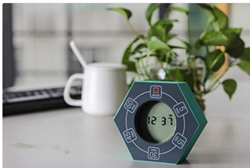
Image: The timer in use on a desk, demonstrating its practical application.