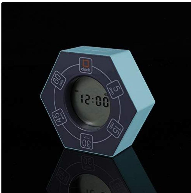
Image: The timer's backlit display, visible in a dark environment.

Press the "SNOOZE/LIGHT" button located on the top of the timer to temporarily silence an active alarm or to illuminate the display backlight for a few seconds in low-light conditions.