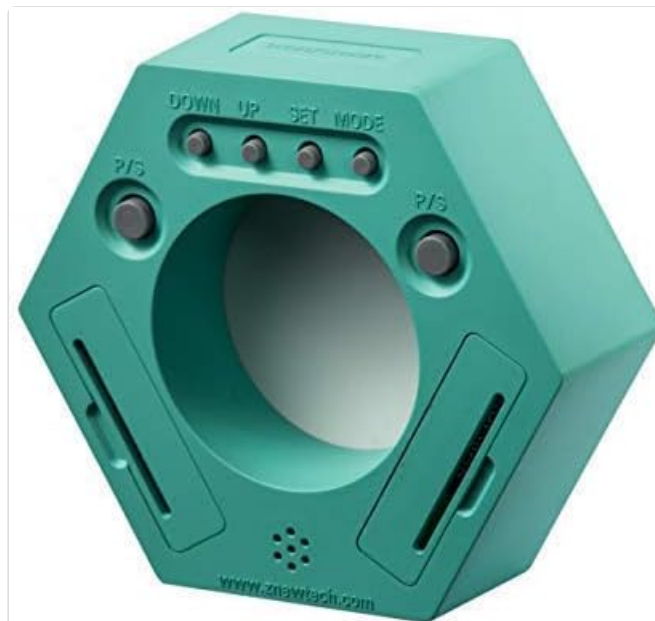
Image: Rear view of the timer, highlighting the battery compartment and control buttons for setup.