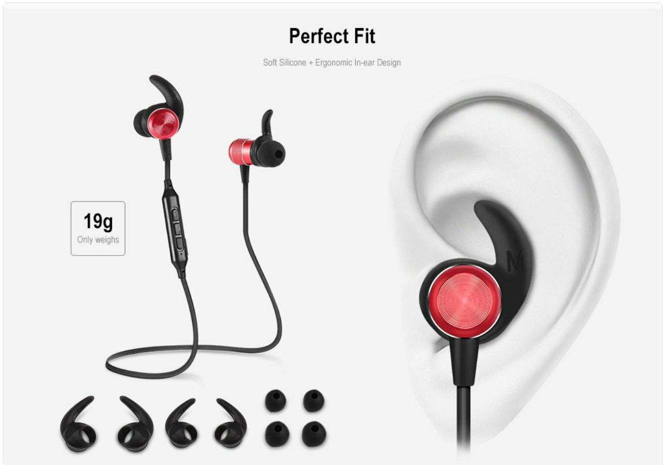
Image 3.2: The sweat-proof and lightweight design makes the earphones suitable for various activities like running, yoga, and cycling.