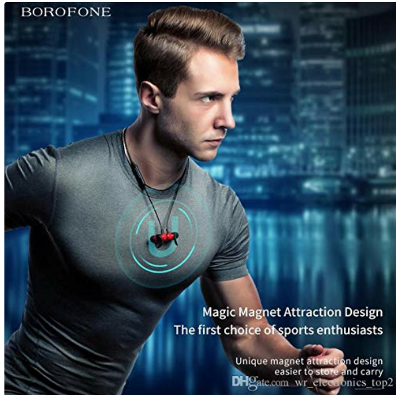
Image 3.1: The magnetic absorption design allows the earphones to be worn securely around the neck when not in use.

The BOROPHONE BE5 earphones feature magnetic earbuds. When not in use, the earbuds can be magnetically attached to each other, forming a necklace-like loop around your neck. This design helps prevent loss and provides a convenient way to carry them.