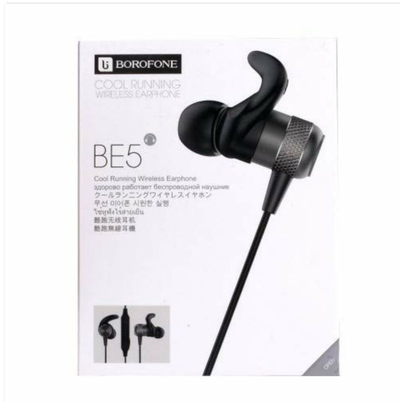
Image 6.1: Key technical parameters of the BOROFONE BE5 earphones.