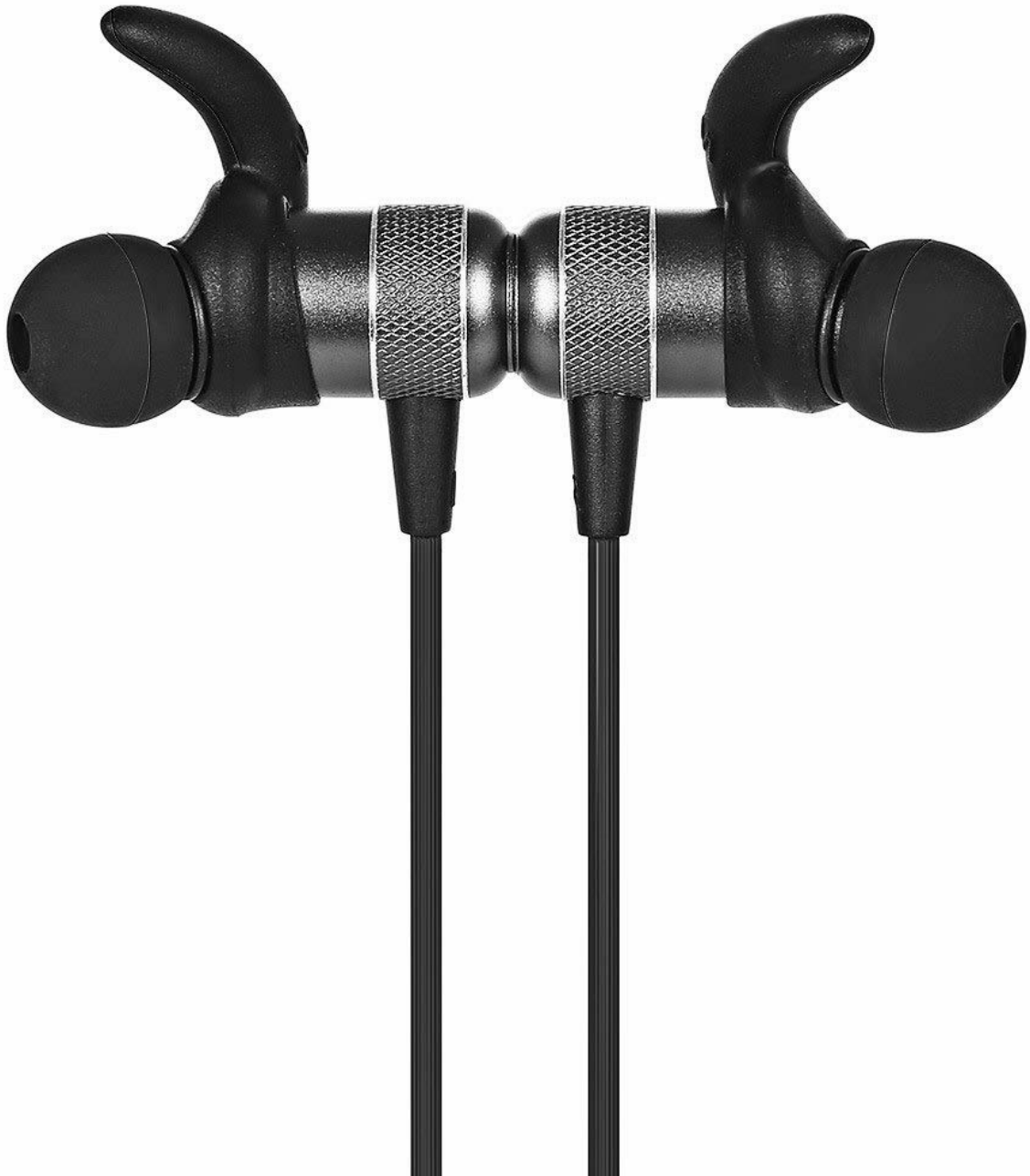
Image 1.1: Front view of the BOROFONE BE5 Magnetic Absorption Portable Wireless Bluetooth Earphones.