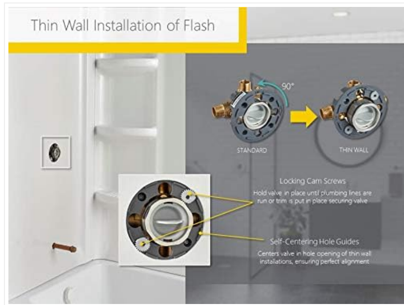
An illustration demonstrating the thin wall installation method for the Flash valve, showing locking cam screws and self-centering hole guides for precise alignment.