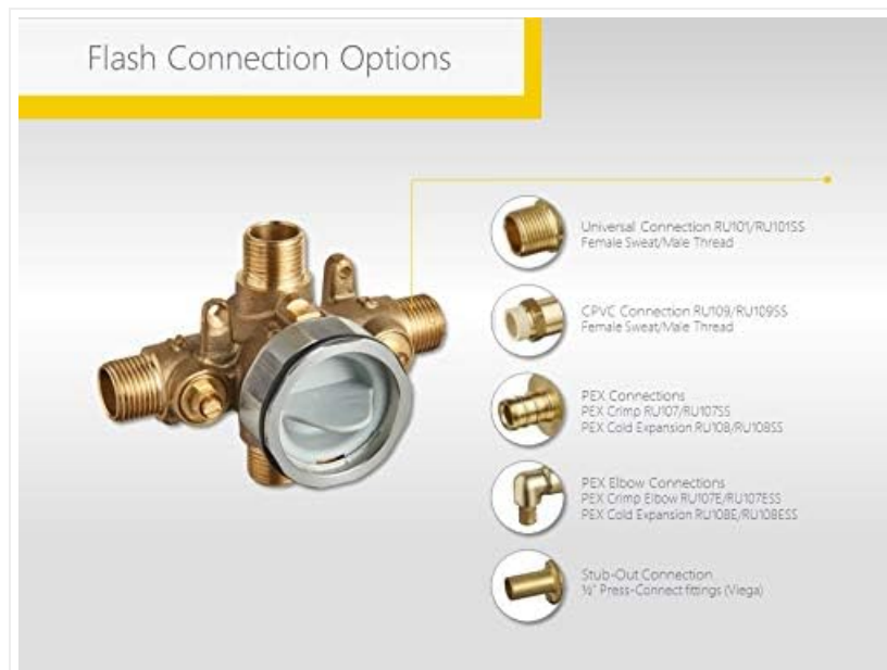
A diagram outlining various connection options for the Flash valve, including Universal, CPVC, PEX, and Stub-Out connections.