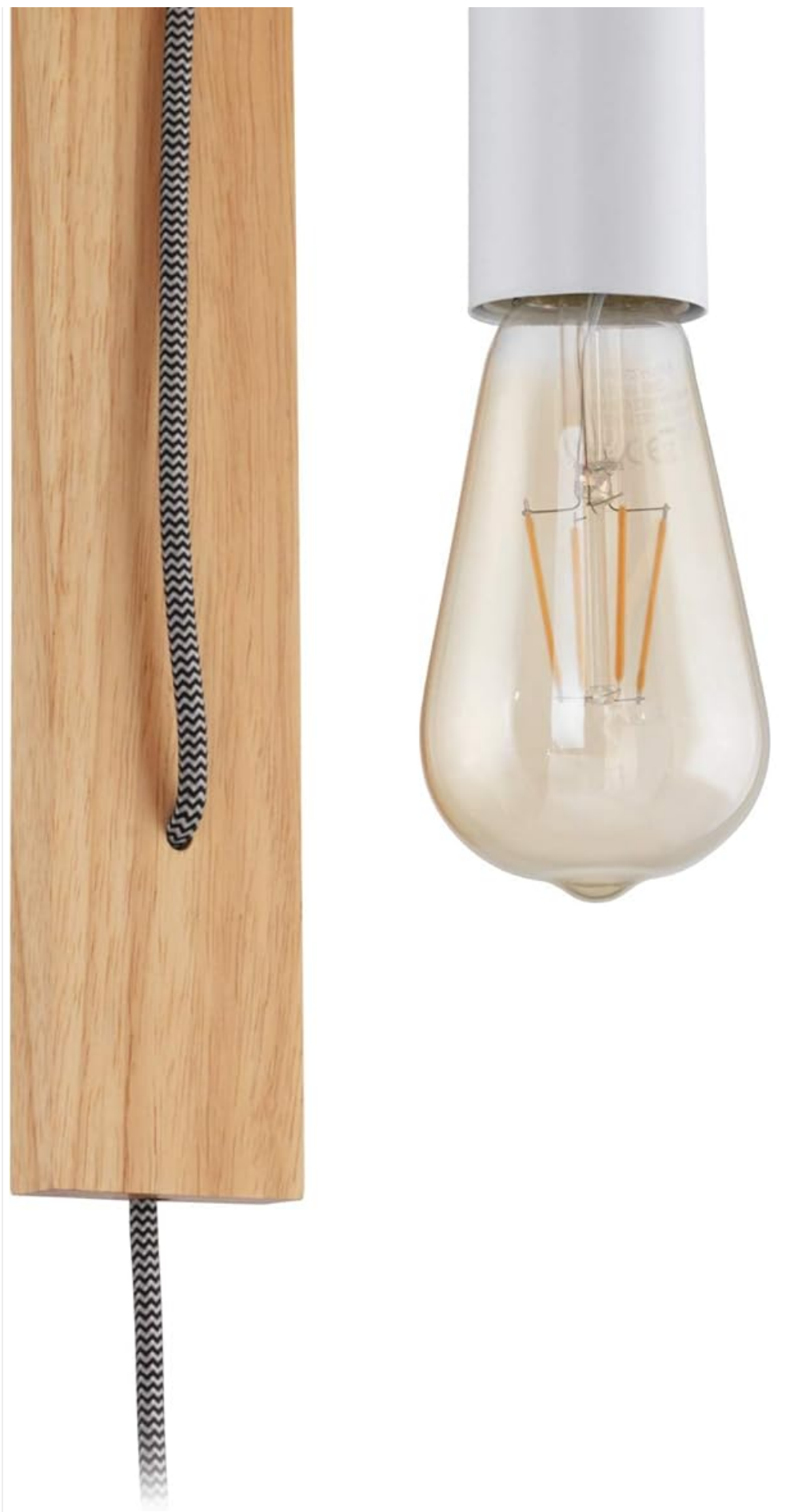
Image: Front view of the EGLO TOCOPILLA wall lamp, showcasing its wooden arm and white bulb holder with a vintage-style LED bulb.