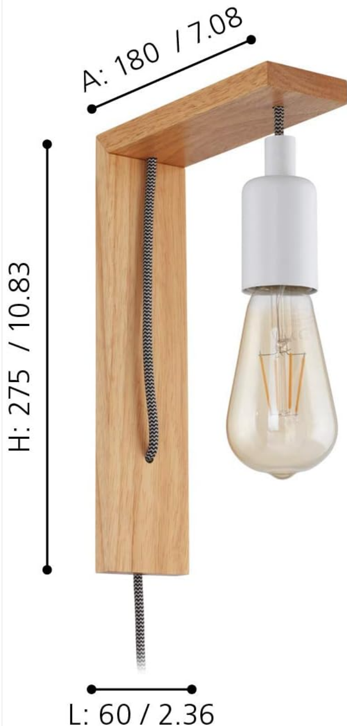
Image: Technical drawing illustrating the dimensions of the EGLO TOCOPILLA wall lamp. Height (H) is 275 mm (10.83 inches), Length (L) is 60 mm (2.36 inches), and Arm depth (A) is 180 mm (7.08 inches).

Dimensions: 6 x 18 x 27.5 cm (Length x Width x Height)