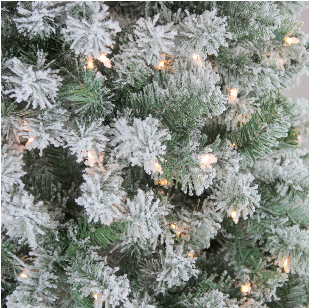
Figure 3: Detailed view of the flocked pine branches, illustrating the texture and tip design.