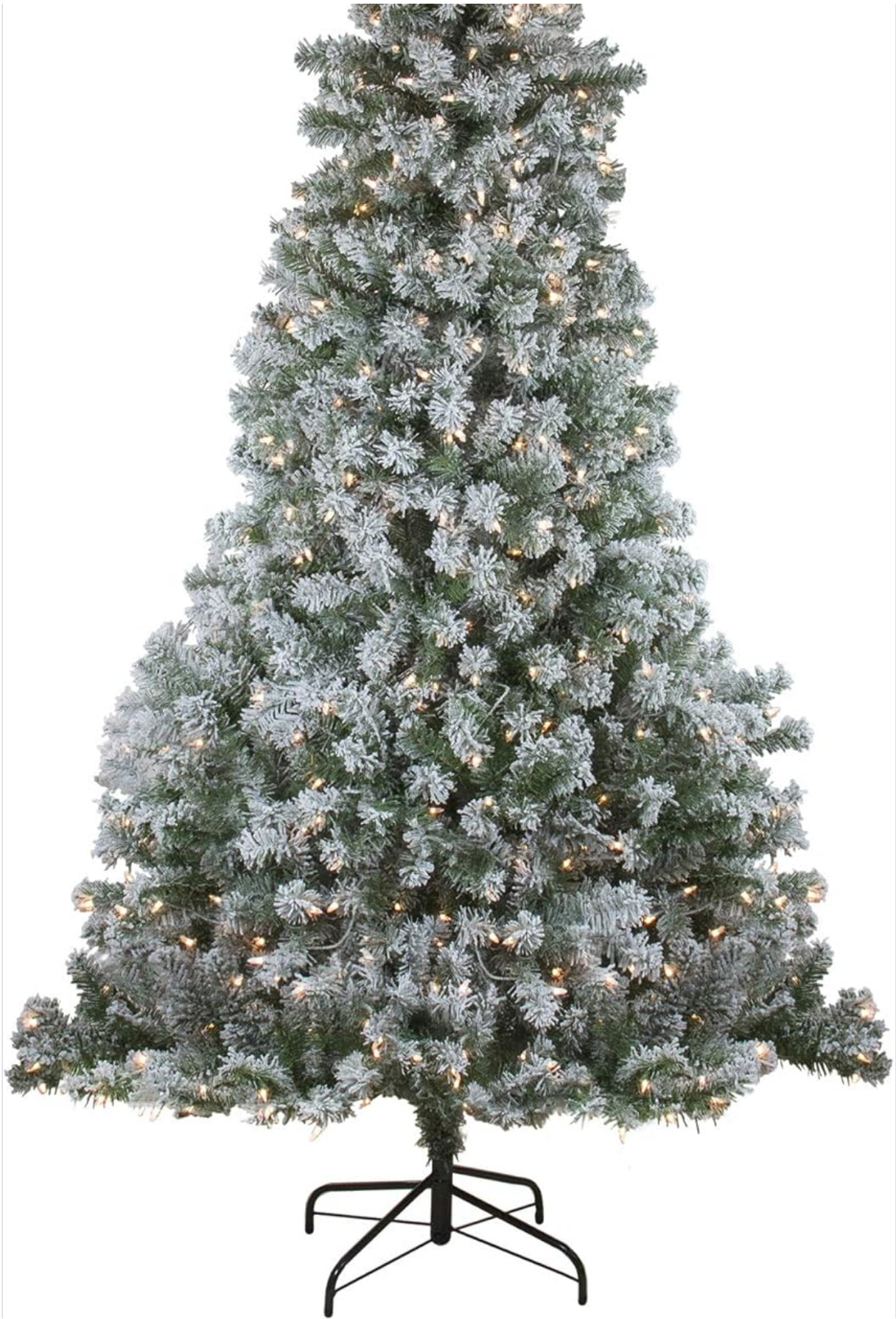
Figure 1: The Northlight 7.5-Foot Pre-Lit Winema Pine Flocked Artificial Christmas Tree.