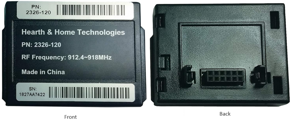
Image 2: Front and back view of the IFT-RFM Wall Mount Radio Frequency Module (PN: 2326-120).