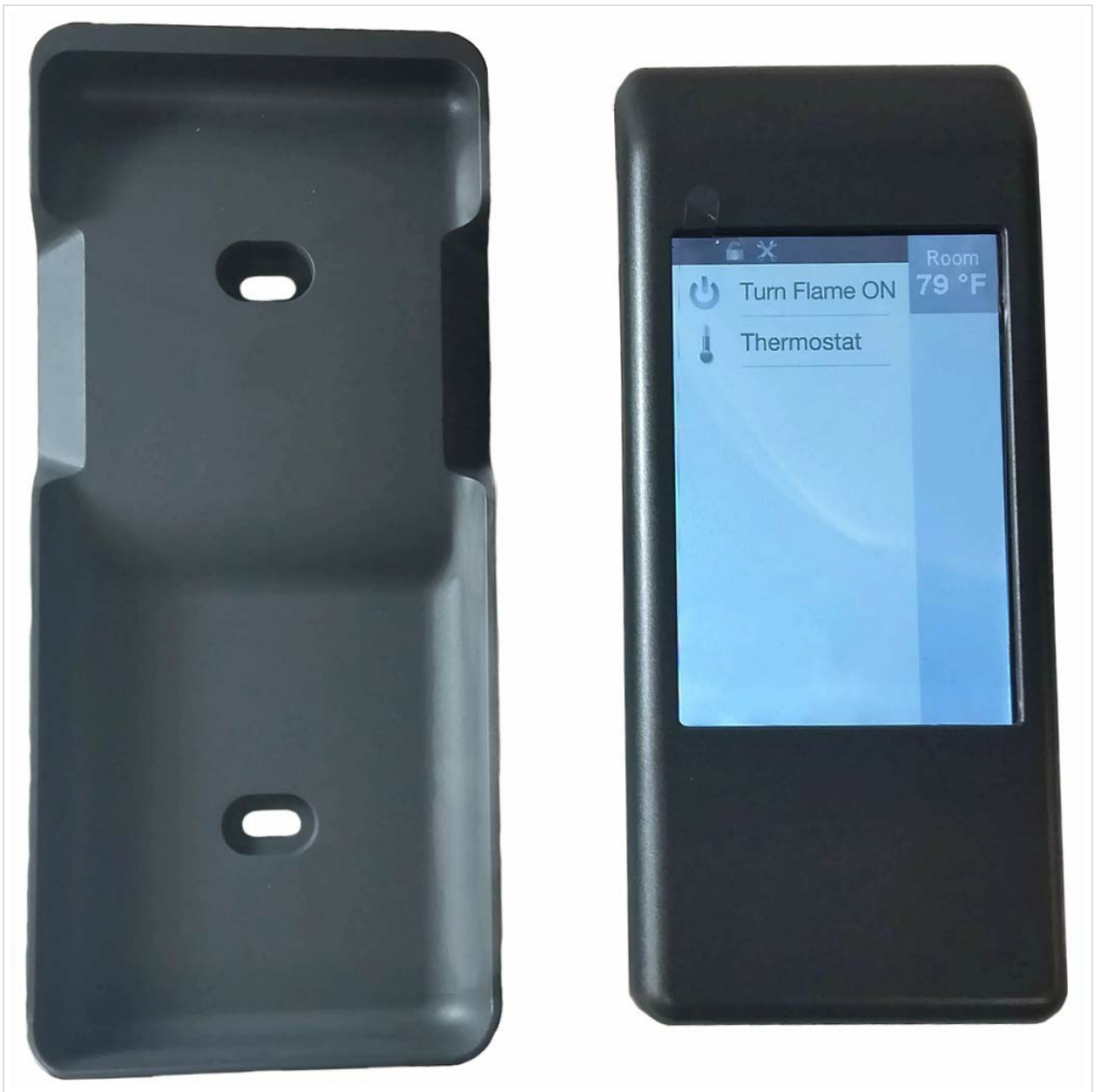
Image 1: Majestic RC400 Remote Control and its Wall Mount Docking Station.