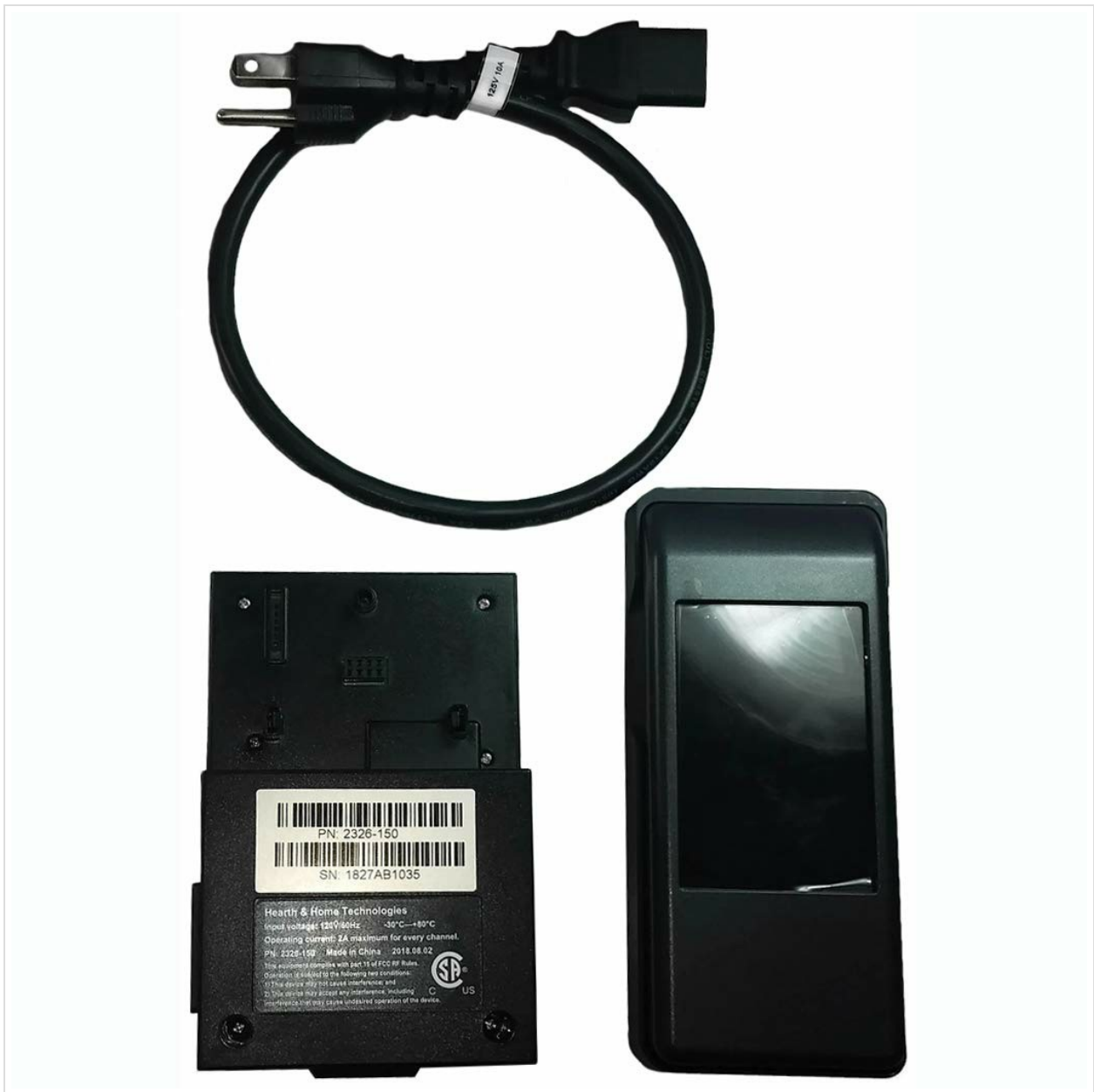
Image 3: IFT-ACM Auxiliary Control Module (PN: 2326-150) and its power cable.