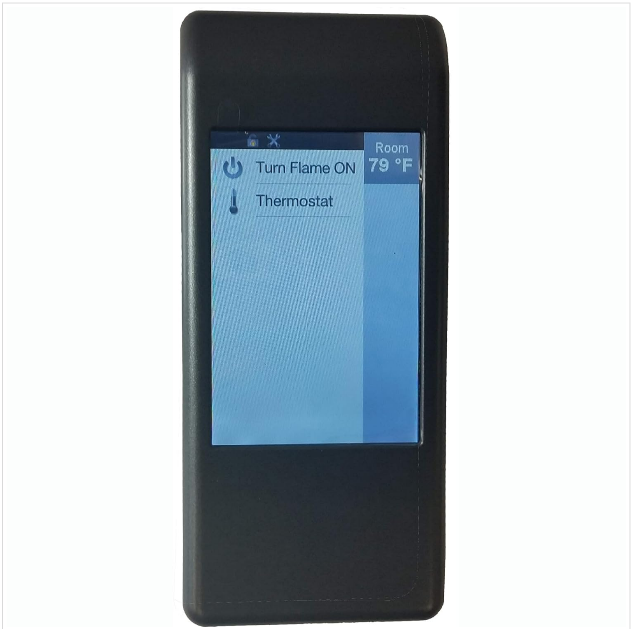
Image 5: Remote screen displaying 'Turn Flame ON' and 'Thermostat' options with room temperature.