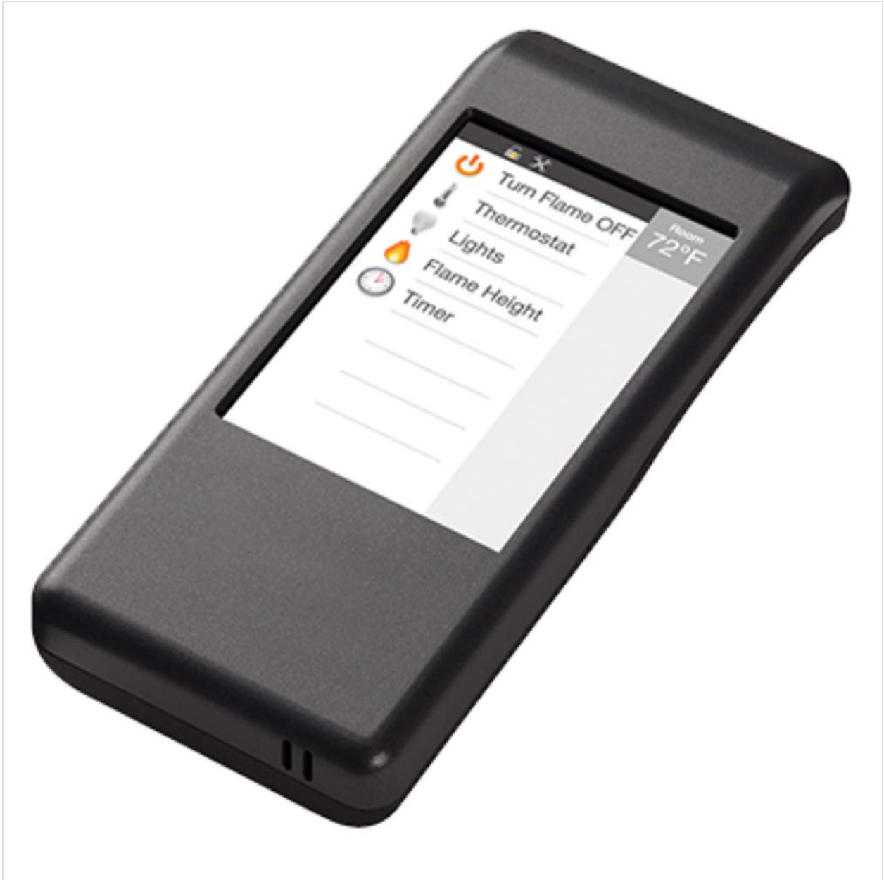
Image 4: Main screen of the Majestic RC400 Remote Control showing various options.

The RC400 remote control features a large touch LCD screen for easy navigation and operation.